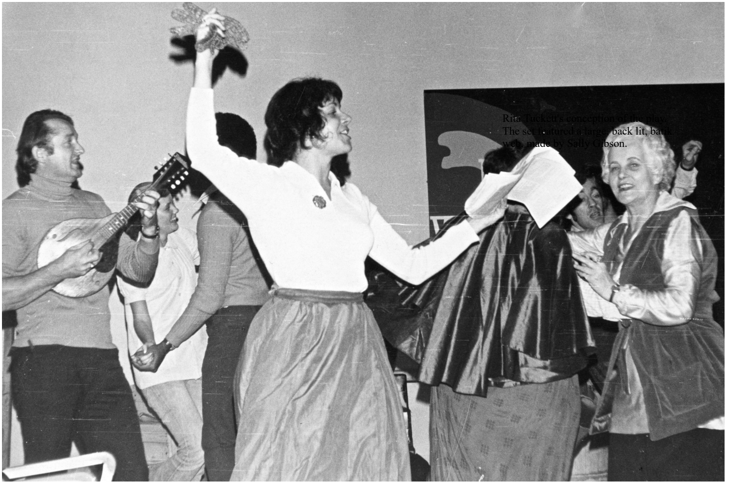
Rita Tuckett's conception of the play. The set featured a large back lit, back wall made by Sally Gibson.