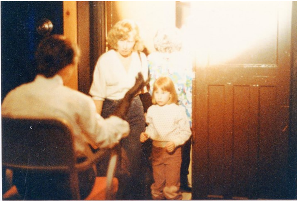
View of performers and audience members.