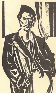
EZRA POUND - 1919