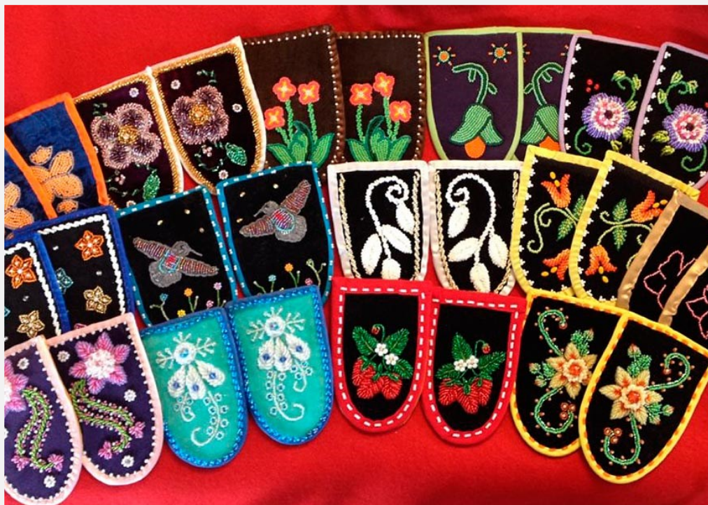
Vamps by the Catt Rez Beaders