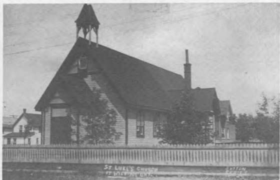
Prior to 1916