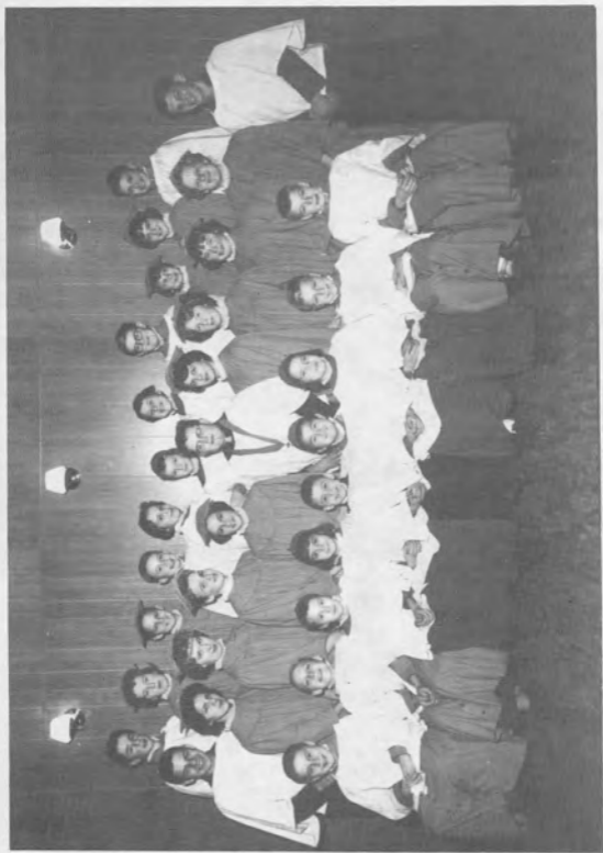
Junior Choir of late 1950's