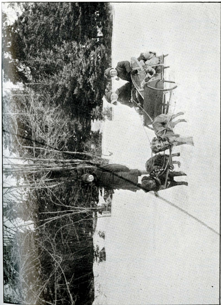
Shingwauk Boys and Dog Team.