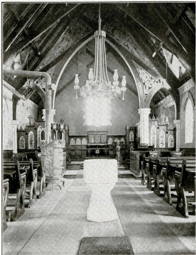
Bishop Fauquier Memorial Chapel—Shingwauk Home.