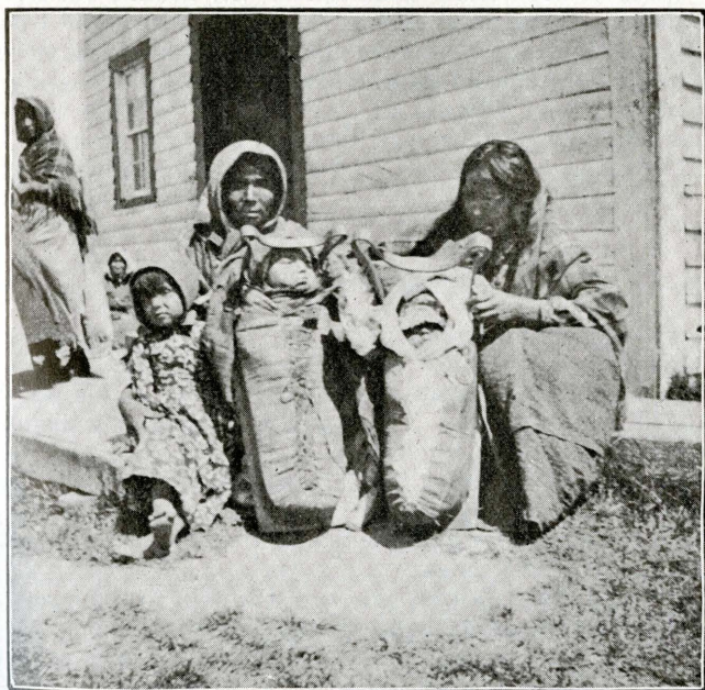
Indian Mothers and Babies.