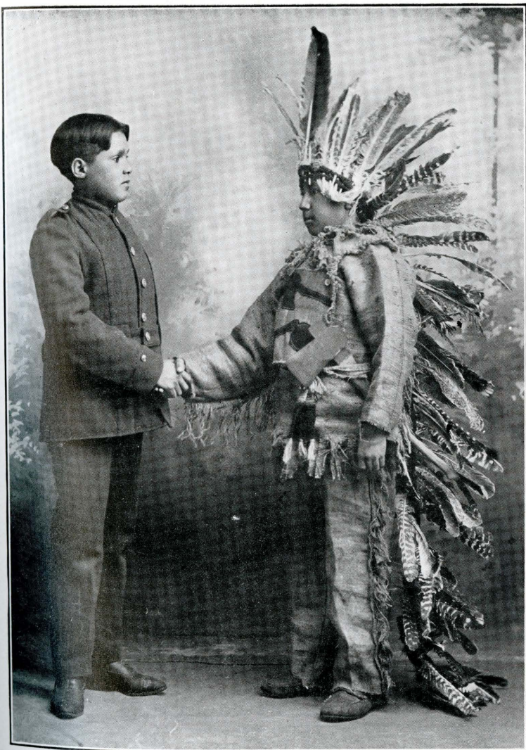
"The same Tribe"