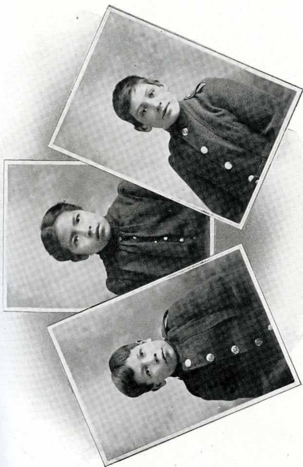
"Fair Types"—Pupils of the Shingwauk and Wawanosh Homes