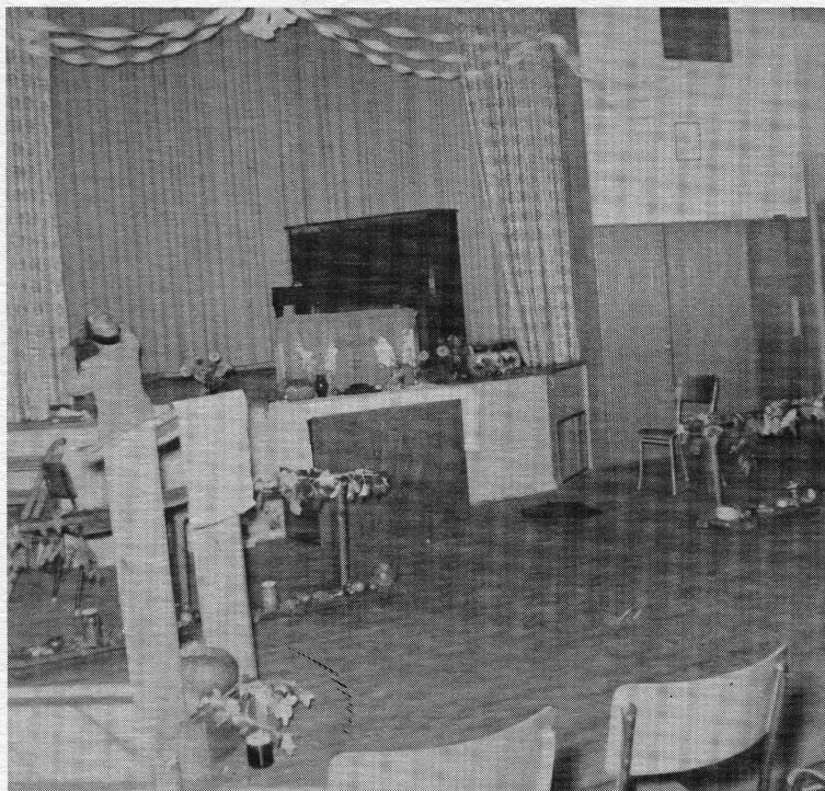
Thanksgiving Service In Mine Mill Hall.