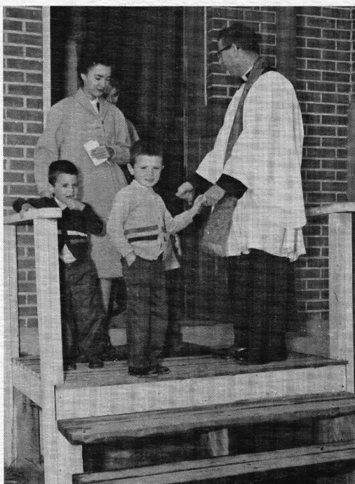
One of Our First Services In the basement of our New Church

1958 to 1960 the Basement was used for our services.