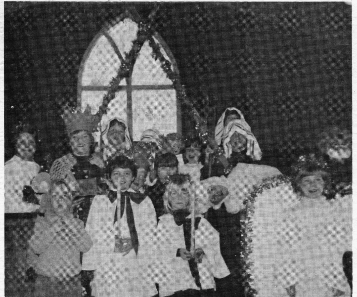
Christmas Pageant 1977

Consecration Service for the Church and burning of the Church extension loan were held in conjunction with the Dedication Service of our New Narthex