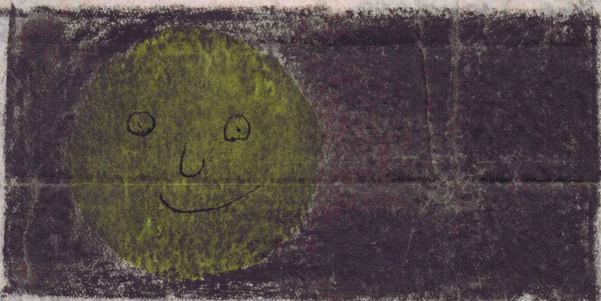
THIS EXTRAORDINARY PHOTOGRAPH TAKEN BY MOONLIGHT GIVES A SPLENDID IDEA OF THE CITY AND ITS SURROUNDINGS. THE NEW SHOE FACTORY CAN BE SEEN TO THE RIGHT. THE PICTURE WAS TAKEN A FEW DAYS AGO.....