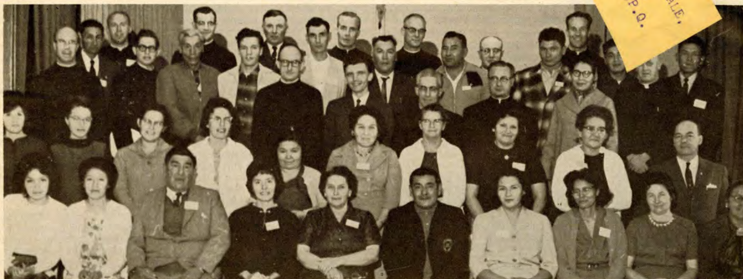
Delegates to the second annual Catholic Indian League Conference, Saskatchewan Division, held at Lebret in November.

JAN-66 7 1386 MERE SEC. GENERALE 1190 RUE GUY MONTREAL 25 P.Q.