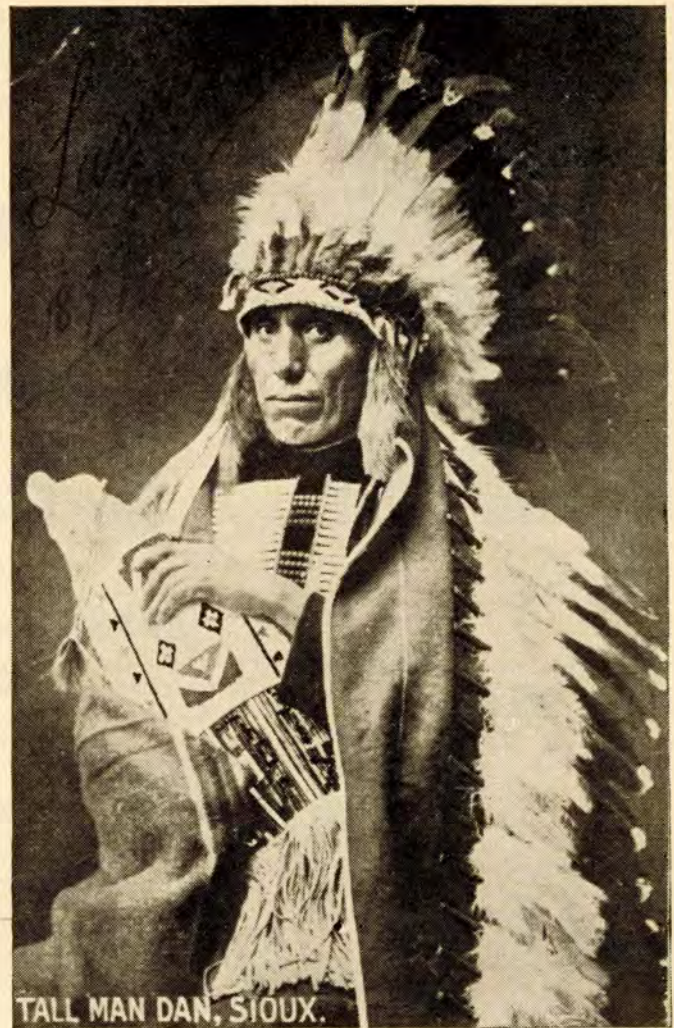
TALL MAN DAN, SIOUX.

Following Little-Crow's visit came Sakpe (Little-Six), chief