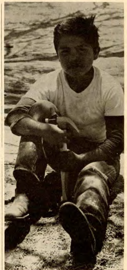
Taking a rest between chores, this lad is learning carpentry at summer work camp.

It is hoped that the tasks these boys perform and the experiences they gain together will help them