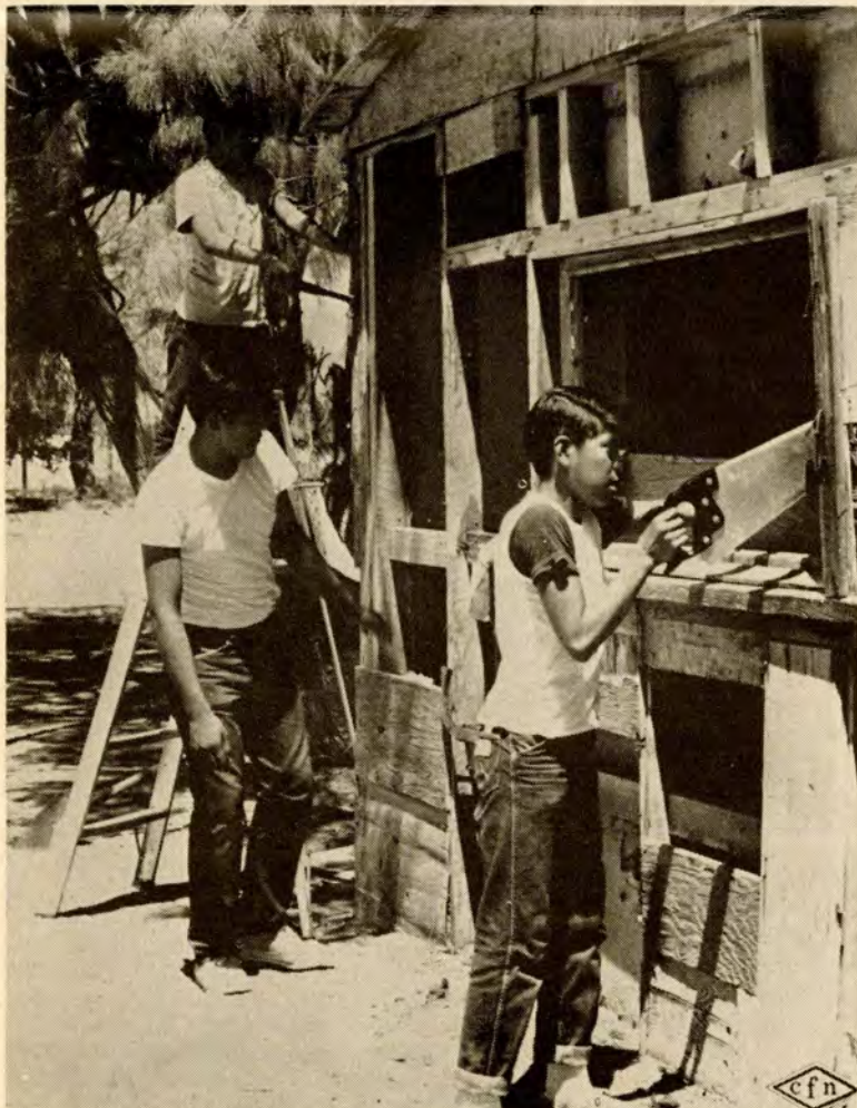
Yavapai teenagers remodel an old building into a Community Centre at a summer work camp, Fort McDowell, Arizona.