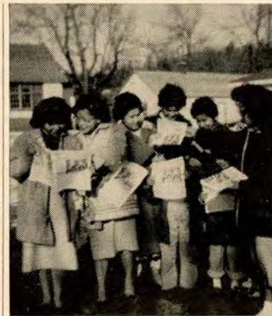
St. Mary's Indian Residential school girls, at Mission City, B.C., are eager to read every new issue of the INDIAN RECORD. All ages are interested in their "own Indian paper". The pupils send home their papers once they have read them.

● No one is quite sure of the meaning of this name which has been applied to one of Canada's most famous salmon rivers, to a county in northern New Brunswick and to a Quebec community on the north shore of the river's estuary. Restigouche is a render-