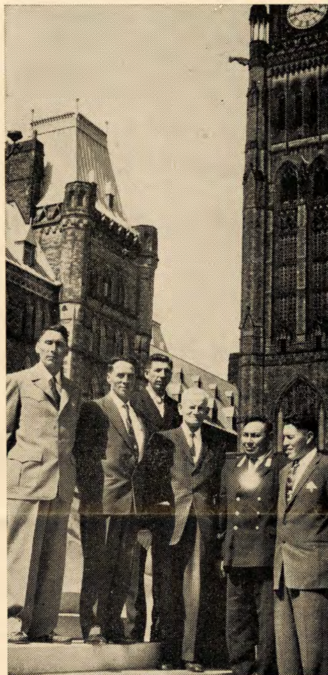
Members of delegations from the Blackfoot and Blood Indian reserves in Alberta are seen on the steps of the Parliament Buildings in Ottawa with Senator James Gladstone, the first Indian Senator. The delegates had presented briefs to the joint Indian Affairs committee.

"The fund would not dispend Indian Affairs branch or other public agencies from discharging their respective responsibilities. It would simply give the Indians something through which they could pull themselves by their own boot straps economically and culturally."