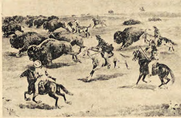
Typical hunting scene in Saskatchewan before 1900.