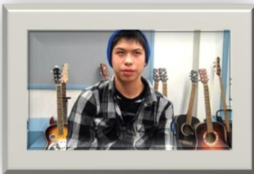
A youth interviewed in Panniqtuuq, Nunavut

ITN provided them with a few camera tips and interview guidelines to record creative, personal stories. After conducting interviews and gathering footage in the Inuit language or English, they sent USB sticks with the material to our film editor. And for not a whole of money, presto! we produced seven, short, bilingual quitting stories, an introductory video, and one PSA to help encourage others on their path to quitting. The youth participants were allowed to keep the cameras after the project was completed. These by-youth-for-youth stories were posted on YouTube to reach a wide youth audience.