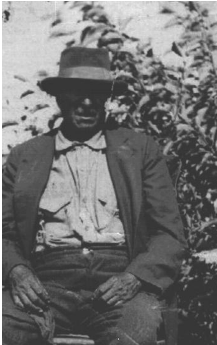
WILLIAM MORRISSEAU SR. BAND No. 71 – COUCHICHING FIRST NATION born 1851 – died 1931