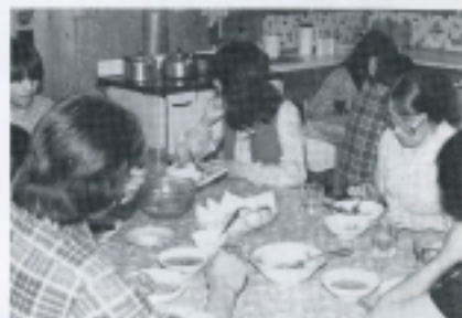
A delicious meal.