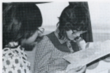
Which way, Dorothy?