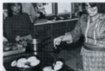
um . . . doughnuts