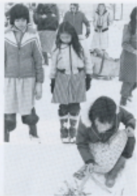
First the fire . . .