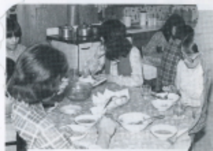
A delicious meal!