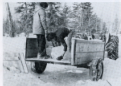
Filling the new icehouse.