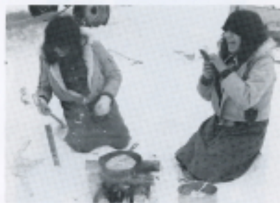
then the bannock