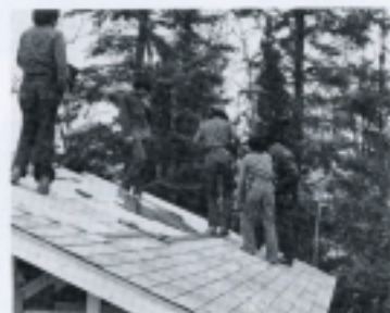
Putting a roof on the new icehouse.