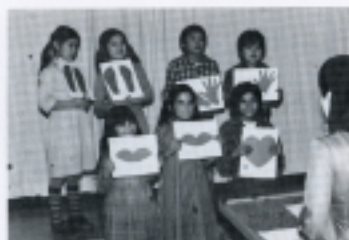
I'll give Him myself.