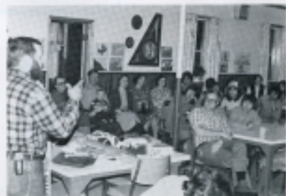
Who'll give a dollar?