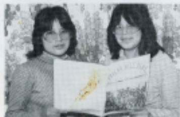
First Term Editors