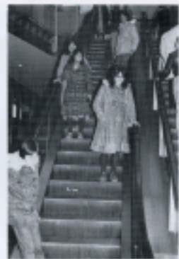
Coming down the easy way.