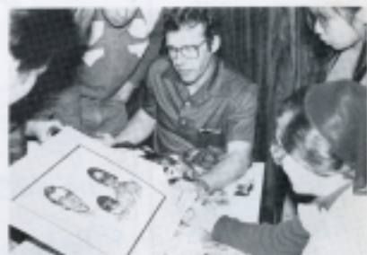
A nice piece of art.