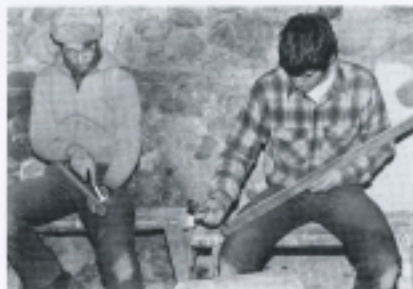
Cleaning the boards