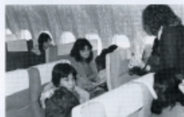
A visit to the airport