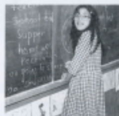
Practice makes perfect.