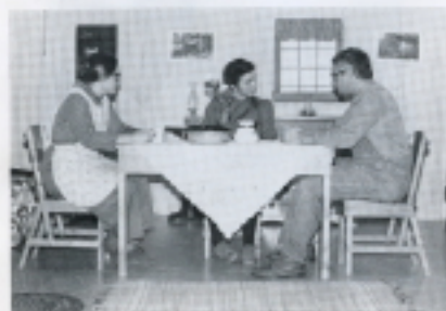
"Anne of Green Gables"