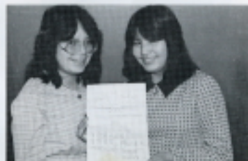
Second Term Editors