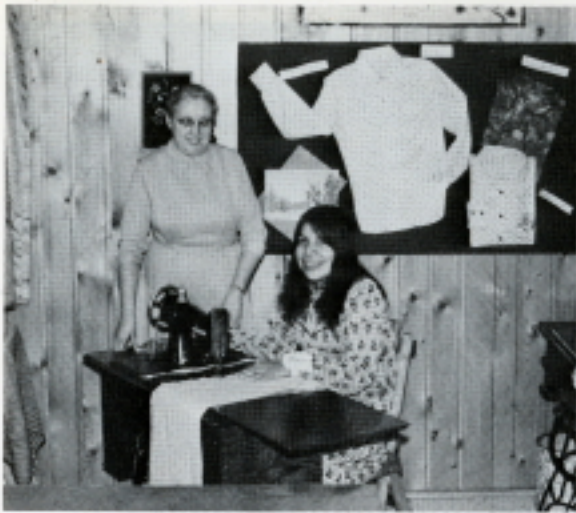
Sewing by Machine