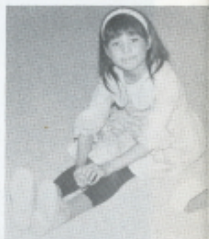
What did you say?