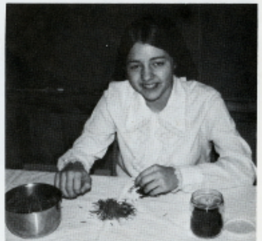
Cleaning Wild Rice