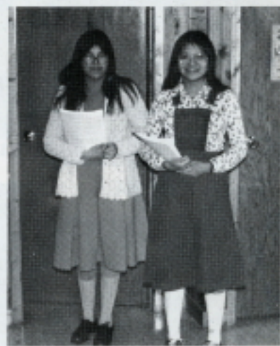
Second - term Editors