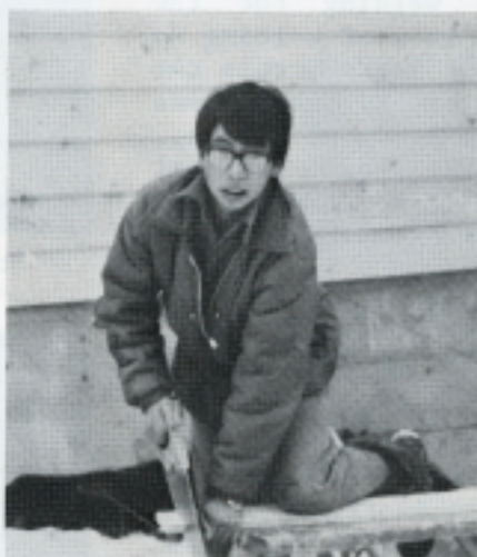
Putting on Siding