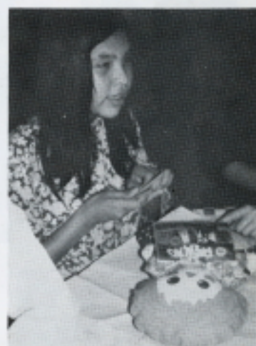
Look what I got.