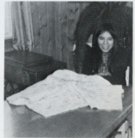
Knotting a Comforter