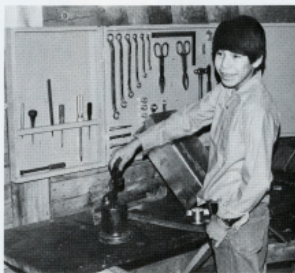
Sheet Metal Soldering

In shop we made some projects like a tool box, dust pan, letter holder, and match box.