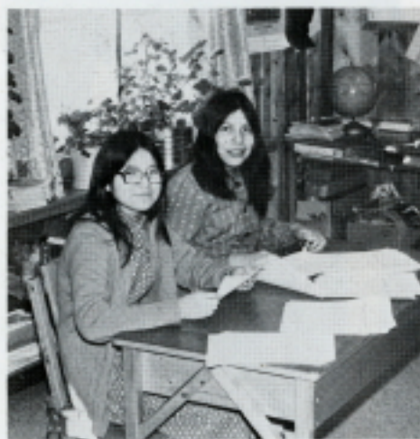
First - term Editors