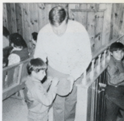
Who's name do I have?