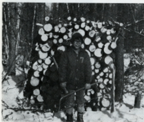
A Cord of Wood