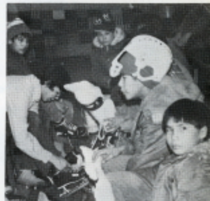
Who has my other skate?