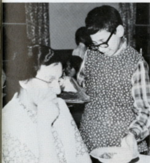
Yum-mm - what's this?