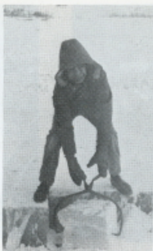
Putting up Ice