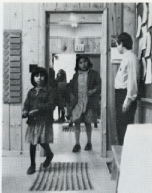
Starting the day

Every day we read in our reading books. Each of us reads a page of the story out loud. Then we answer three questions about the story but we write them in a complete sentence. I like the fairy tales in our reading book the best. Leslie