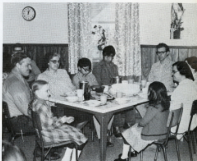
Happy Birthday to you