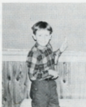
I can print my name.