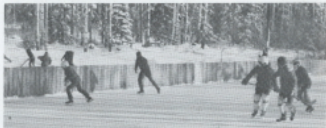
Pass the puck