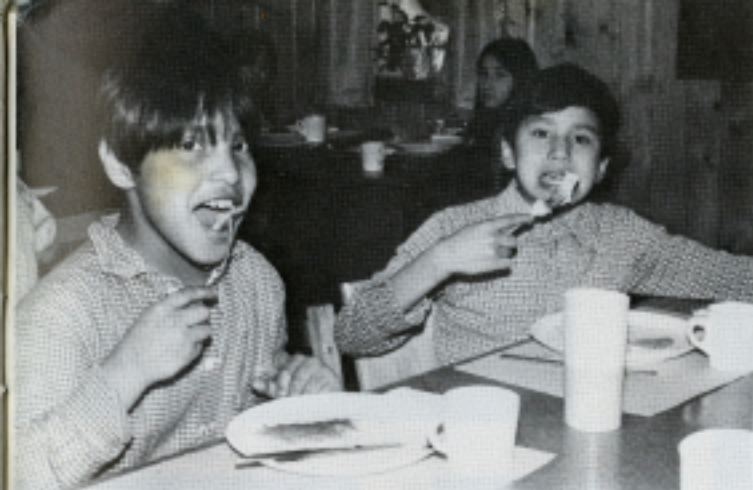
Pancakes are delicious