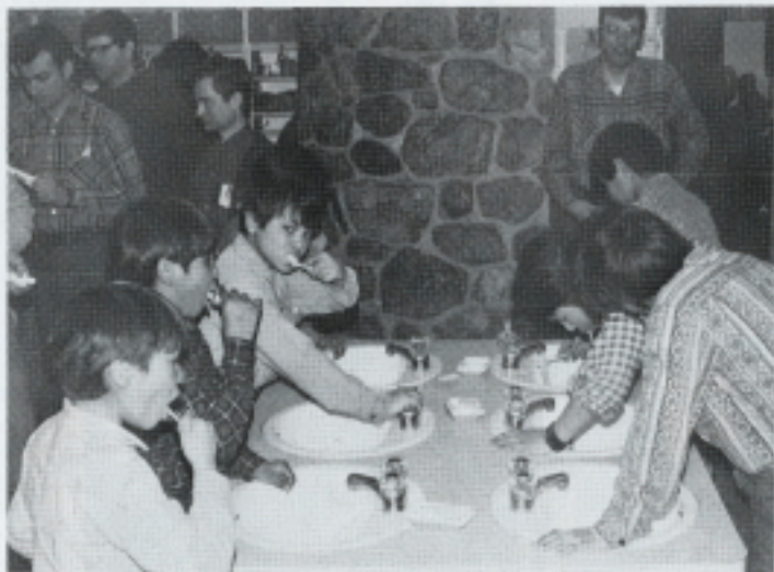
Brush those teeth clean!