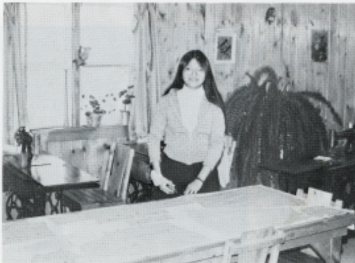
Cutting out a Dress

We have sewing five days a week. First we learn how to operate the machine. For this we use scraps of material to practice on. We also learn the different parts of the machine. We then choose our fabric. We lay the pattern on the material and cut it out. I think sewing is fun. Marie