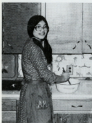
Mixing a Cake