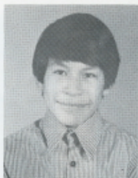
Whiskeyjack Grade 6