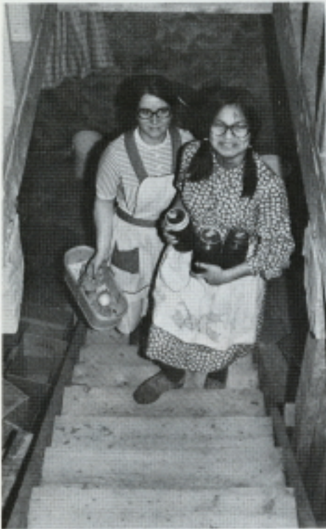
Bringing Food from the Basement