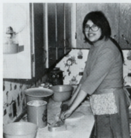
Rolling Cookie Dough