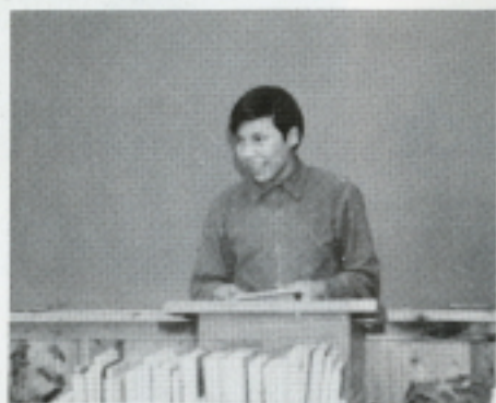
In Speaking Class we learn to write and give speeches.