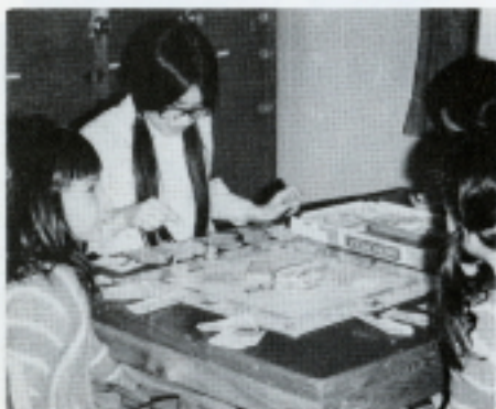
I wonder who is winning?