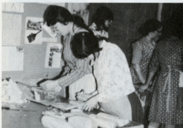
We cut up a quarter of beef into steaks, roasts and soup bones. We learned how to prepare it.