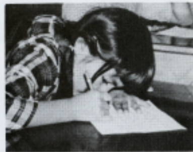
Practice makes perfect.