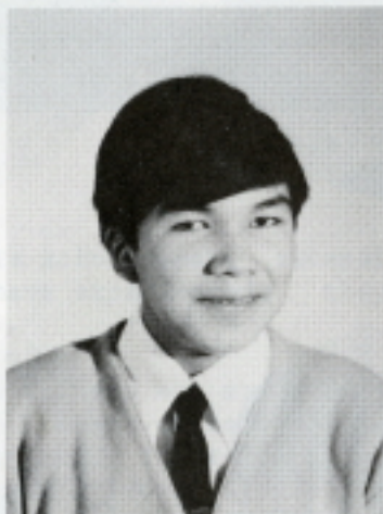
Stanley McKay Angling Lake