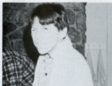
"Oooh, that wakes you up."