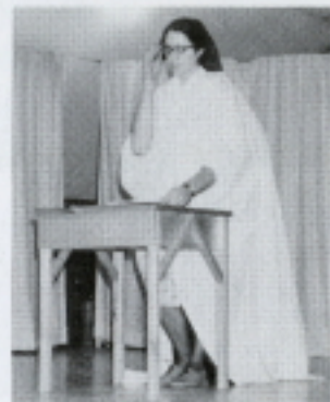
First Skating and Talent Night