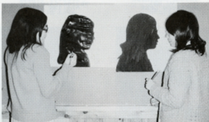
We used a projector to make a shadow. After it was traced, we painted our portraits and hung them on the wall. We can tell who they are.