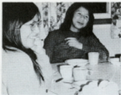
Ice cream for dessert