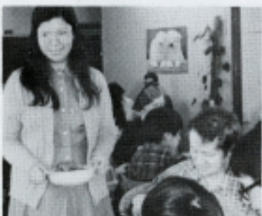
Serving at dinnertime.