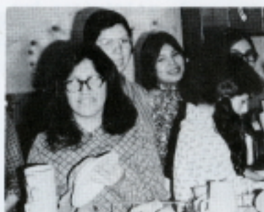
When we all work together how happy we'll be.