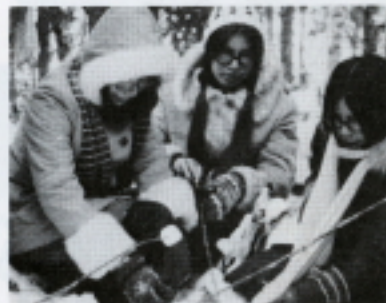
Roasting marshmallows, what a treat!