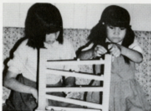
Watch them roll