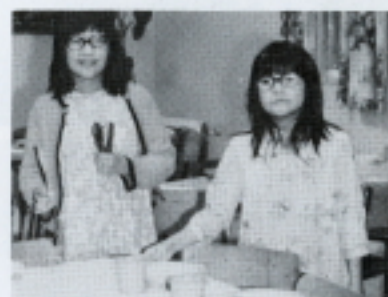
"See how nice you can set the tables."