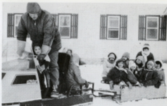
"We like skidoo rides."