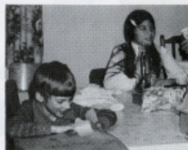
After our Christmas dinner, we opened our gifts.