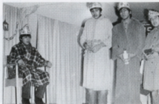
Senior Christmas play, "Unto Us A King"