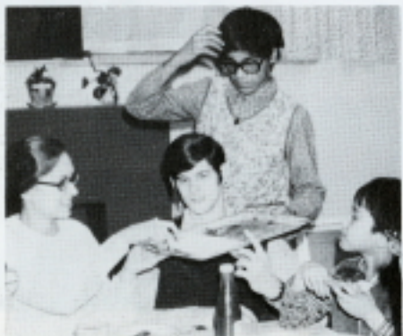
What did you get?