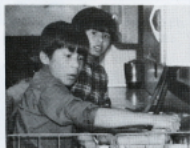
It's chore time for the little people.