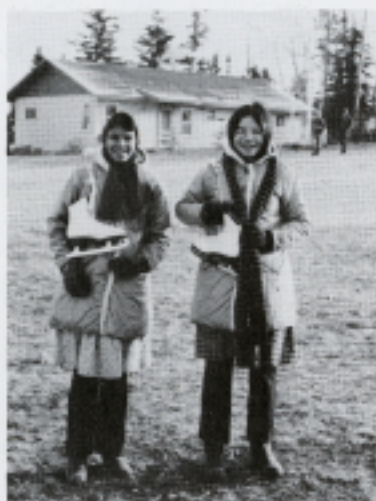
Going skating and no snow!