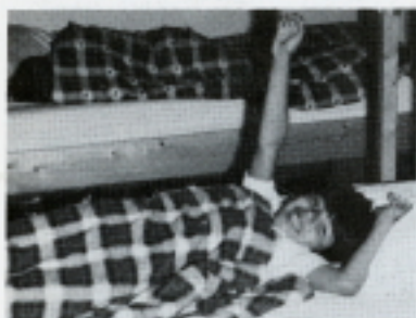
"Good morning, everyone."