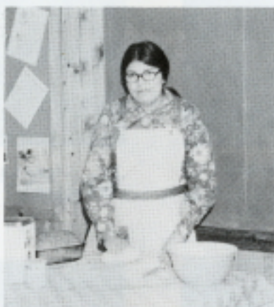
We use flour, yeast, shortening, salt, sugar, and liquid to make bread. After adding the flour we knead the dough. Saloma