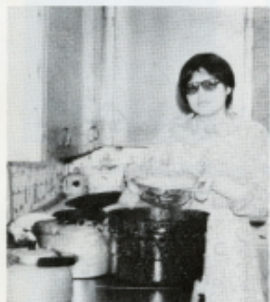
The batter is like a cake. I put it into a bowl and then into a kettle of boiling water to steam. Tins N.