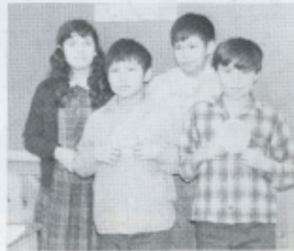
Junior Program Committee