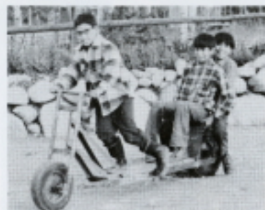
"Watch us go."