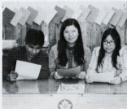
Senior Program Committee