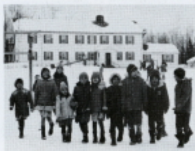
Going to school