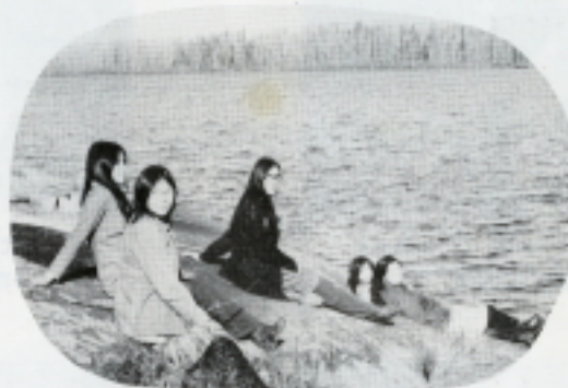
and make a friend or two.