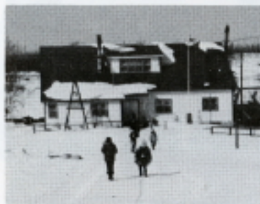
The school day is over.