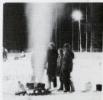
Warm and cozy