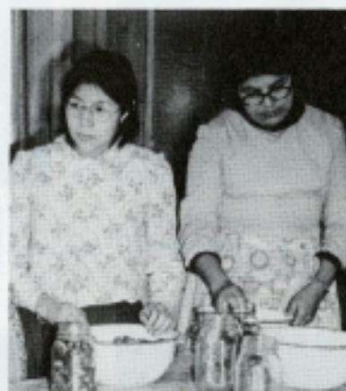
To can meat, we cut it in small pieces, packing it loosely into jars, and steaming it three hours.