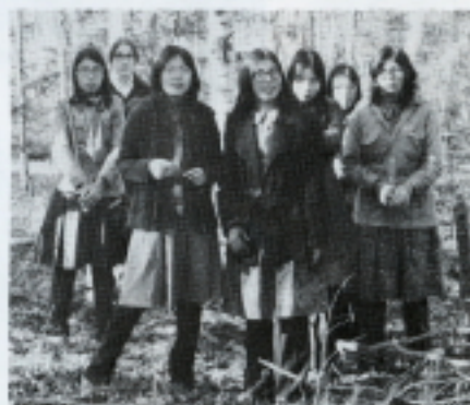
Leisurely hike on a warm sunny day