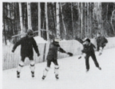
Boys' hockey tournament