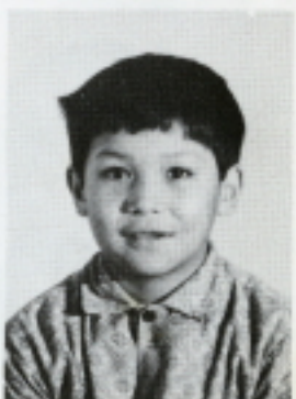
Percy Whiskeyjack Mile 50