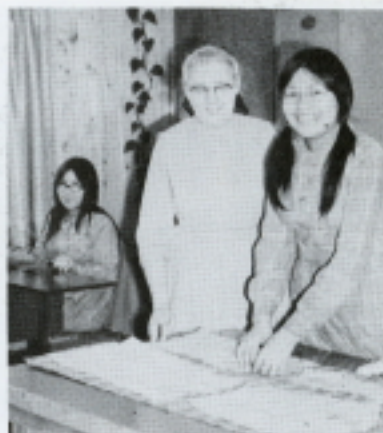
Cutting a shirt