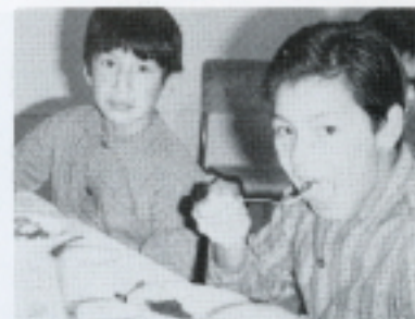
"Mmm, these pancakes sure are good."