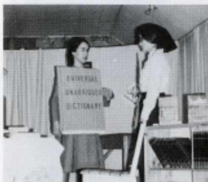
Ladies Programme "Off the Shelf"