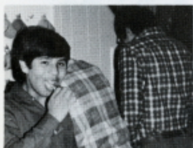
Brush them hard and make them shine!