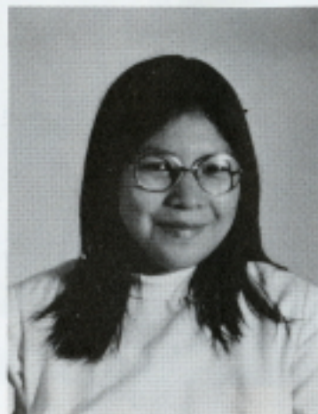
Jezebel Winter Angling Lake