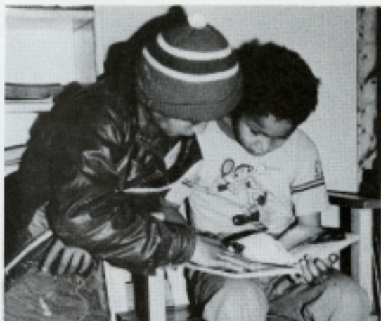
Brothers sharing a book