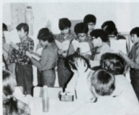
Big boys singing at their mystery supper.