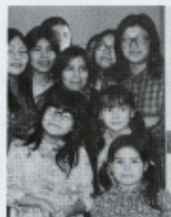
"It sure smells good, I'm so hungry."