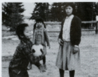
"I've got it."