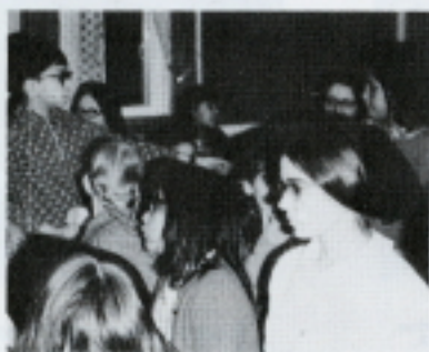
Junior Red Cross parties are fun!