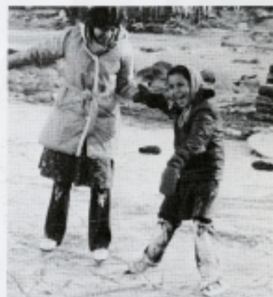
Learning is fun.