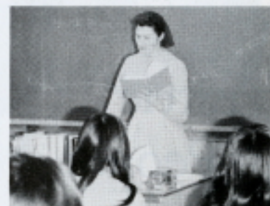
Listen and learn.