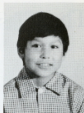
Levi Whiskeyjack Mile 50