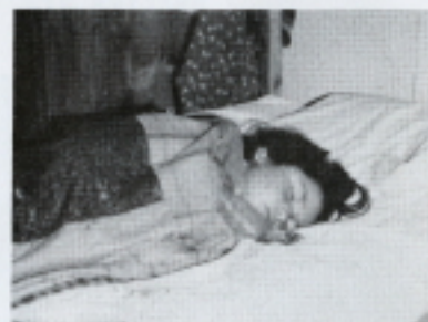
Now the day is over... Sweet dreams...