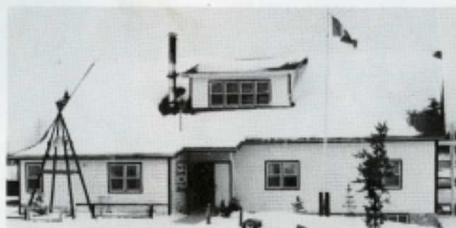
POPLAR HILL DEVELOPMENT SCHOOL

All this we did and so much more as you'll see as you page through.