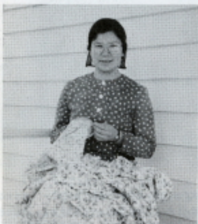
To make curtains, we measured and cut the material and sewed it.