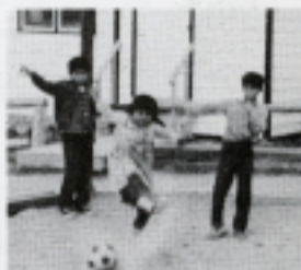
Kick it hard