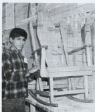
Making a rocking chair