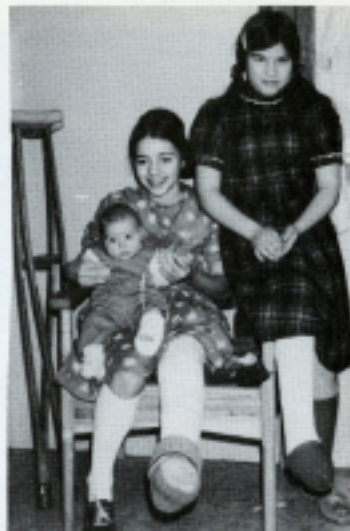
The cast trio