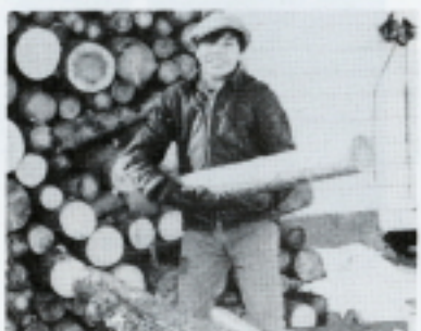
Bringing in wood