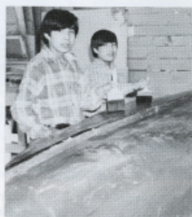
Making a canoe