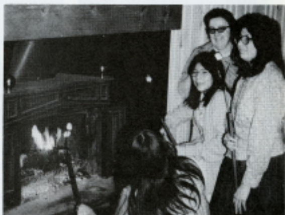
Evening of fun roasting marshmallows