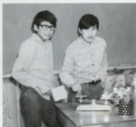
The metric system is based on tens. We are using it in our measuring and weighing.