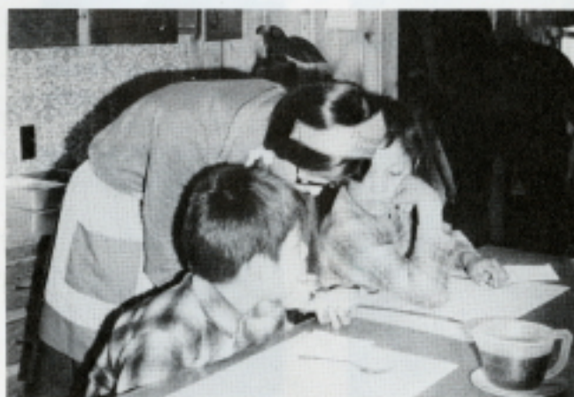
Pancake Day in Home Ec. is a special day when we make pancakes and serve them to students and staff.