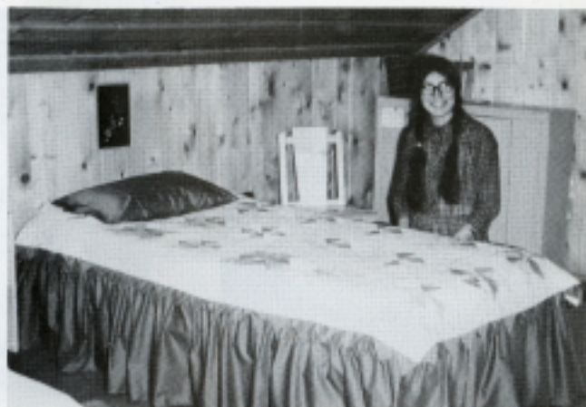
We made a quilt for the guest room. I made a ruffle for the bed. I measured and gathered the material and put it on the sides of the bed.