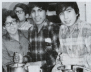
"What's cooking boys?"