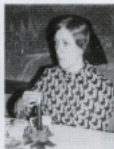
Christmas Tea at Home Ec.