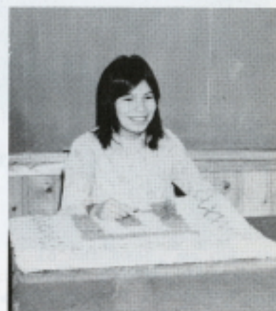
We used yellow and green yarn 8 cm. long to hook the rug.