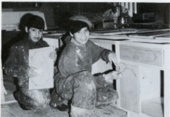
We made a cabinet for the girls' wash-room. We planed the boards and cut and sanded them. Then we glued and nailed them together. Manashe