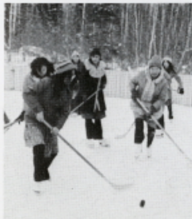
Girls playing hockey