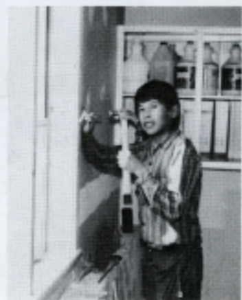
After varnishing the trim, we trimmed our windows.