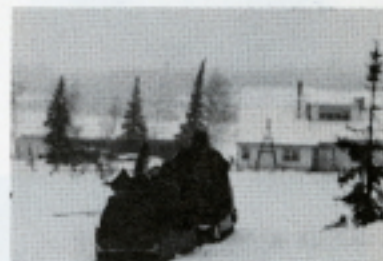
Away we go!