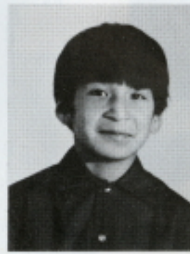
Hughie Whiskeyjack Osnaburgh