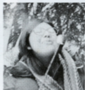
Hurry blow it!