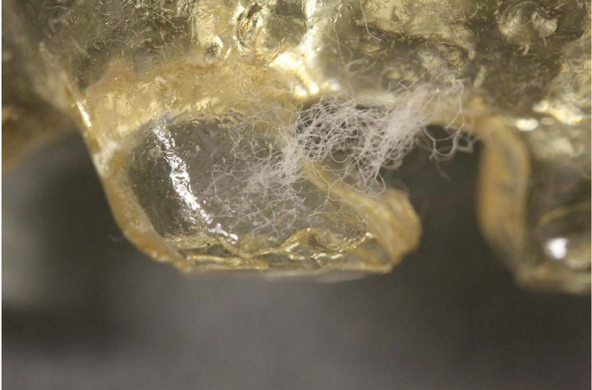
Fig.3 – Foreign matter – Back bottom