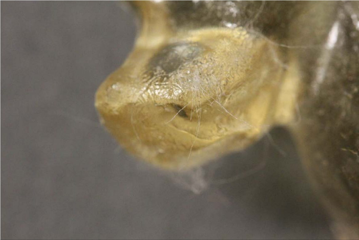
Fig.1 – Foreign Matter – Front right