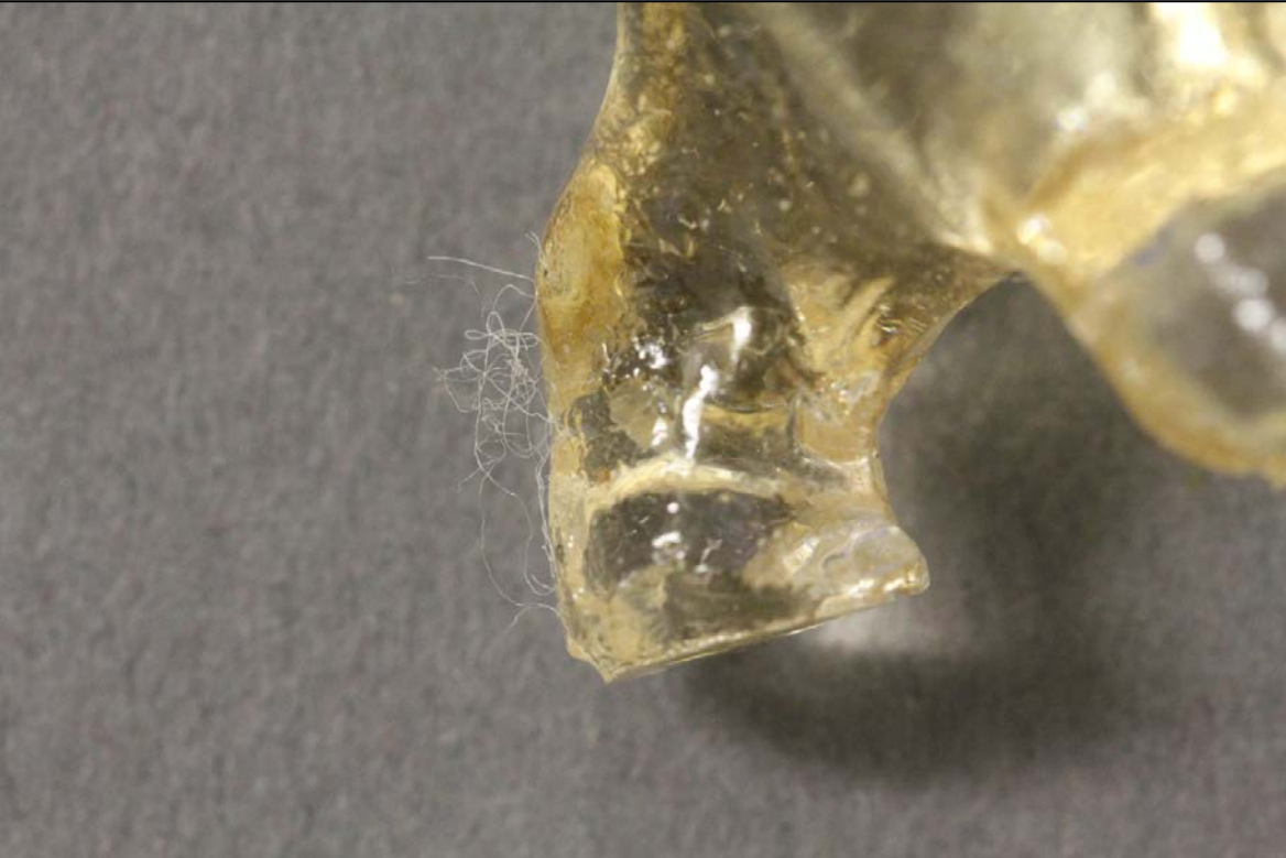
Fig.2 – Foreign Matter – Back left