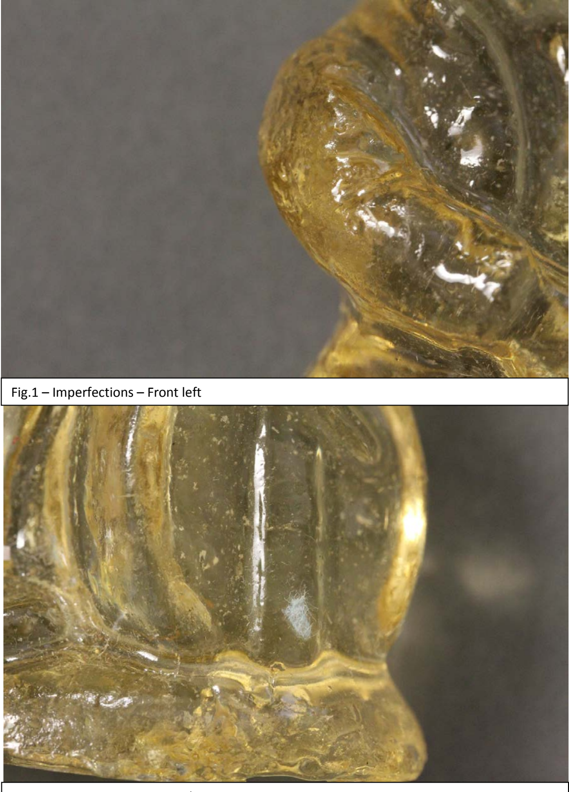
Fig.2 – Foreign Matter – Front bottom