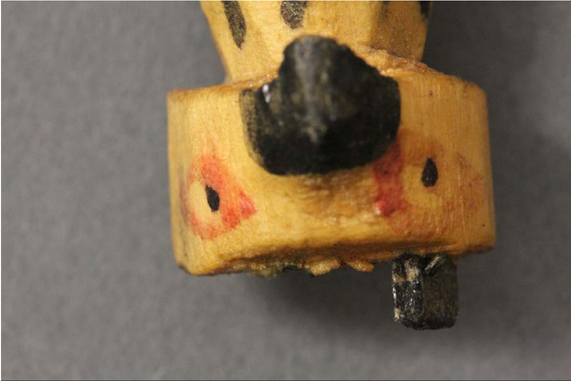
Fig.1 – Loss – Front top