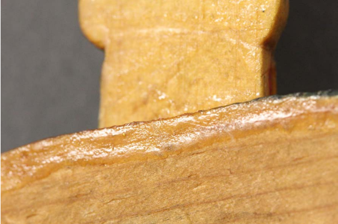
Fig.3 – Glaze – Back center