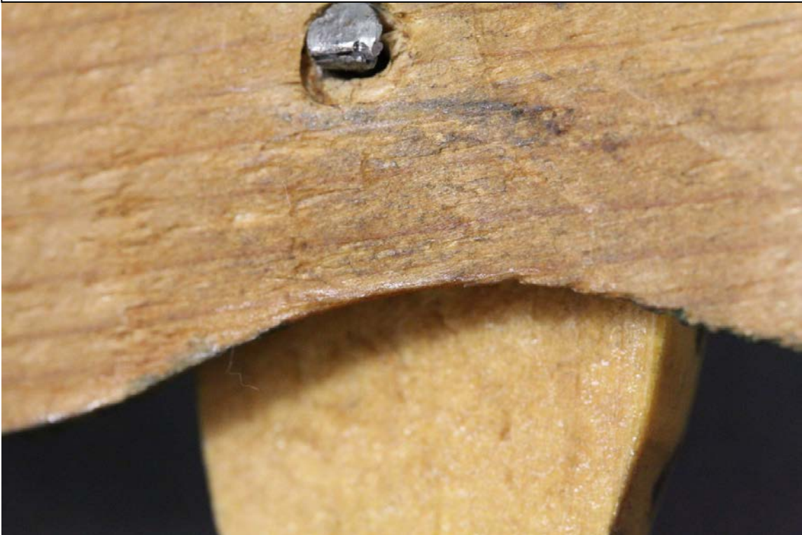
Fig.2 – Transfer – Back top