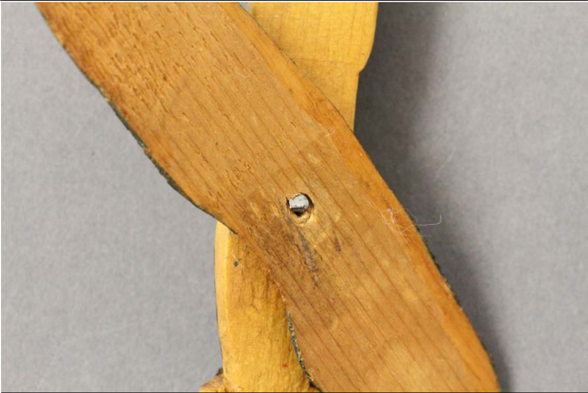
Fig.4 – Loose – Back center