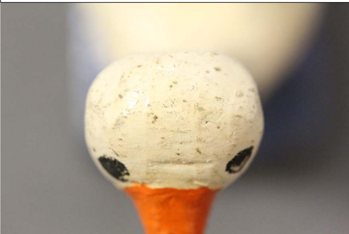
Fig.2 – Foreign Matter - Top