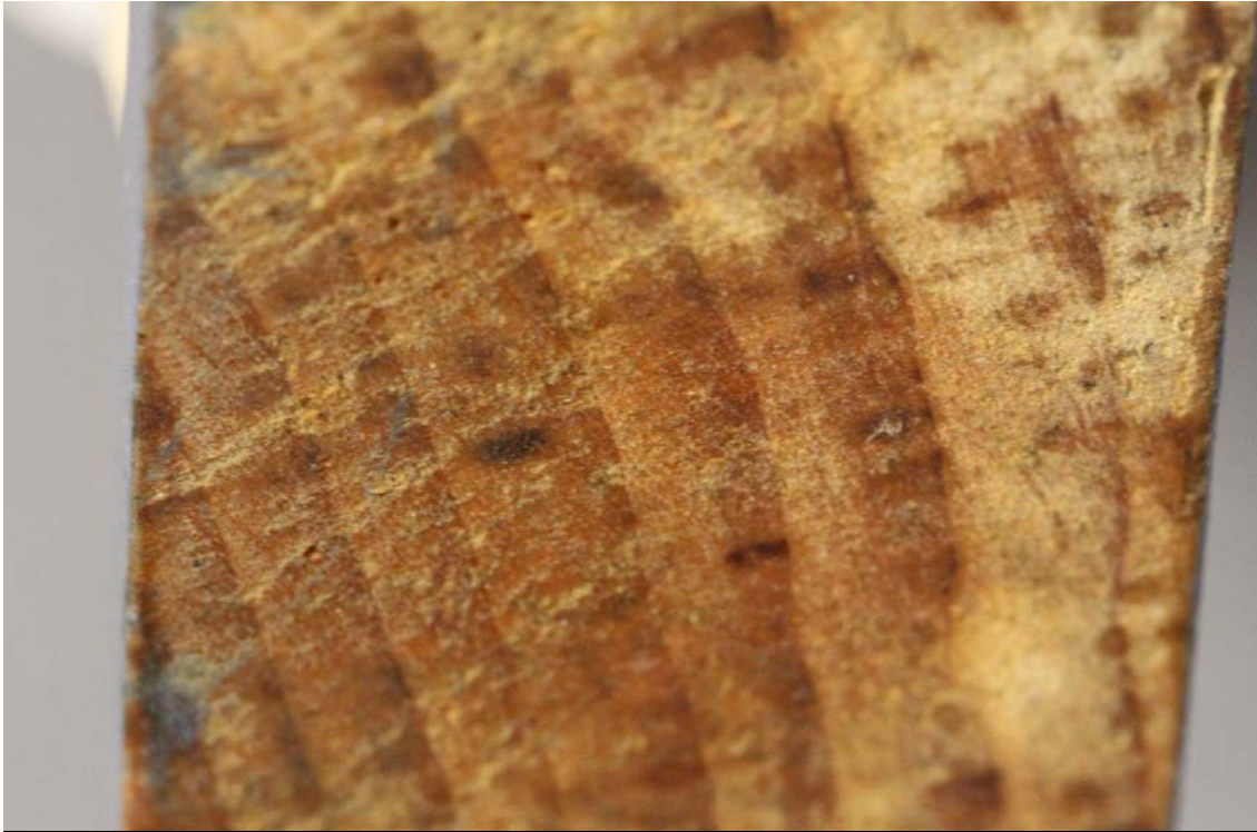
Fig.3 – Foreign Matter - Bottom