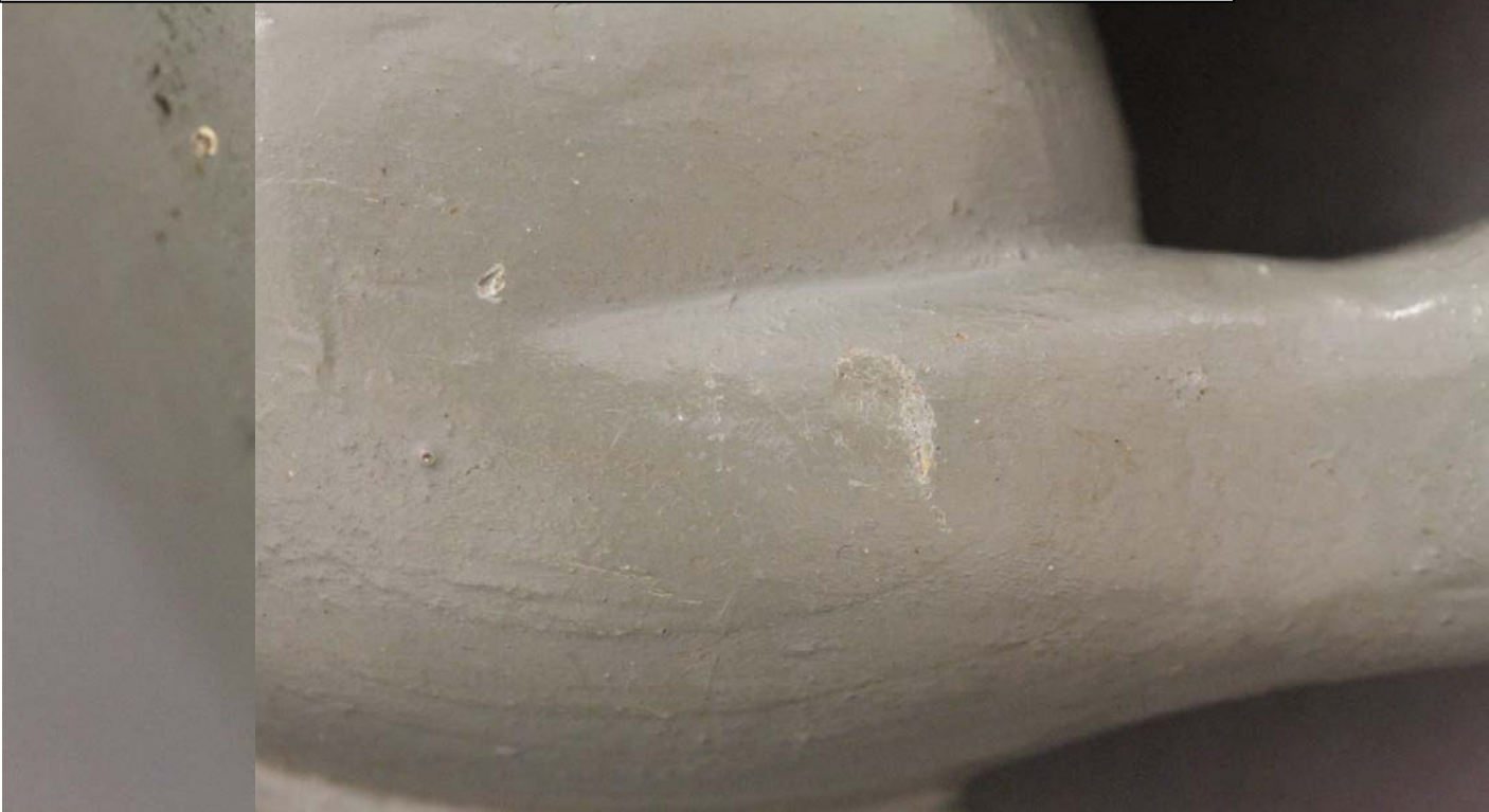
Fig.2 – Foreign Matter – Right back top