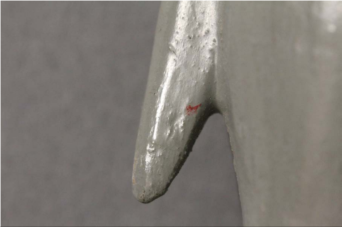
Fig.1 – Foreign Matter – Left back bottom