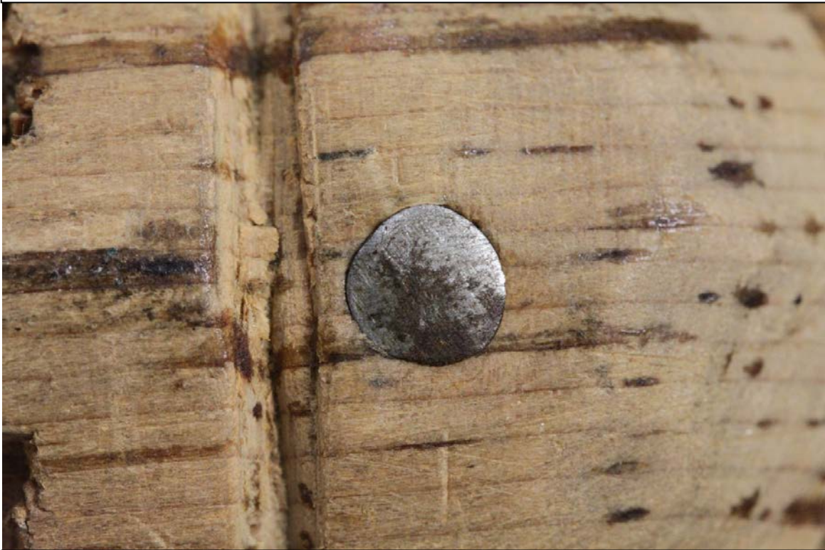
Fig.2 – Corrosion – Back left