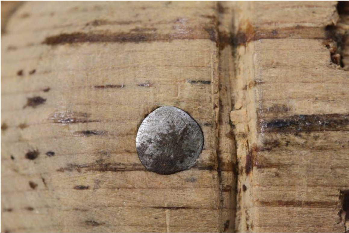
Fig.1 – Corrosion – Left corner