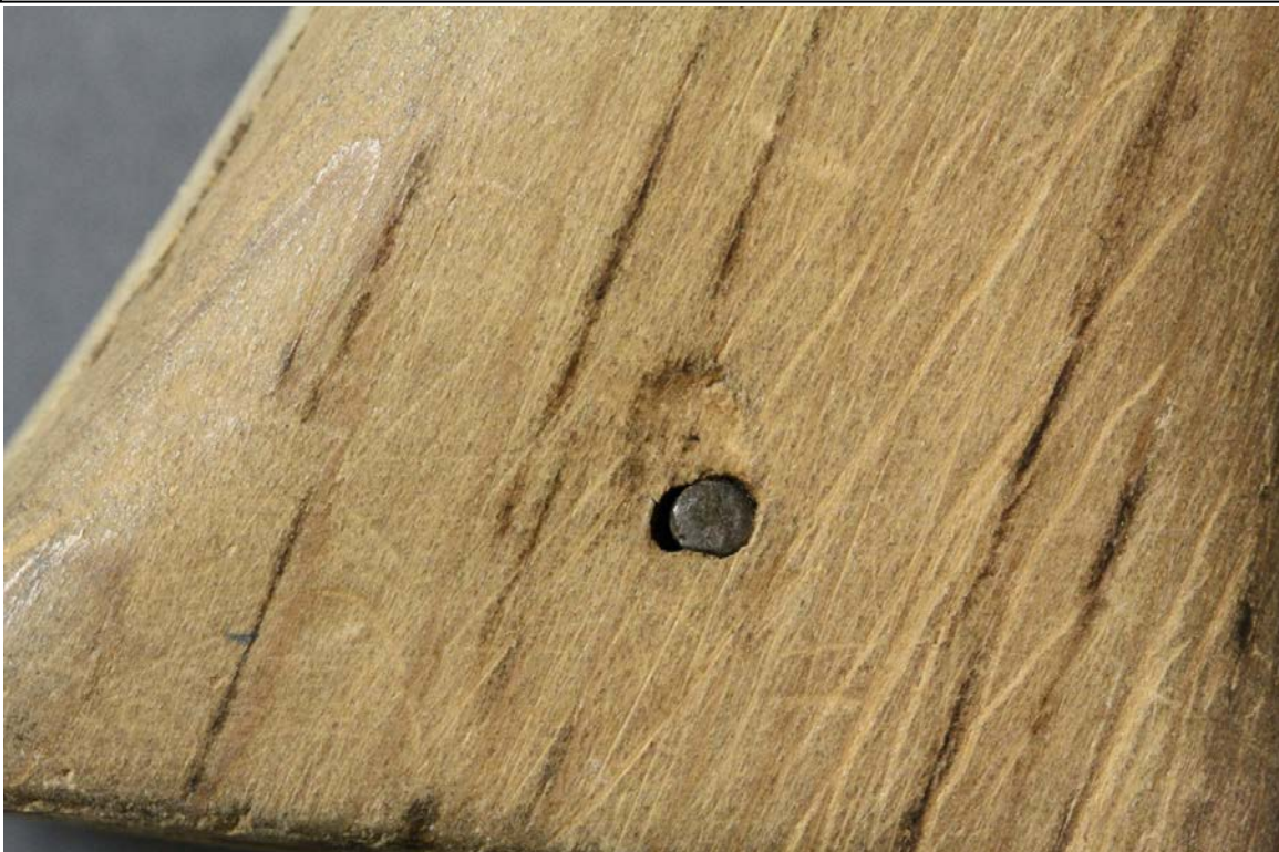
Fig.6 – Corrosion – Back right