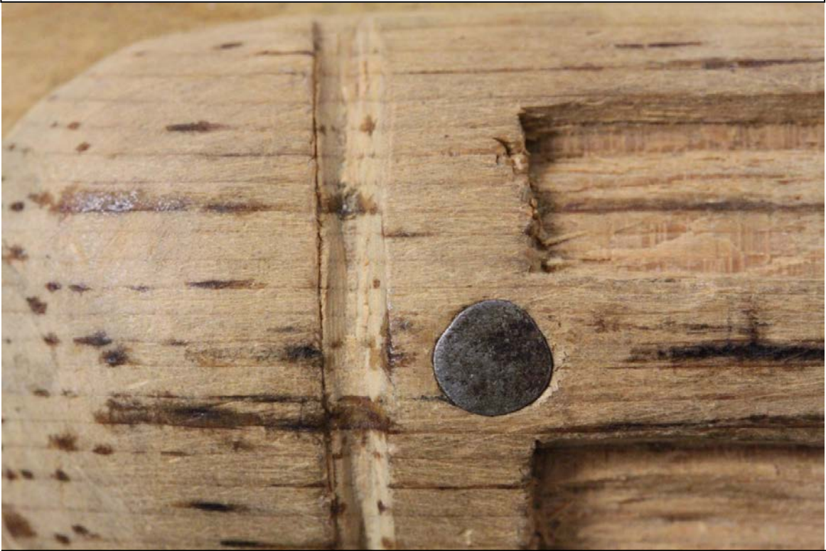
Fig.4 – Corrosion – Right center