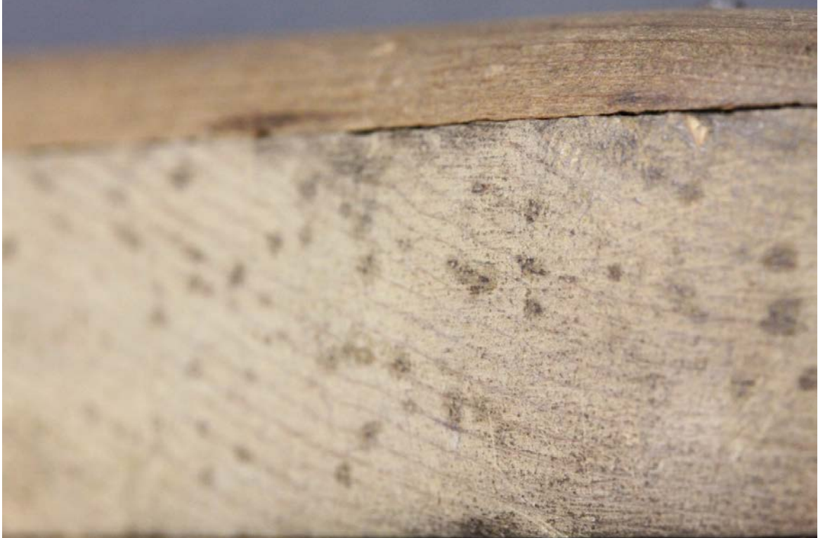
Fig.8 – Mold – Back center