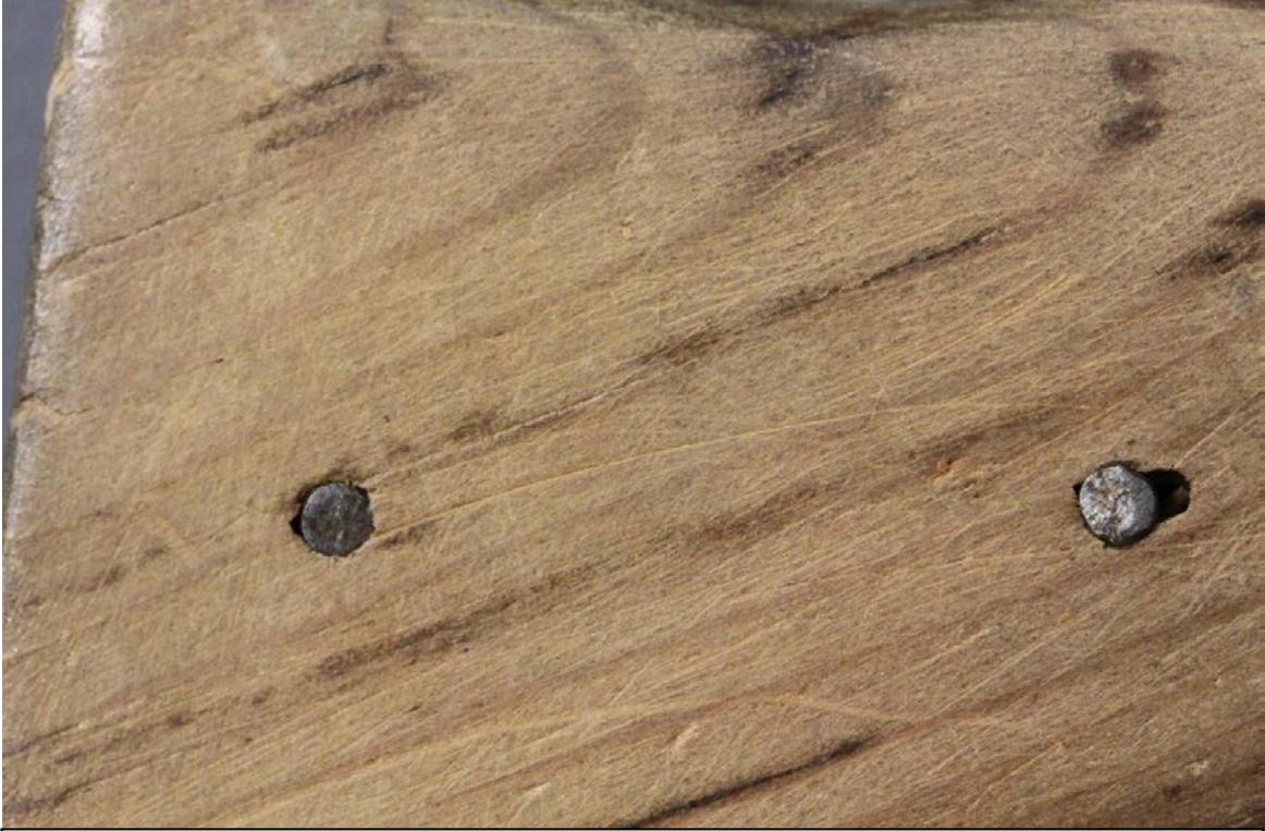
Fig.3 – Corrosion – Back left