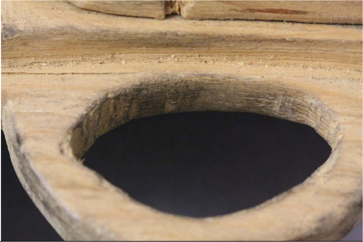
Fig.7 – Transfer – Right corner