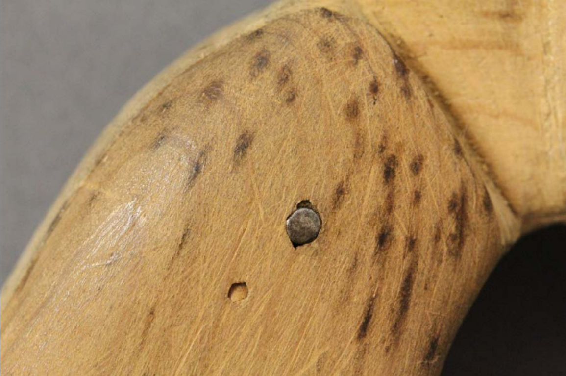
Fig.5 – Corrosion – Back right