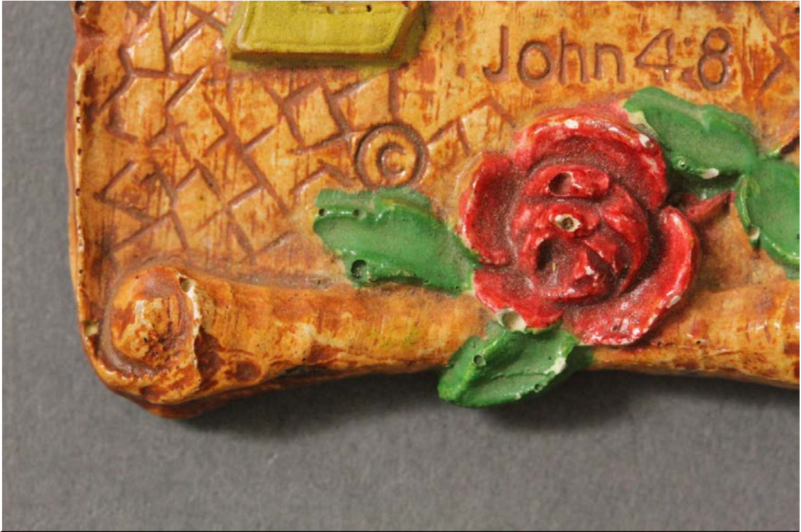
Fig.5 – Imperfections – Front bottom