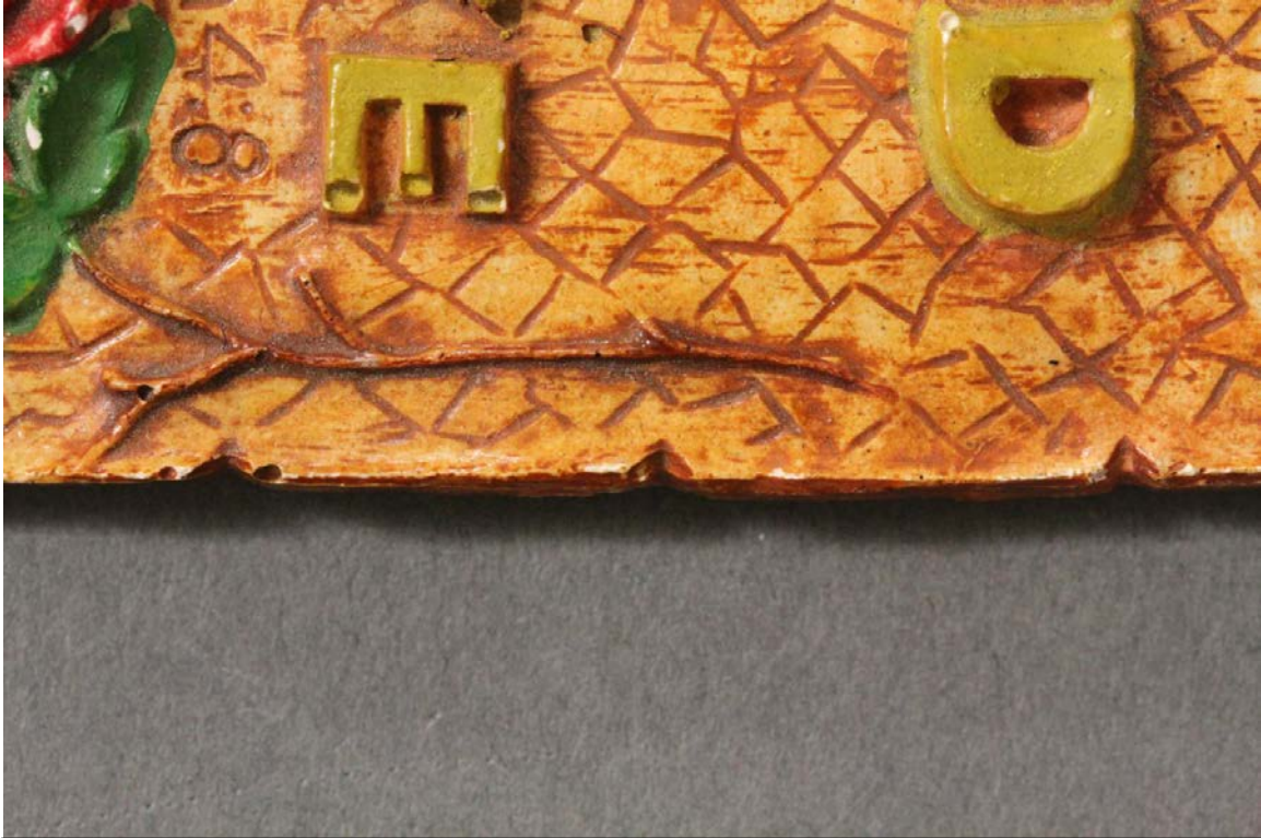
Fig.3 – Chipping – Front right edge