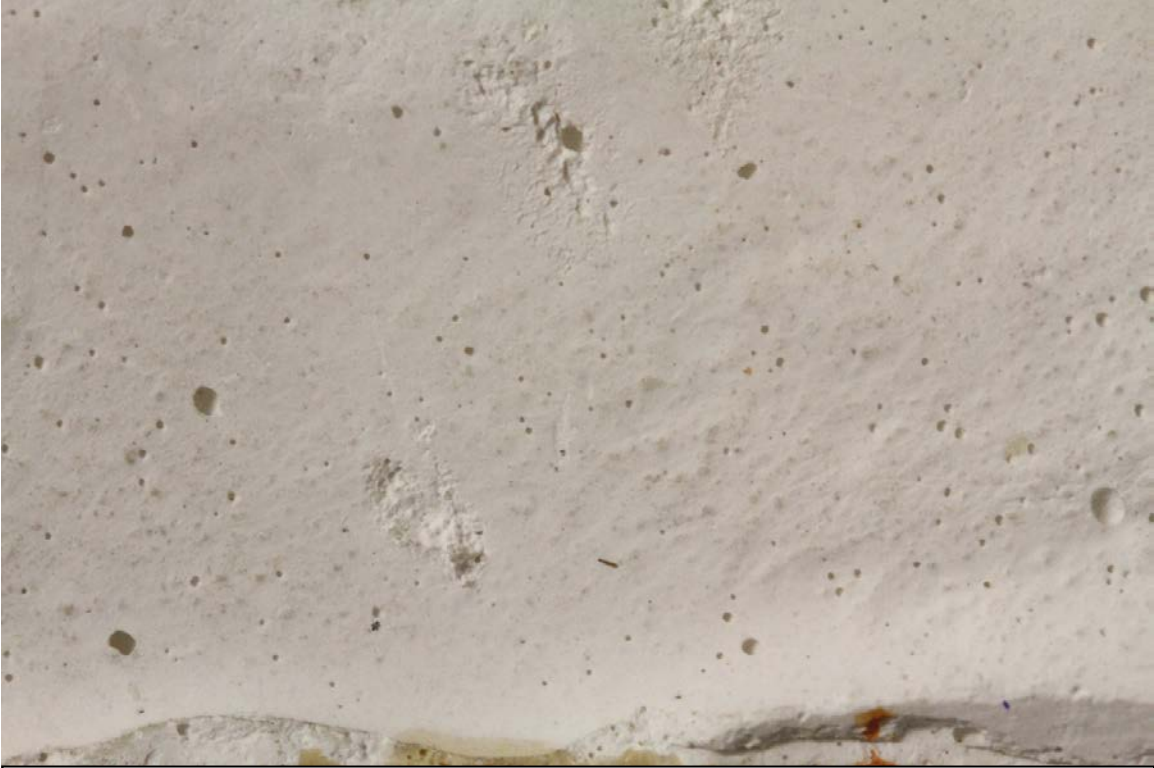
Fig.7 – Imperfections – Back bottom