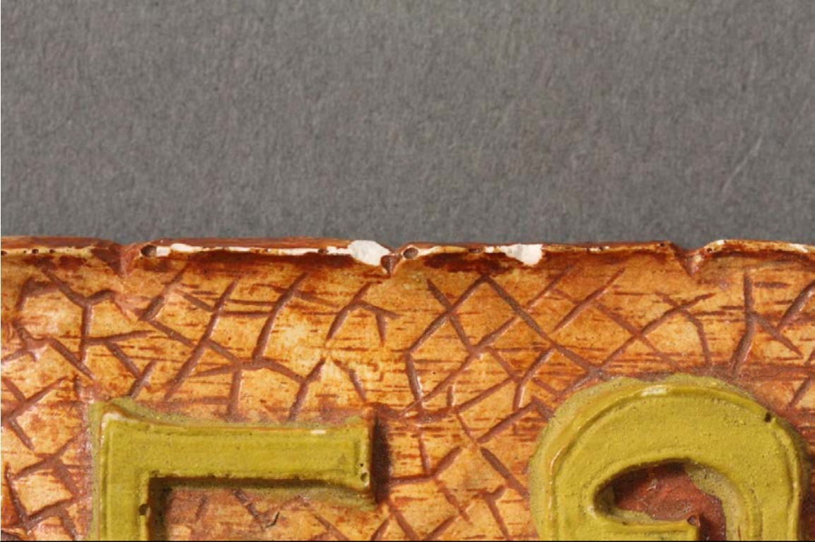
Fig.1 – Chipping – Front left edge