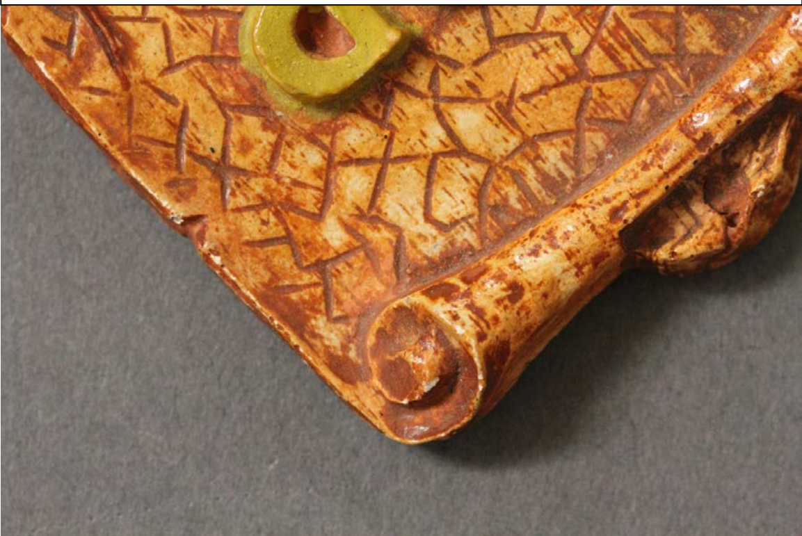
Fig.2 – Chipping – Front top right