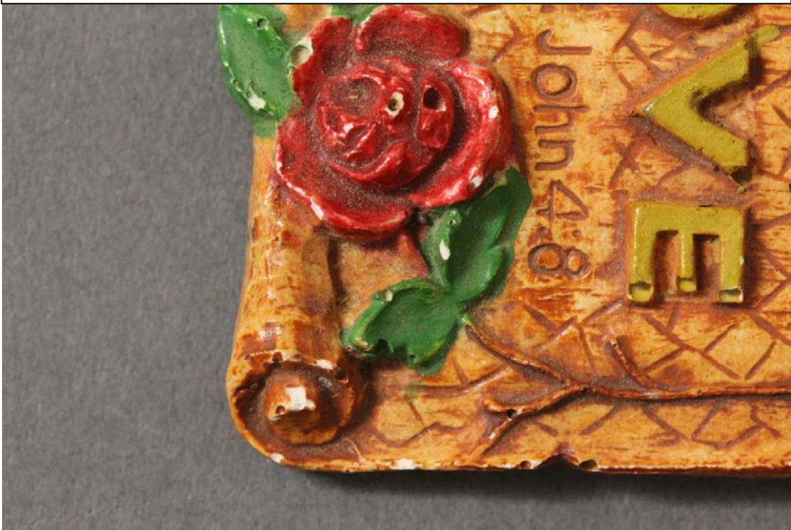
Fig.4 – Chipping – Front right bottom corner