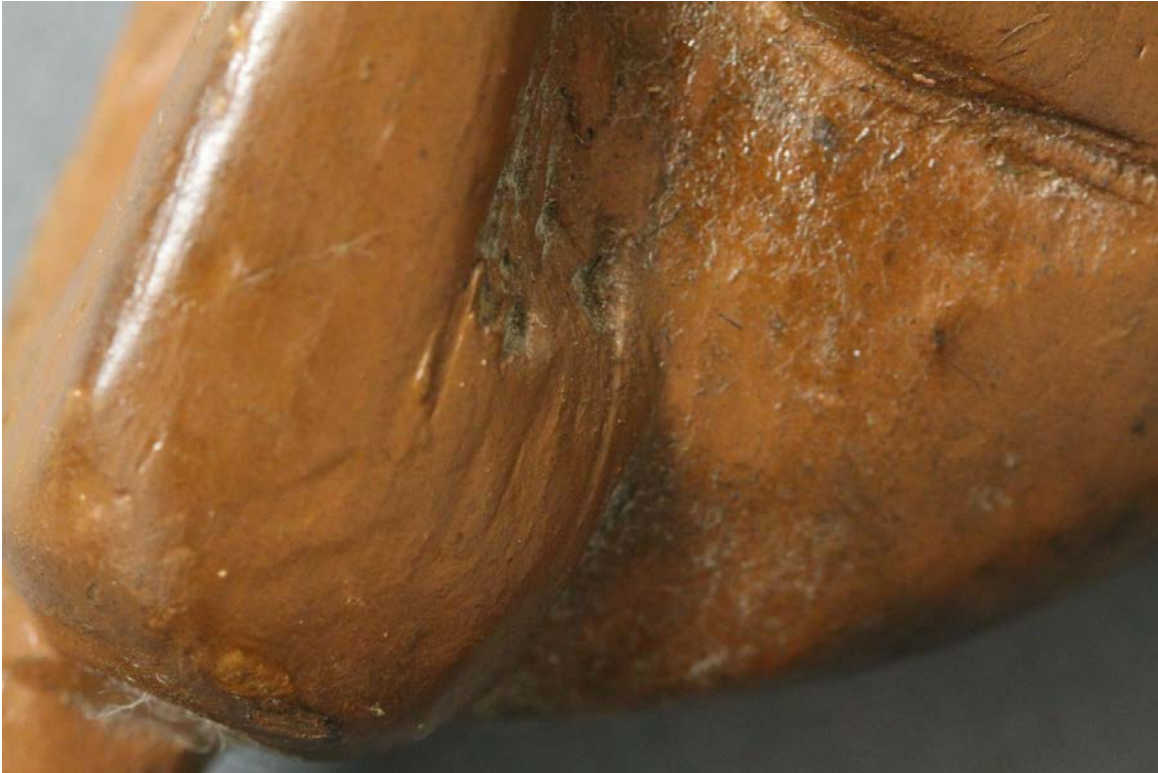
Fig.1 – Dust – Right bottom side