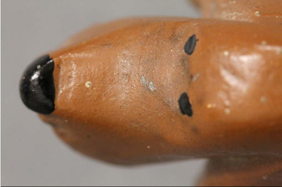
Fig.3 – Foreign Matter – Top center