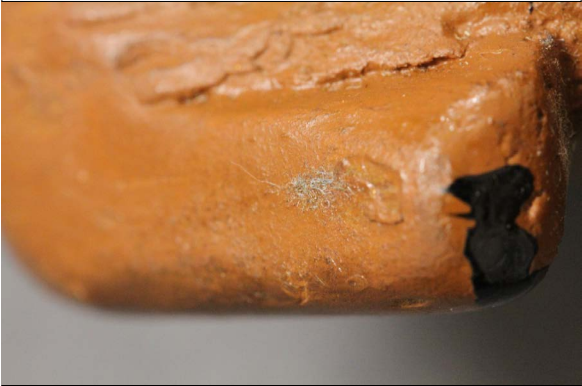
Fig.4 – Foreign Matter – Bottom right