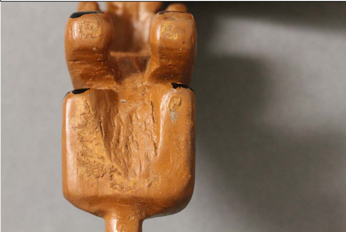
Fig.2 – Imperfections - Bottom