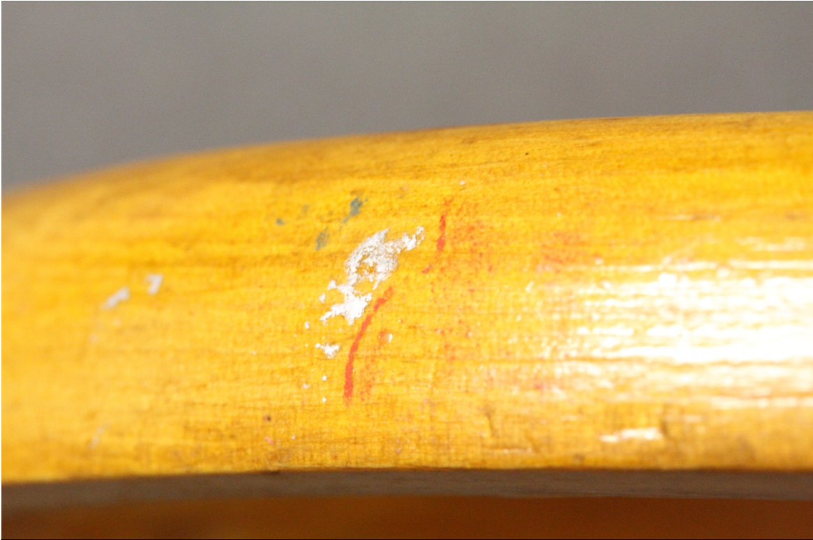
Fig.1 – Transfer – Top center