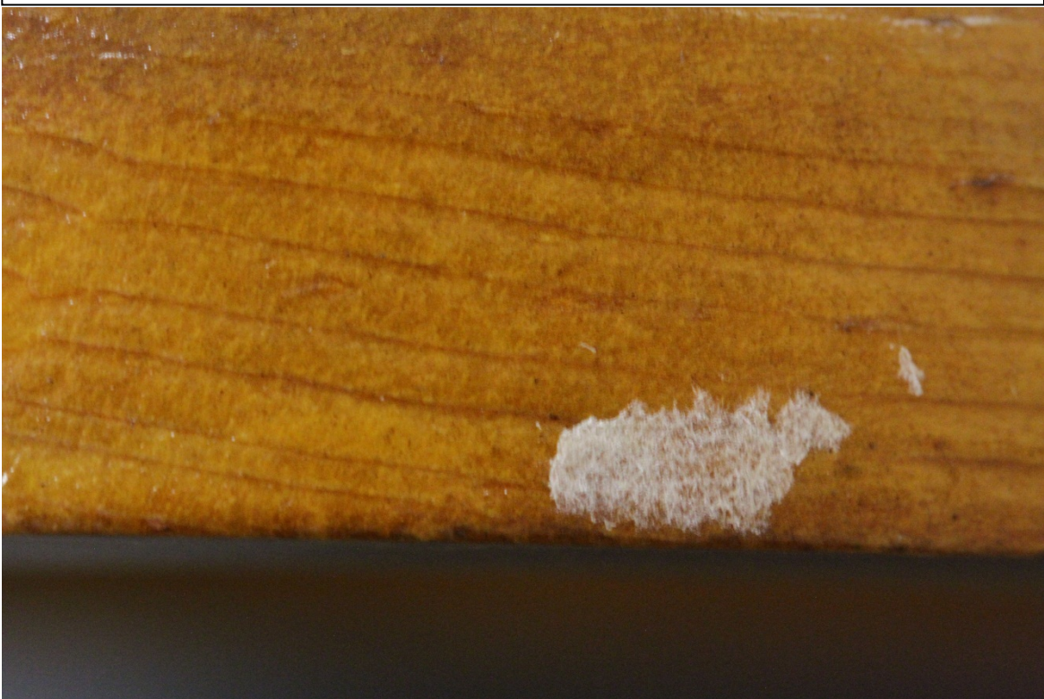
Fig.2 – Foreign Matter – Back bottom