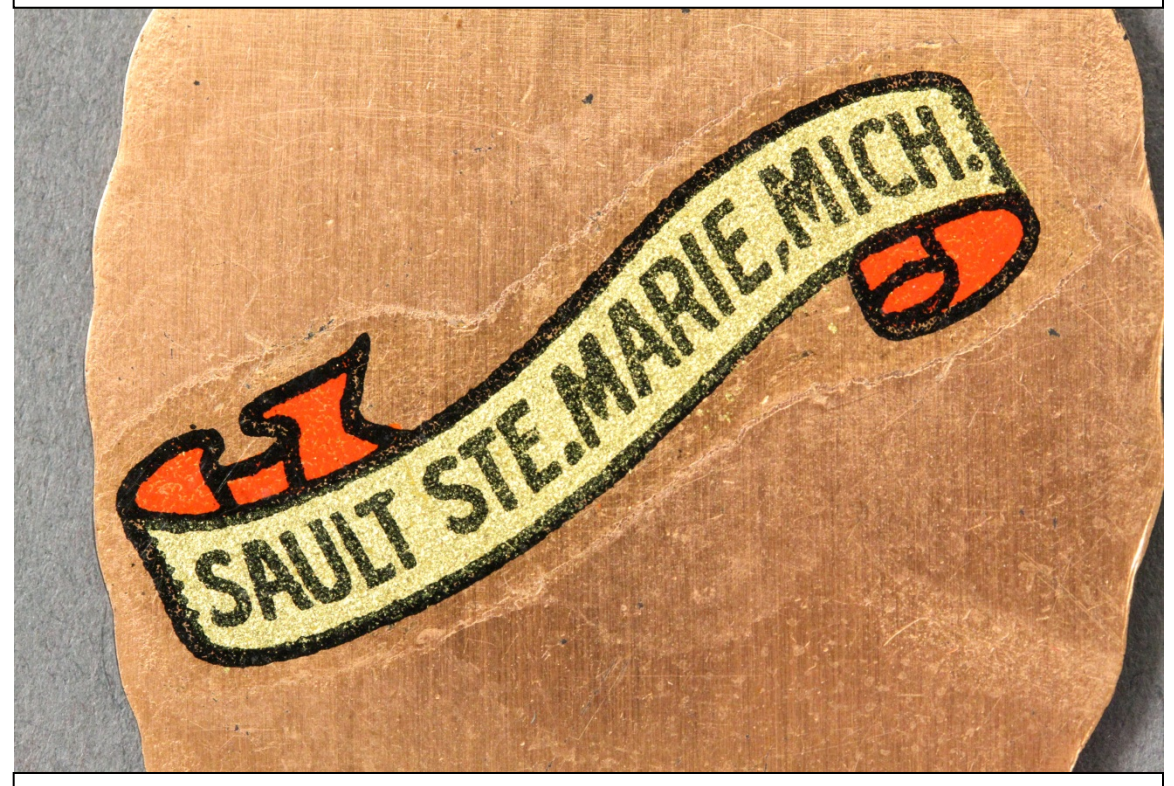
Fig.2 – Sticker – Back center