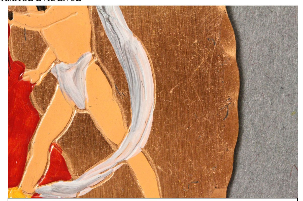
Fig.1 – Scratches – Front left