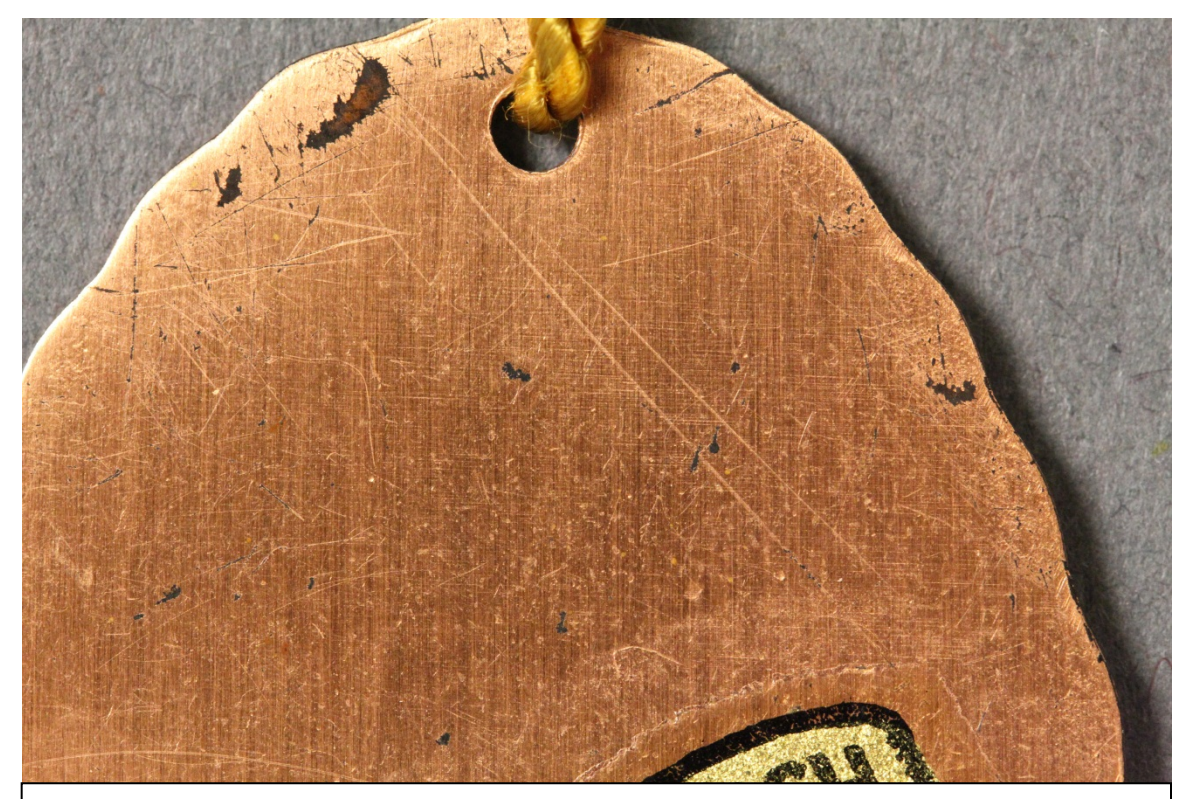
Fig.3 – Scratches – Back right