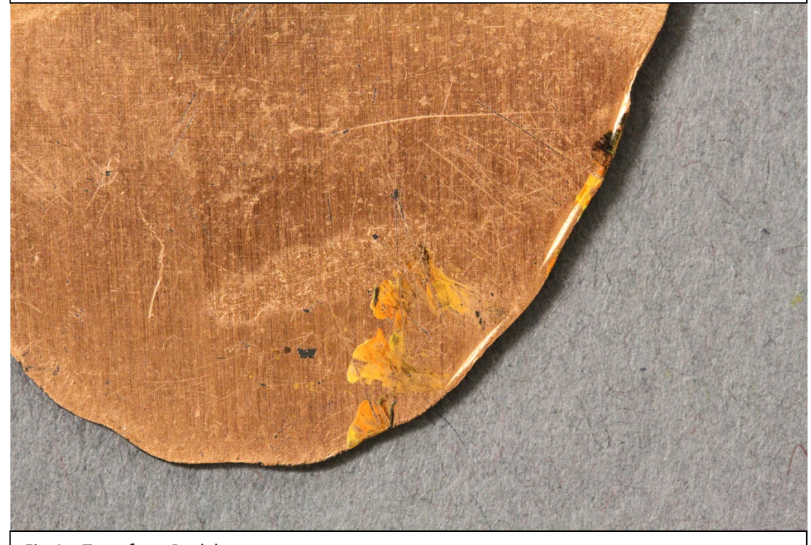
Fig.4 – Transfer – Back bottom