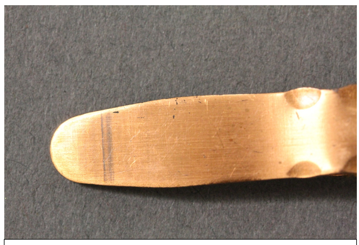
Fig.5 – Striations – Back top