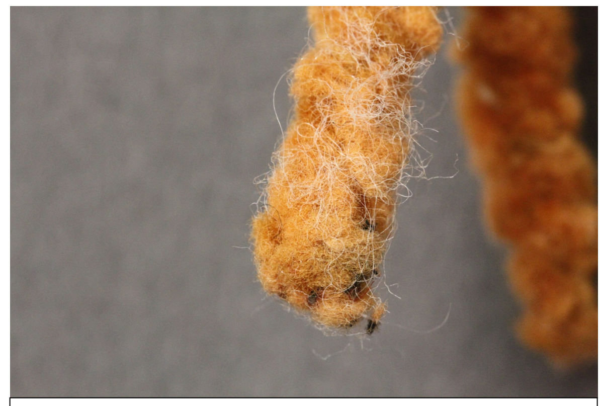
Fig.1 – Foreign Matter – Back left bottom