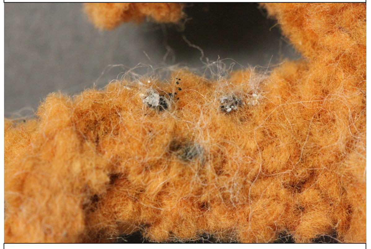
Fig.2 – Foreign Matter – Back center