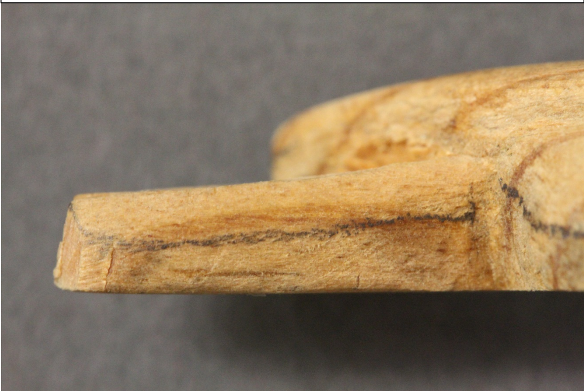
Fig.2 – Transfer – Front right