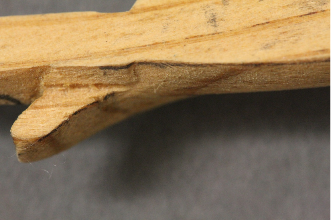
Fig.3 – Transfer – Back top