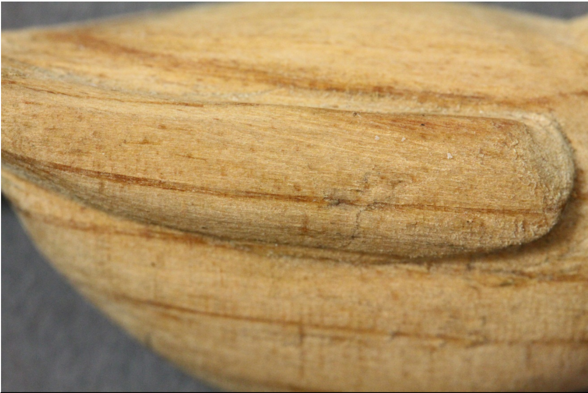
Fig.1 – Transfer – Front center