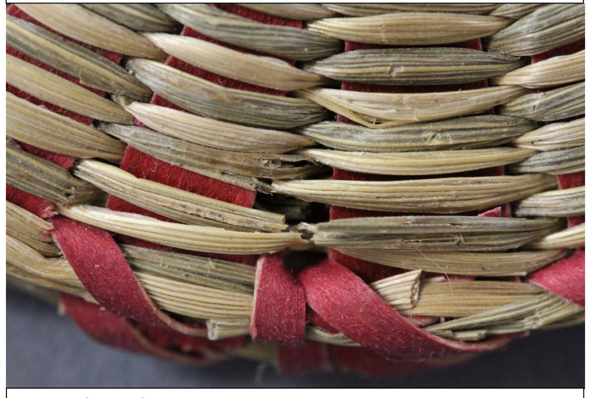
Fig.2 – Break – Front bottom