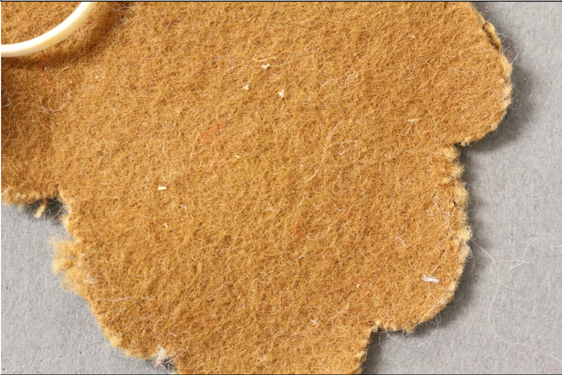
Fig.2 – Foreign Matter – Front center