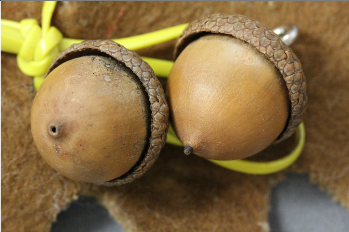
Fig.2 – Acorns – Front center