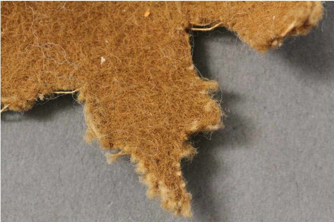
Fig.1 – Foreign Matter – Front bottom