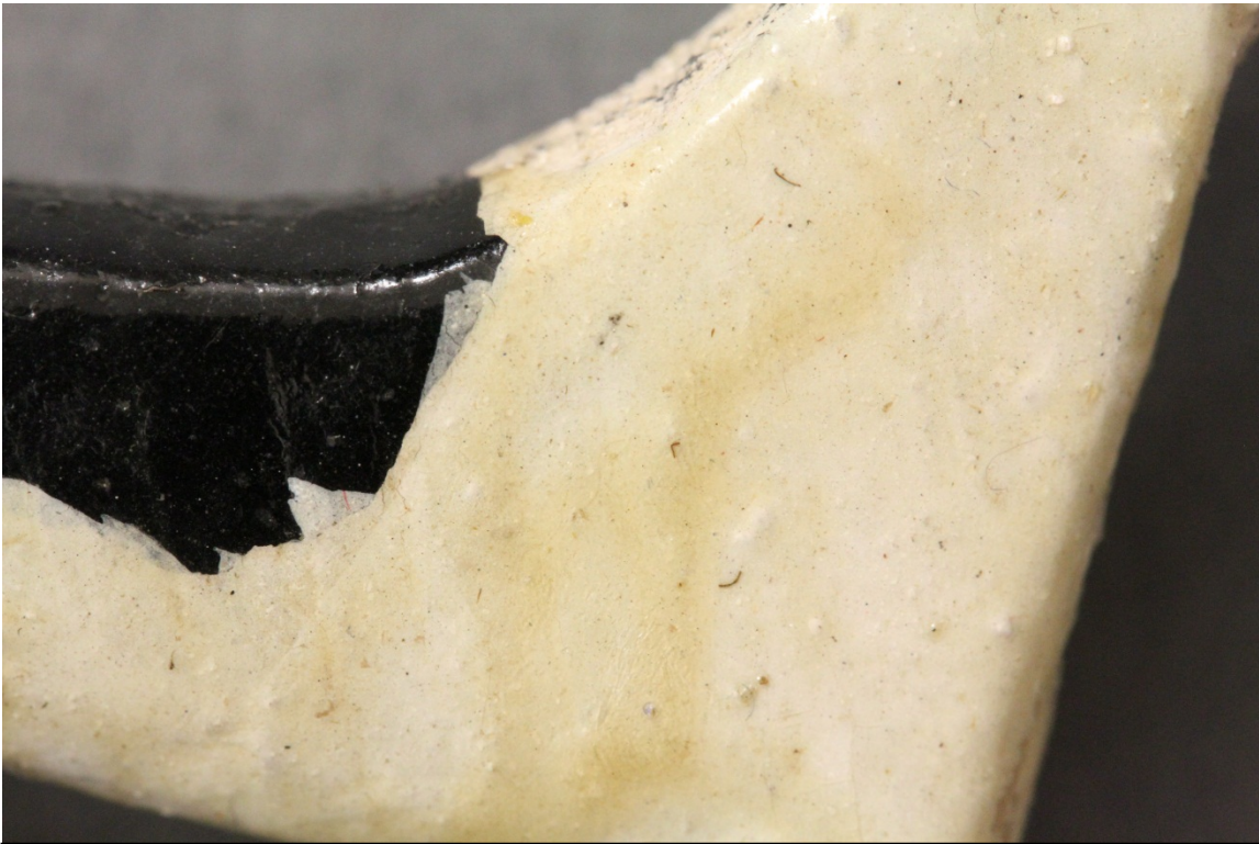
Fig.1 – Pooling – Front center