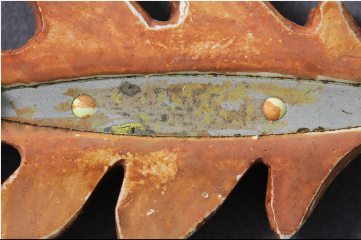
Fig.1 – Corrosion – Back center