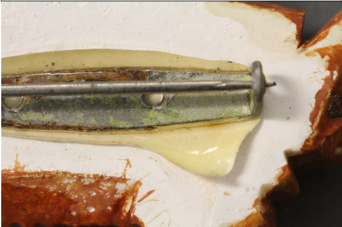
Fig.2 – Adhesive – Back center