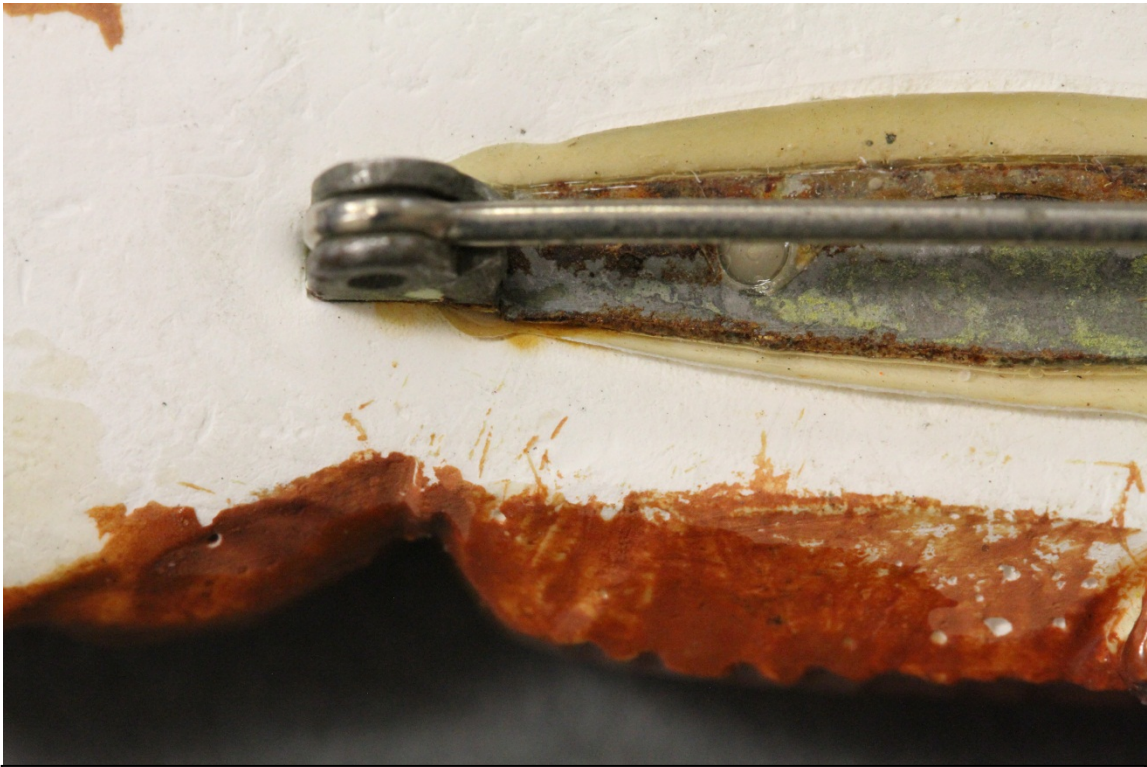
Fig.3 – Corrosion – Back center