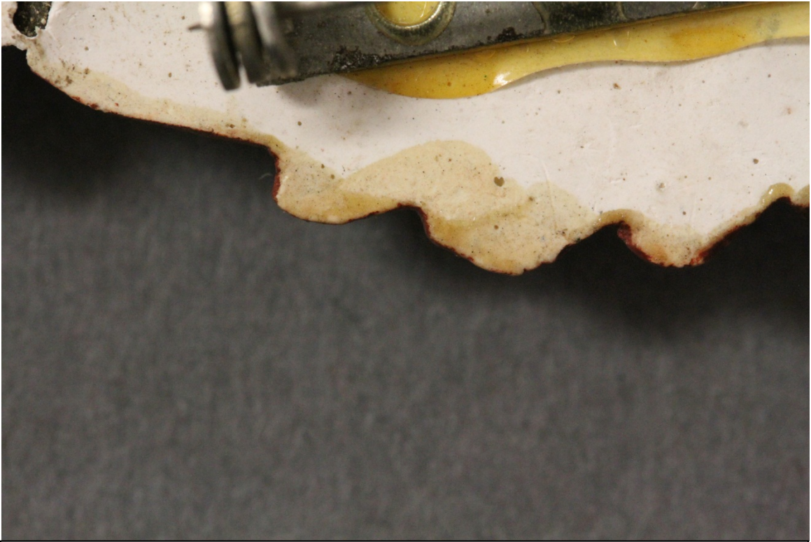
Fig.7 – Glaze – Back right