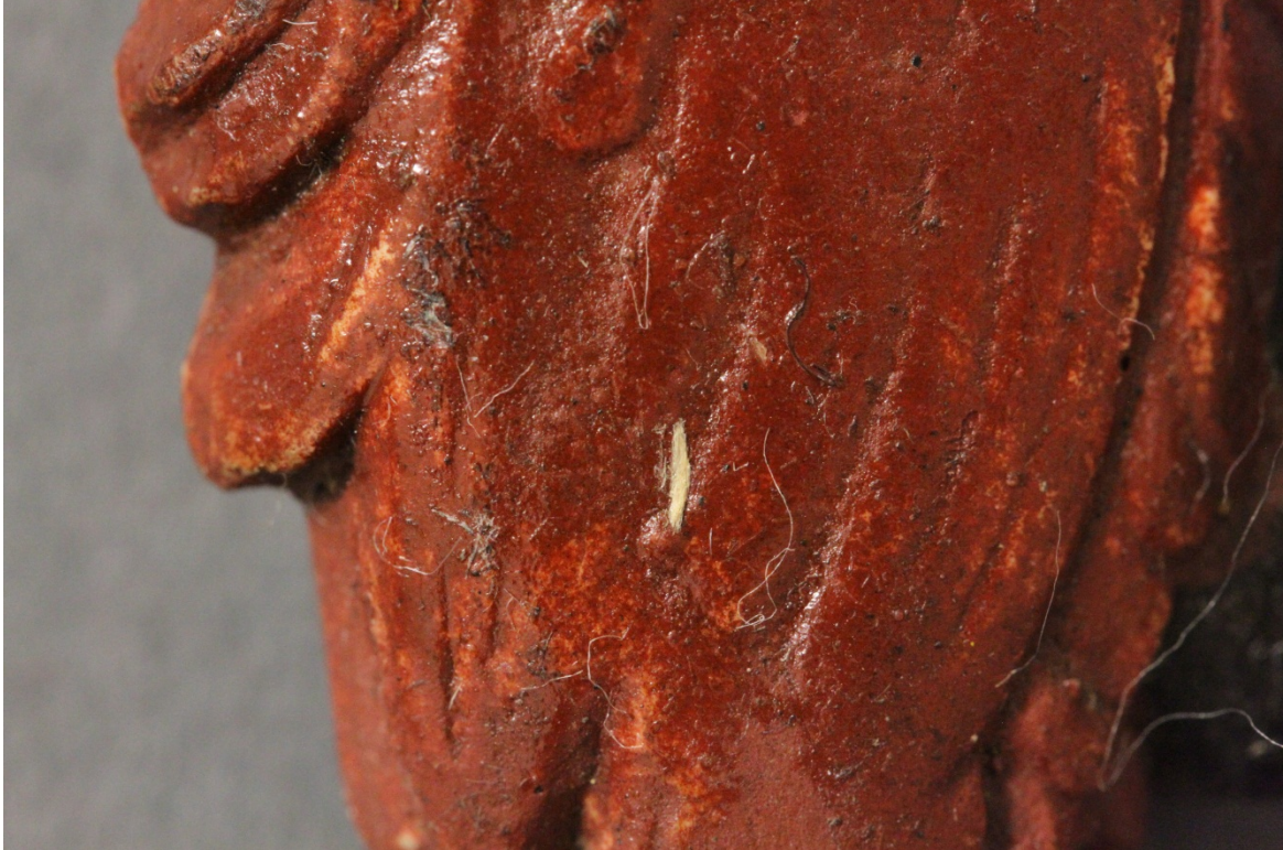
Fig.3 – Foreign Matter – Front left bottom