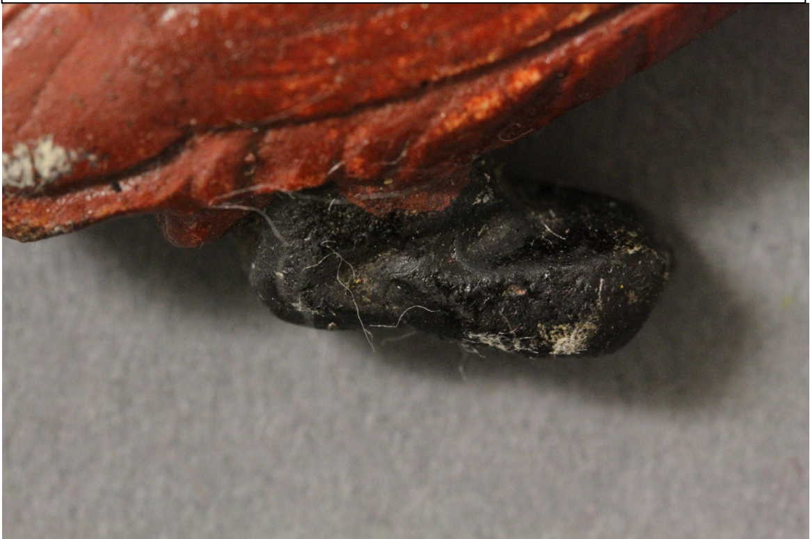
Fig.4 – Foreign Matter – Front bottom