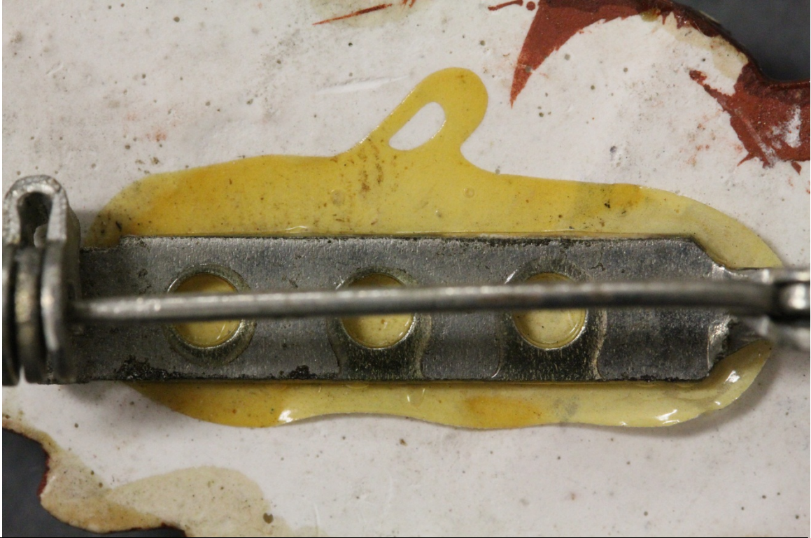
Fig.5 –Adhesive – Back center