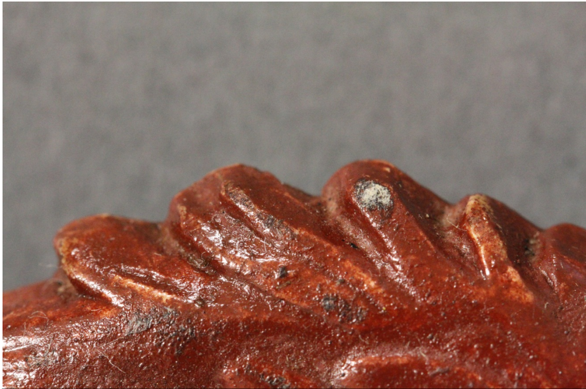
Fig.1 – Foreign Matter – Front left