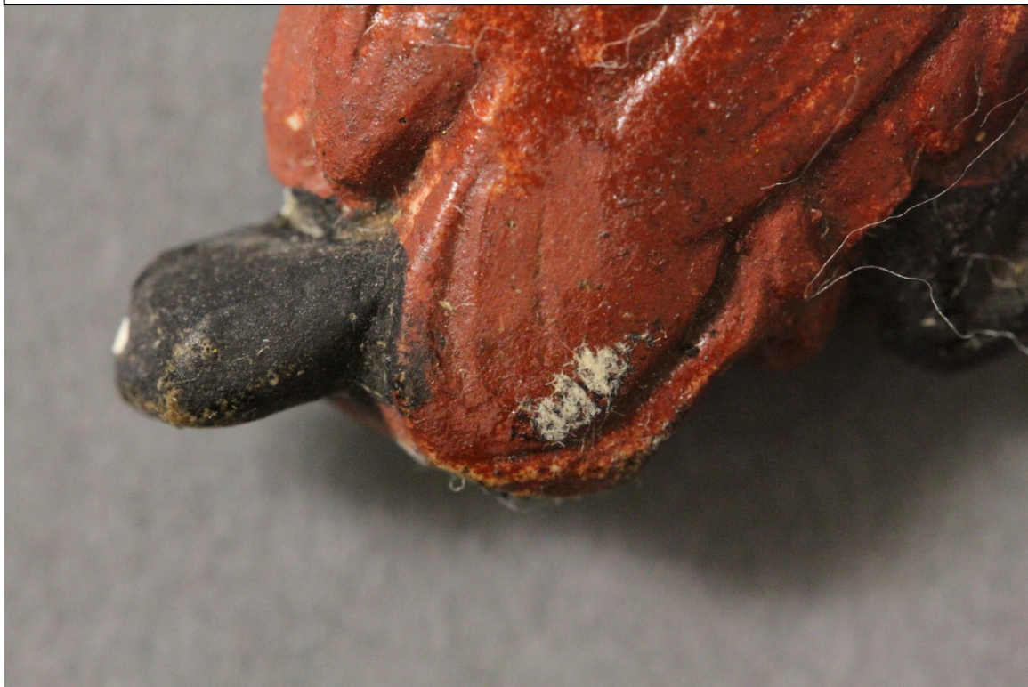
Fig.2 – Foreign Matter – Front bottom