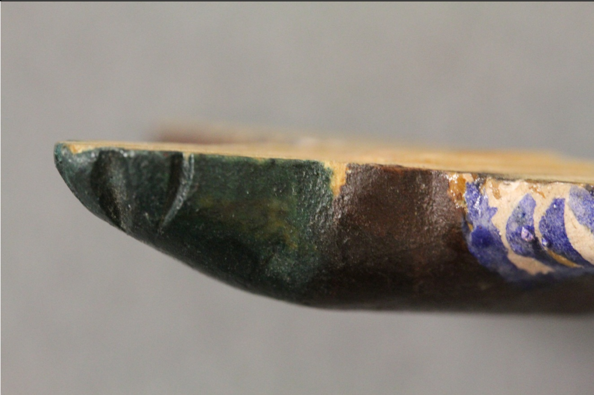
Fig.2 –Chip – Front left bottom