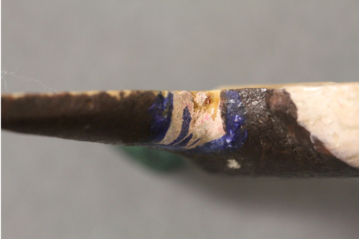
Fig.3 – Chip – Front left top