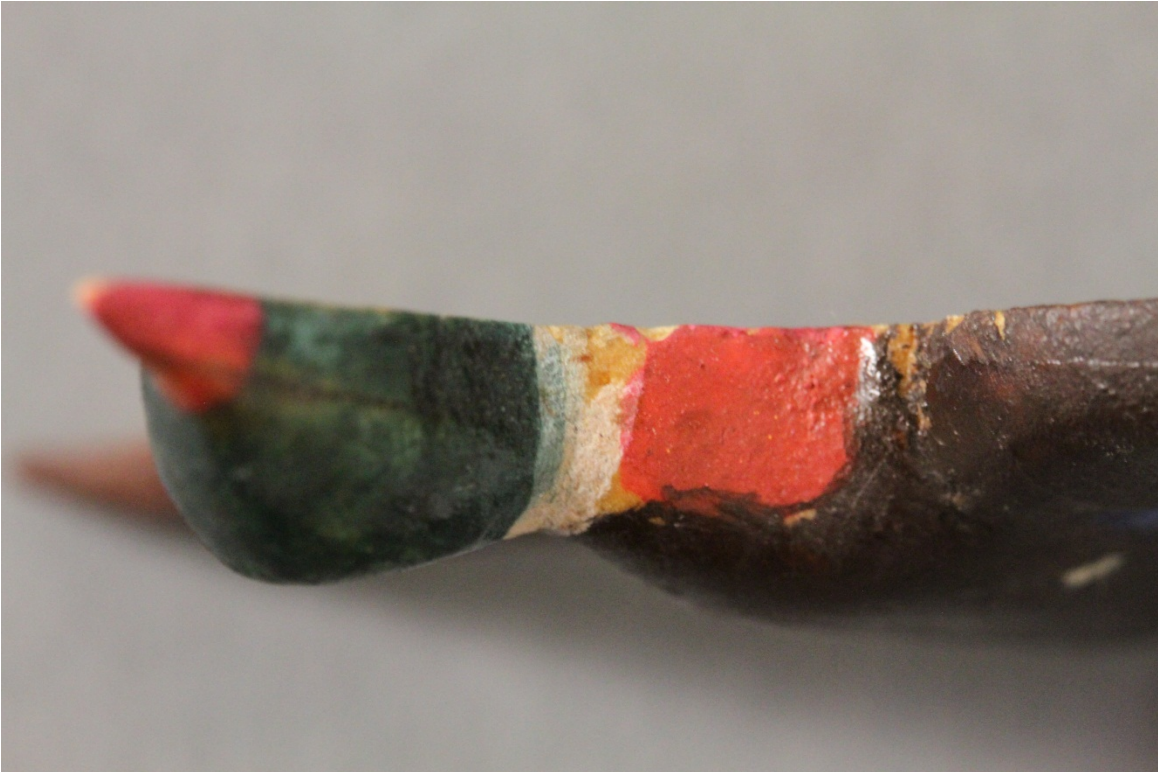
Fig.1 – Chip – Front right