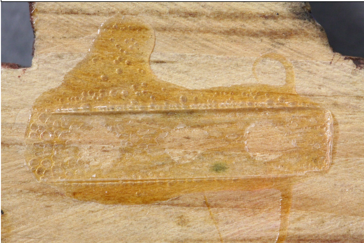
Fig.4 – Adhesive – Back center