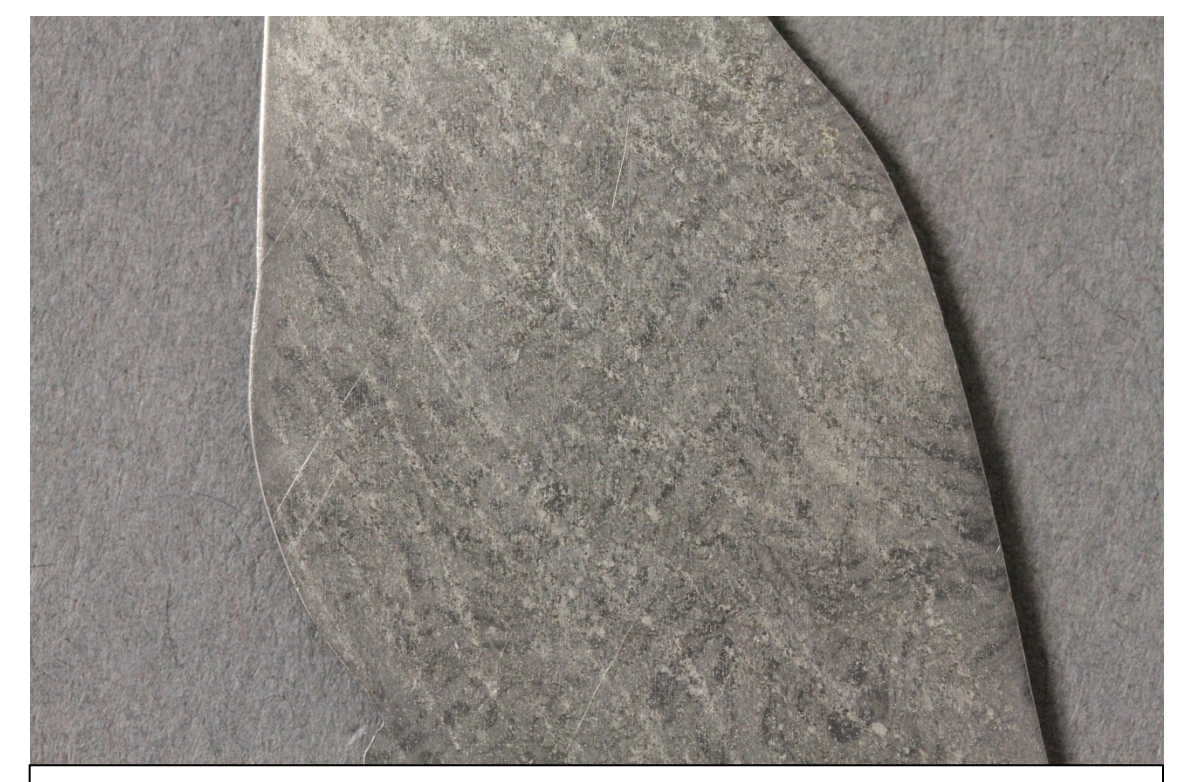
Fig.1 – Corrosion – Front center