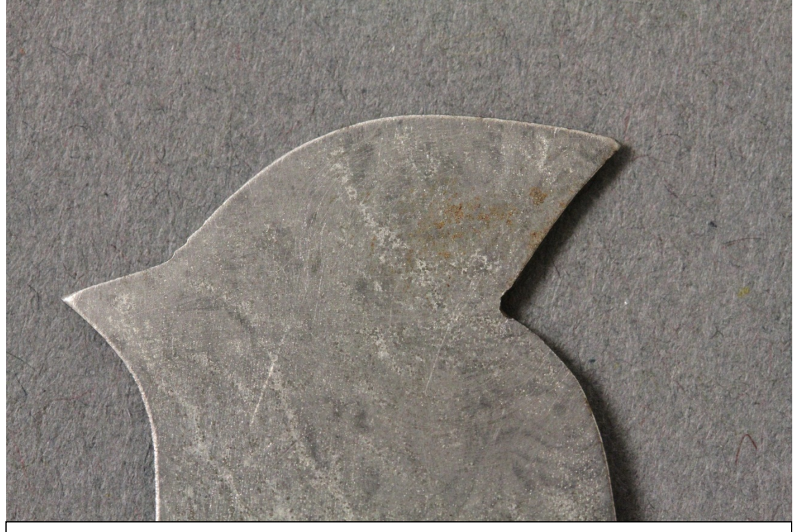
Fig.2 – Corrosion – Front top