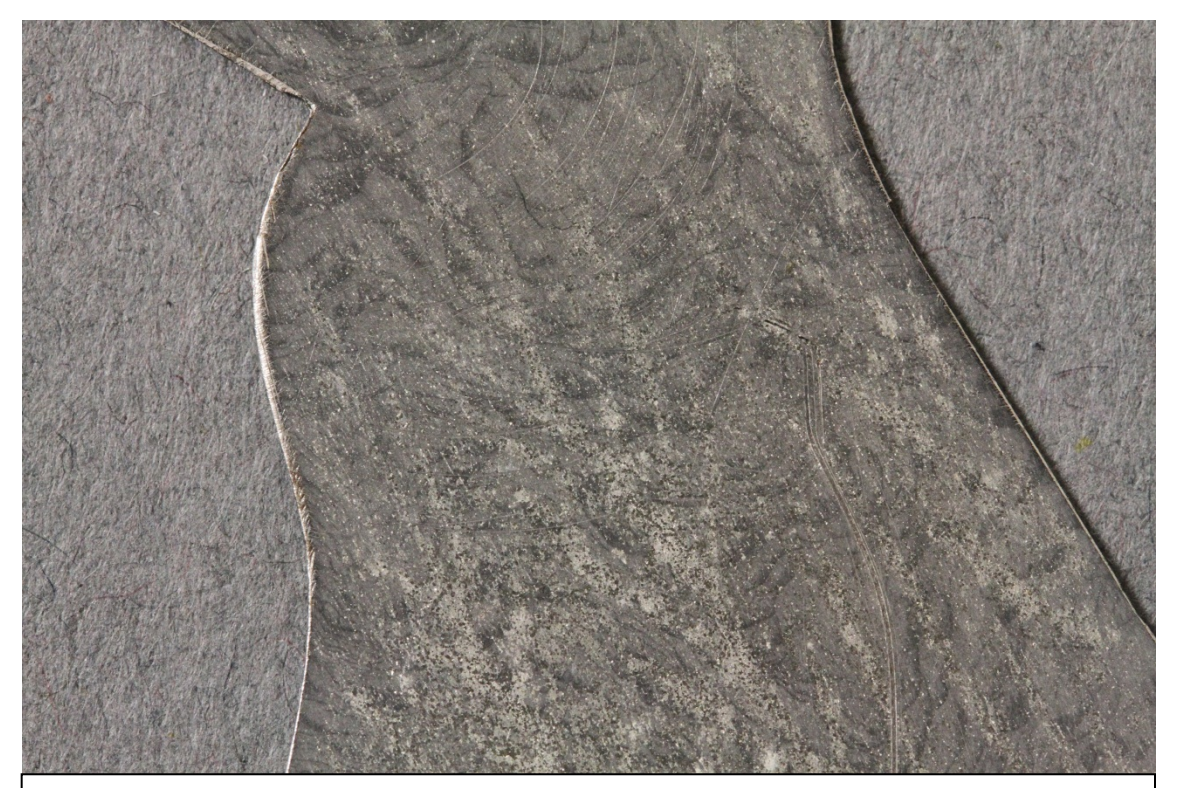
Fig.3 – Corrosion – Back center