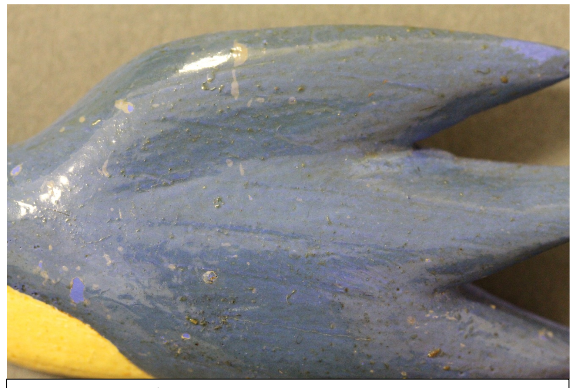
Fig.1 – Friable – Front left