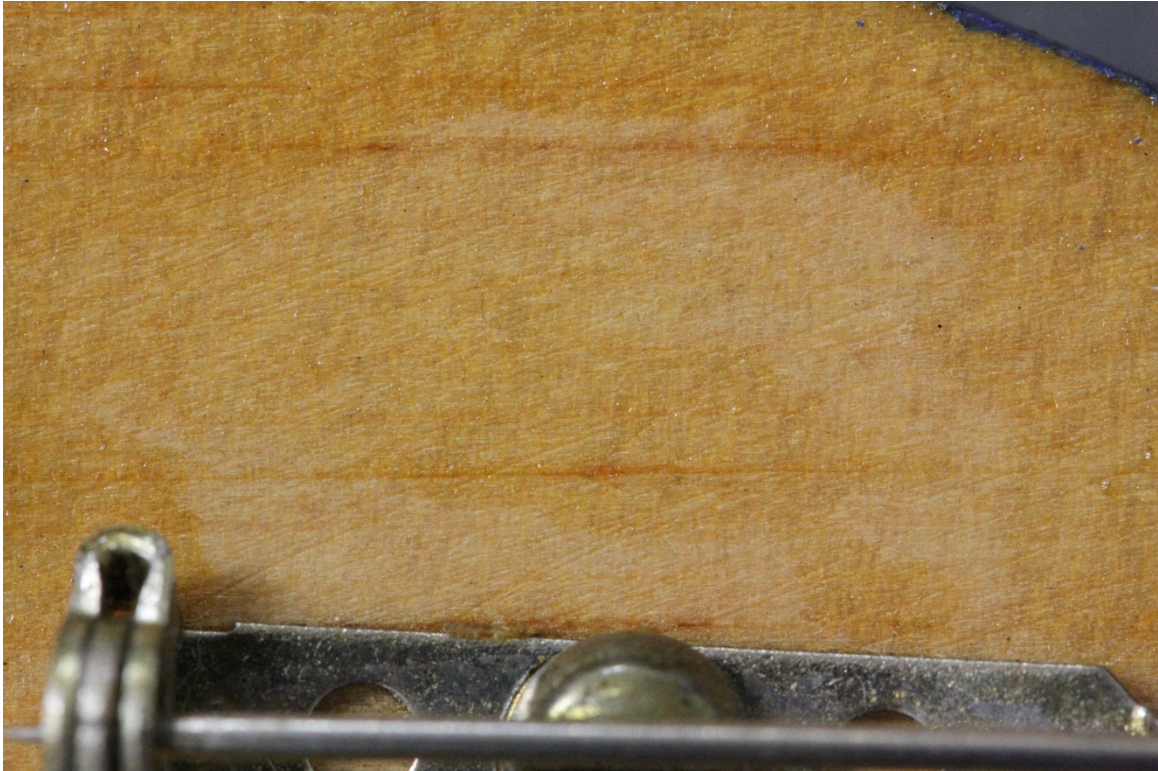
Fig.1 – Void – Back center