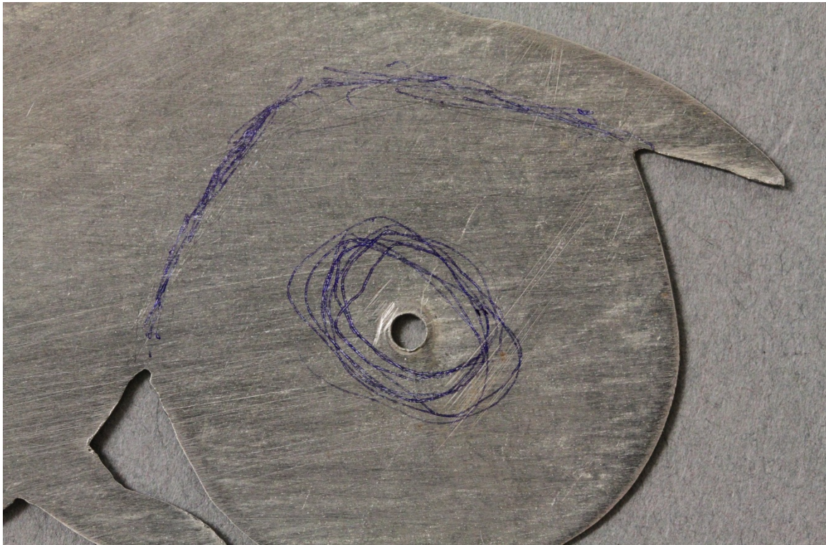
Fig.1 – Marking – Back top right