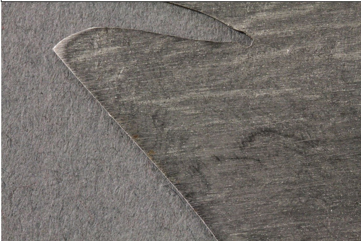
Fig.2 – Corrosion –Back