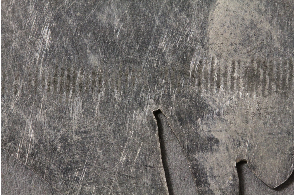
Fig.3 – Striation