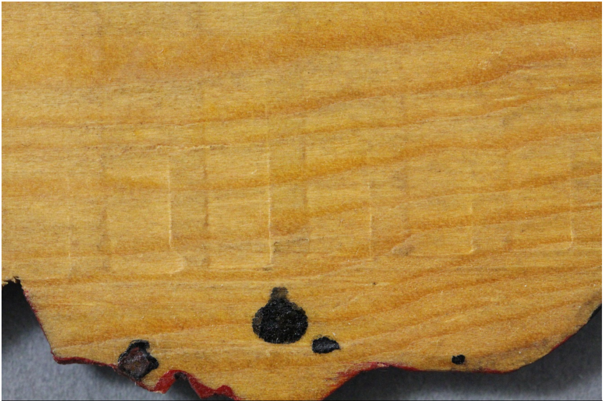
Fig.3 – Imprint – Back