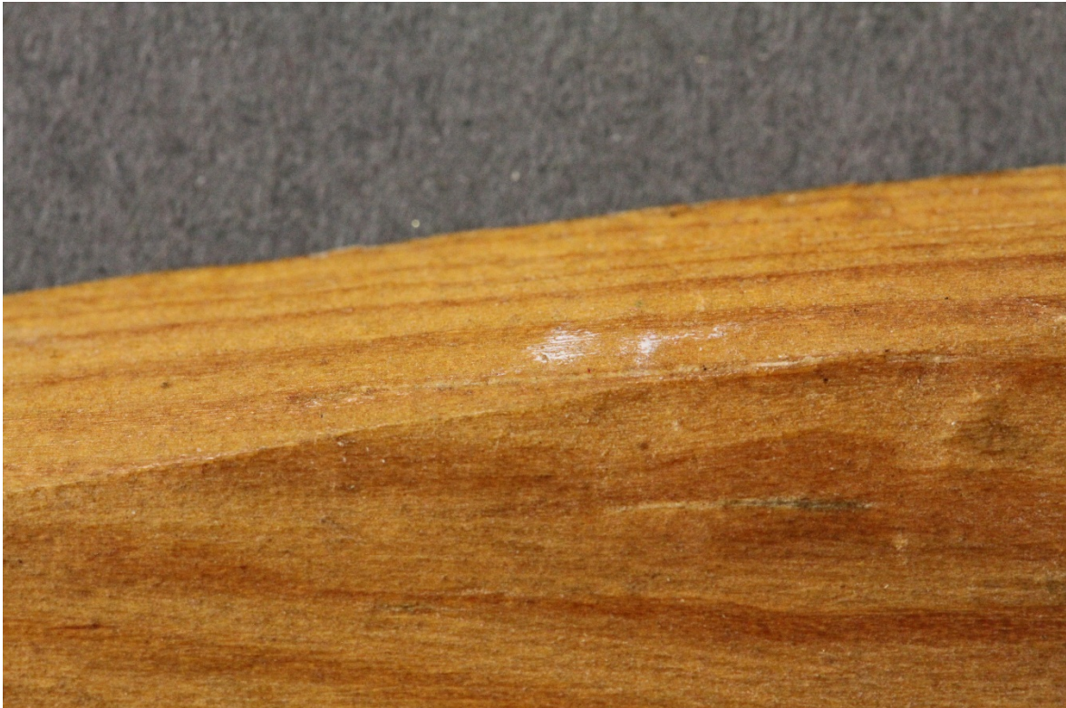
Fig.1 – Foreign Matter – Front center left