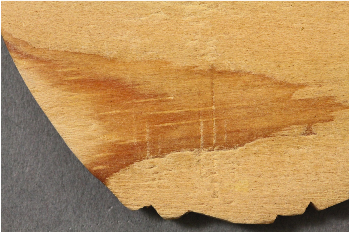
Fig.1 – Scratches – Back top