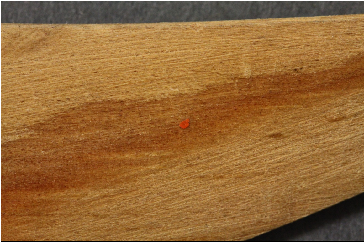
Fig.3 – Foreign Matter – Back bottom