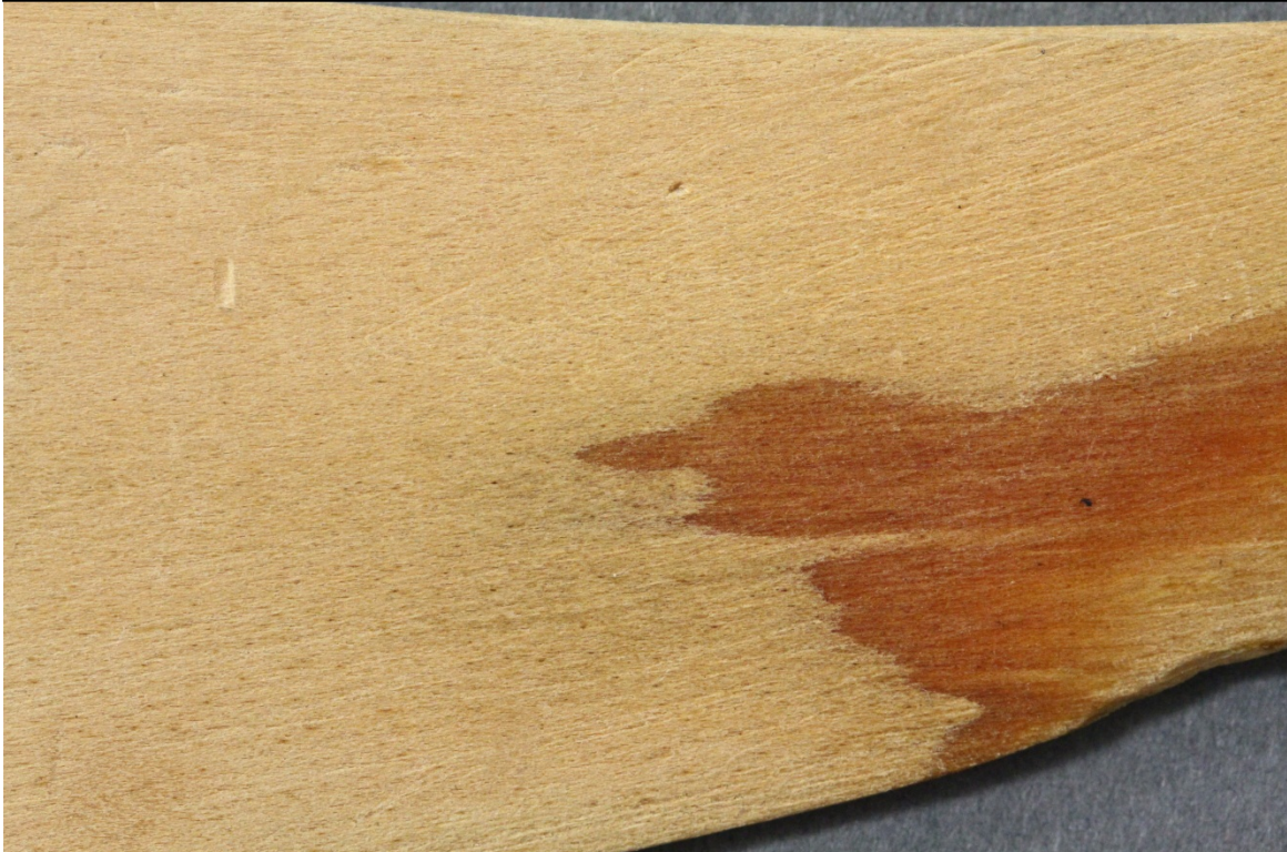
Fig.2 – Pitting– Back center