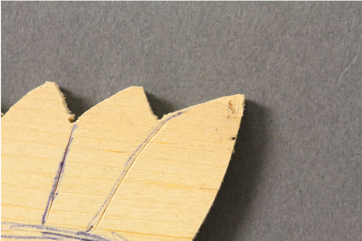
Fig.1 – Chipping – Front top