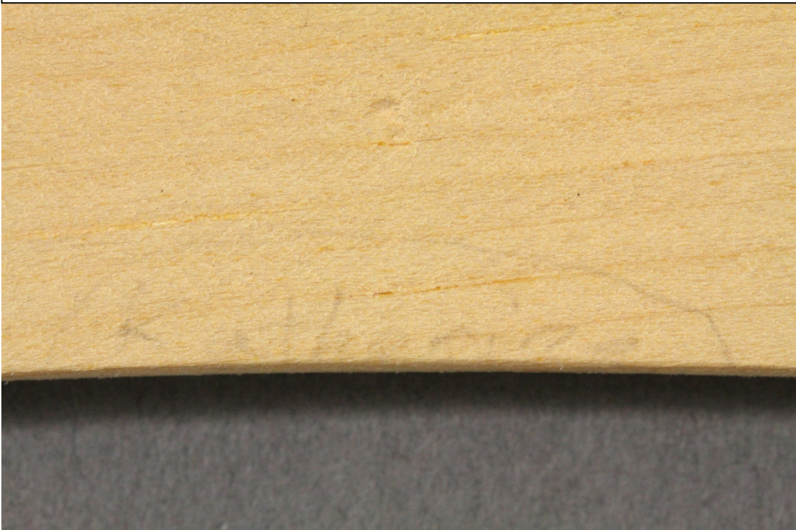
Fig.4 – Maker's Mark – Back right edge