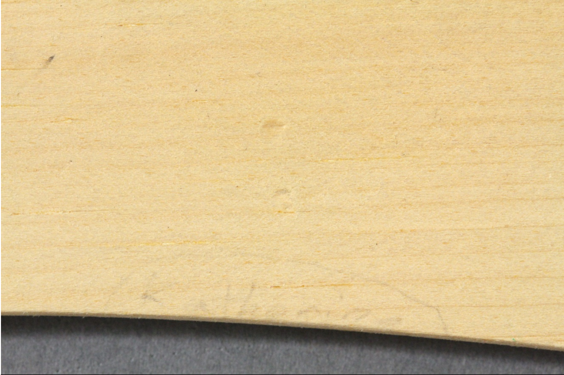
Fig.3 – Pitting – Back center