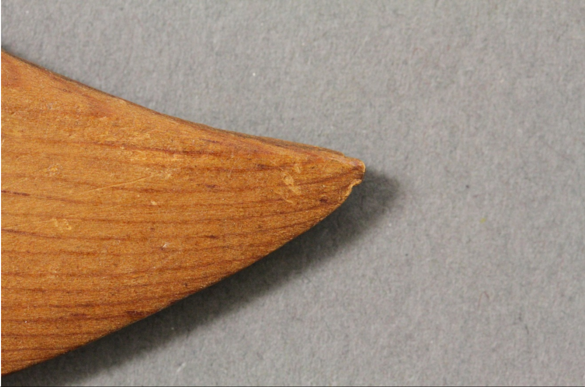
Fig.7 – Chipping – Back right tip