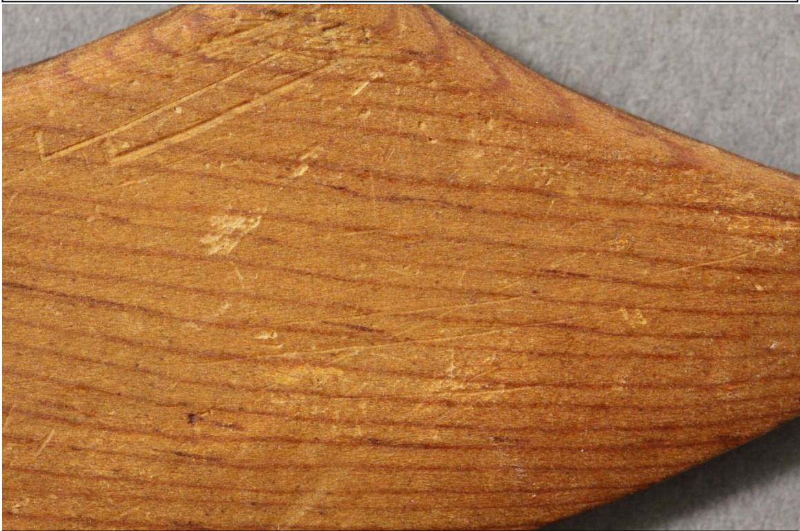
Fig.6 – Scratches – Back right