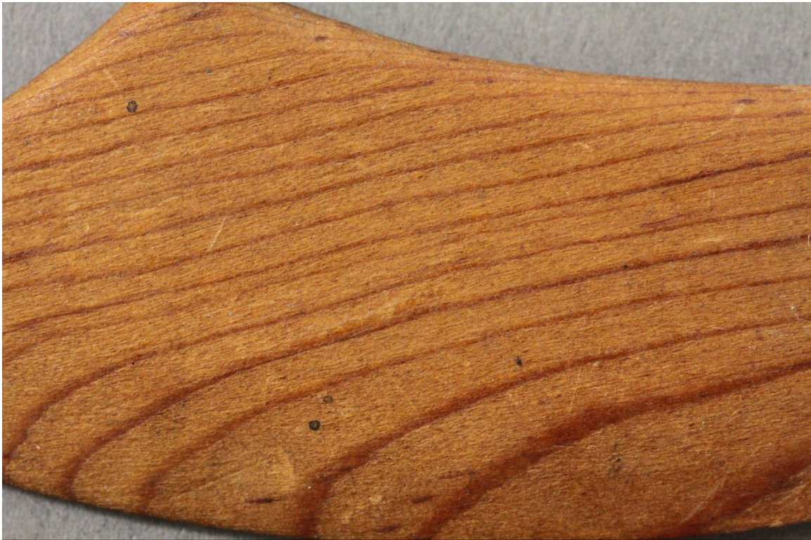
Fig.1 – Foreign Matter – Front left