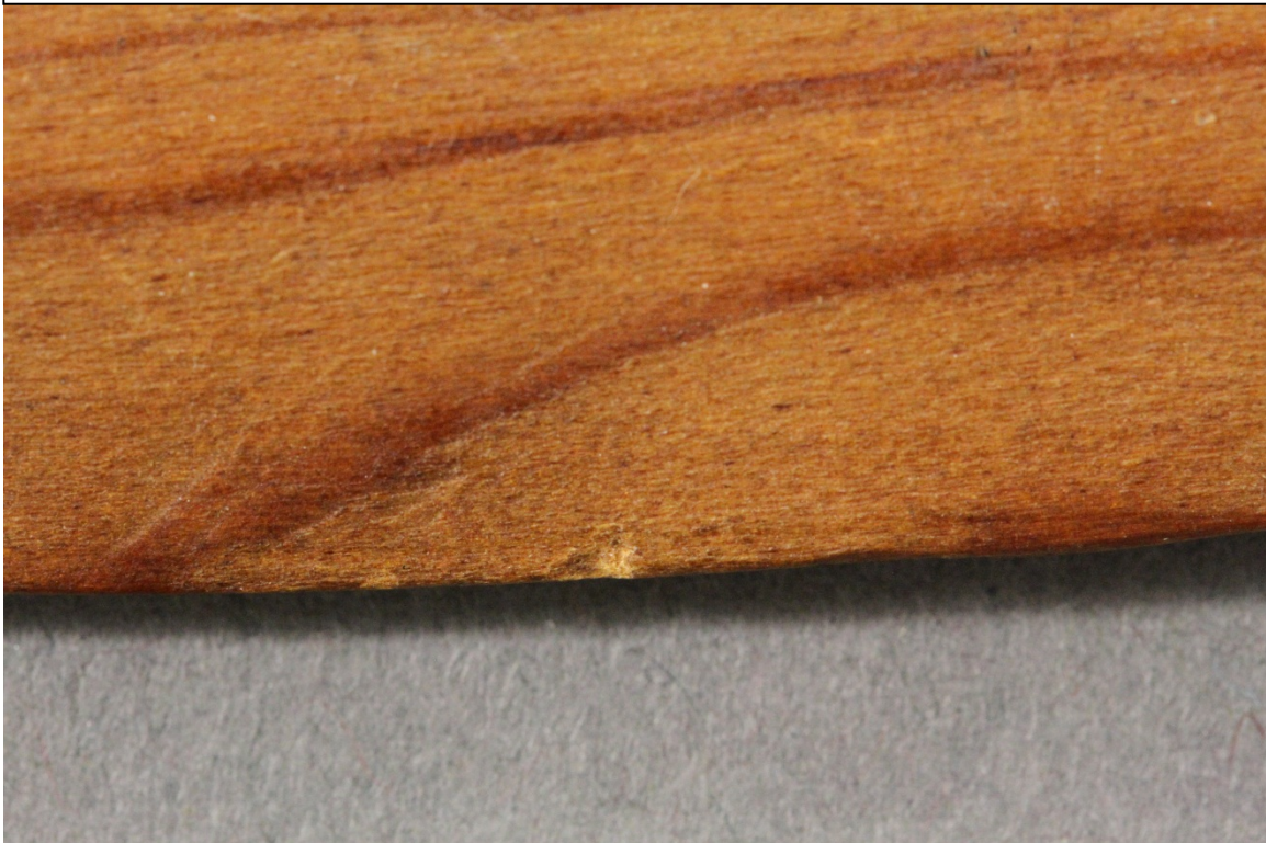
Fig.2 – Chipping – Front left