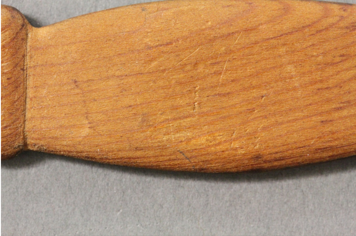
Fig.3 – Transfer – Back left