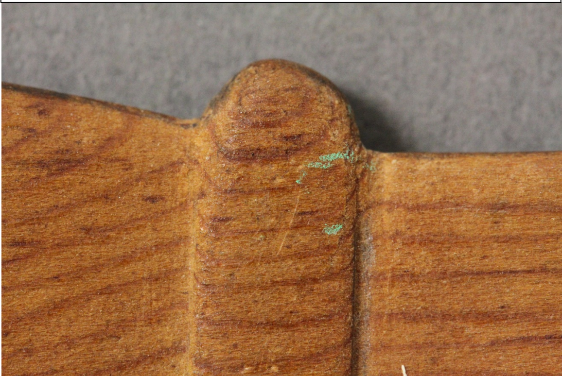
Fig.4 – Foreign Matter – Back left