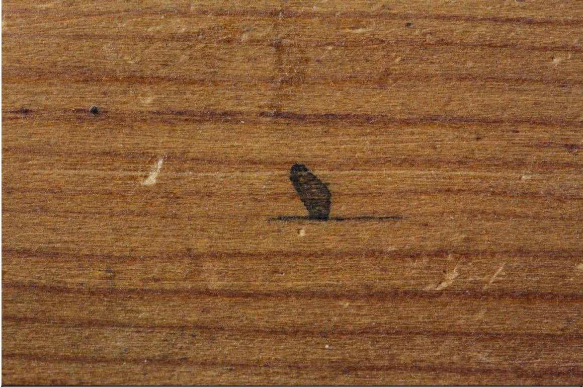
Fig.5 – Foreign Matter – Back center