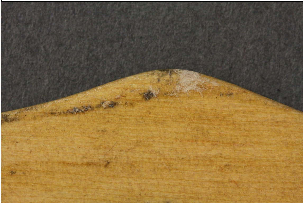
Fig.8 – Foreign Matter – Back top edge