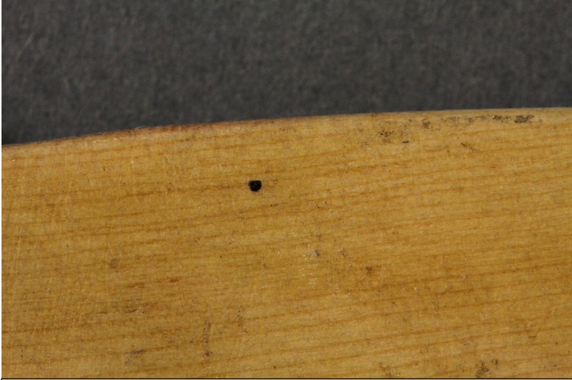
Fig.5 – Foreign Matter –Back left