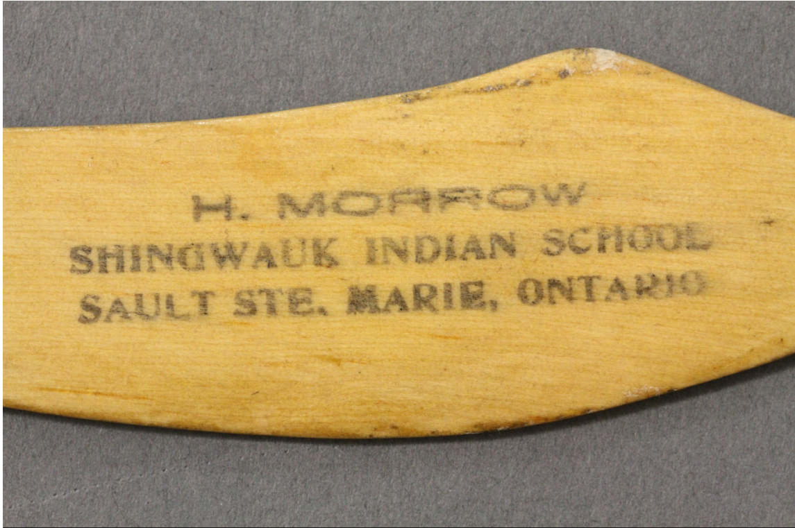
Fig.7 – Stamp – Back right