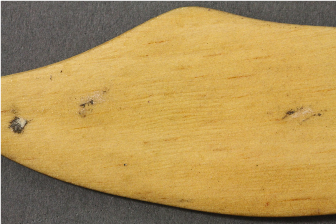
Fig.1 – Foreign Matter – Front left