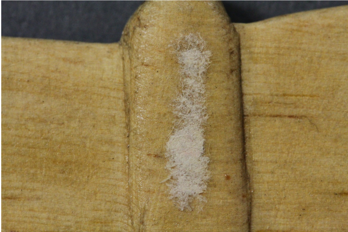
Fig.3 – Foreign Matter – Front center