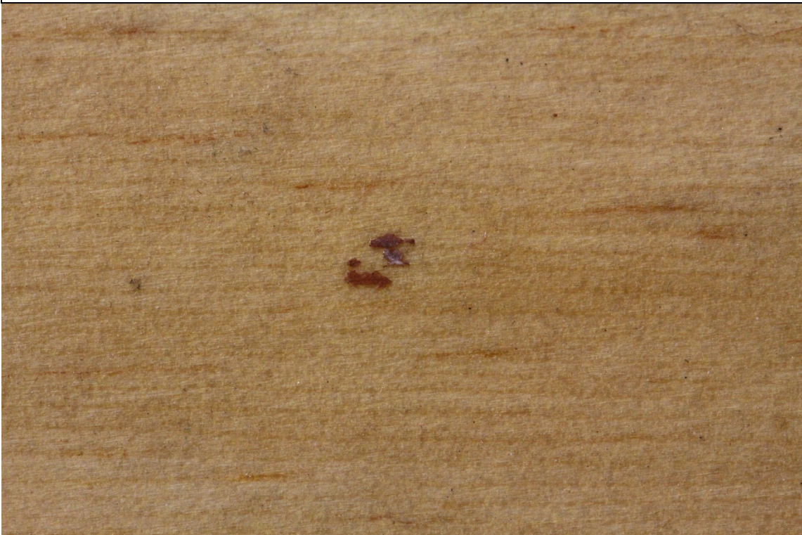
Fig.2 – Foreign Matter – Front center