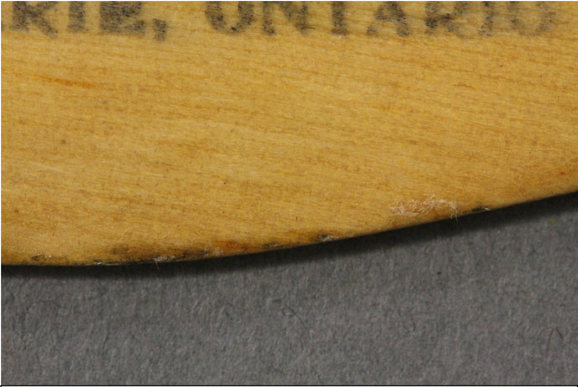
Fig.9 – Finish – Back bottom edge