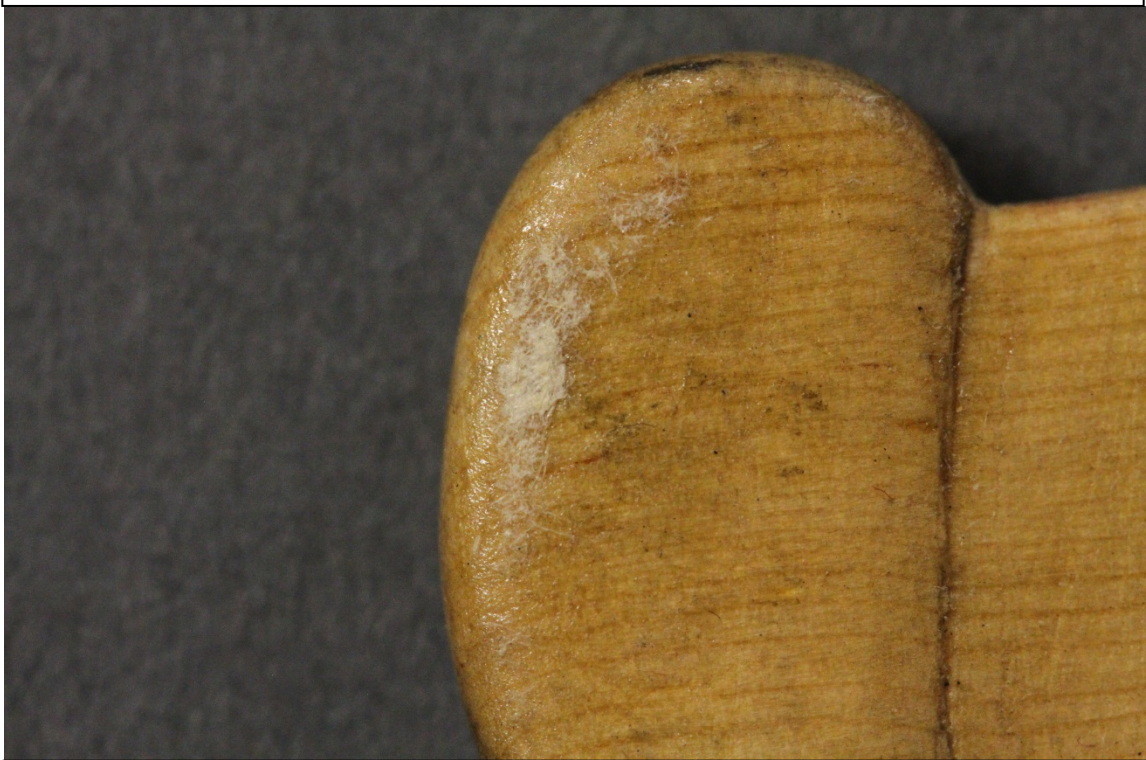
Fig.4 – Foreign Matter – Back left