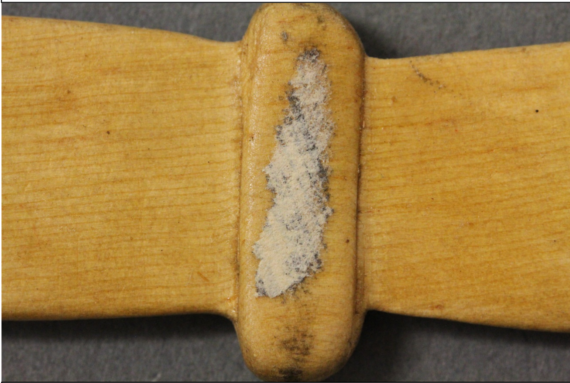
Fig.6 – Foreign Matter – Back center