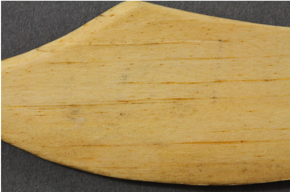
Fig.1 – Transfer – Front left