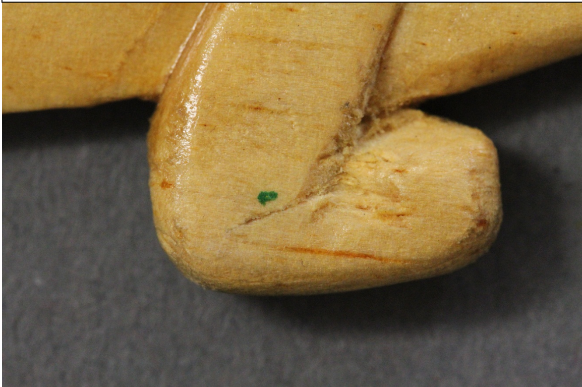
Fig.2 – Foreign Matter – Front center