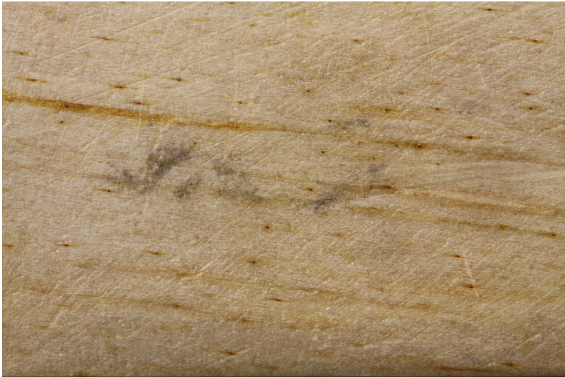
Fig.3 – Foreign Matter – Front right