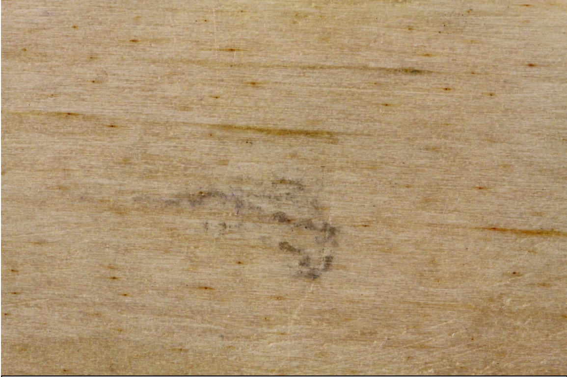
Fig.5 – Foreign Matter – Back right