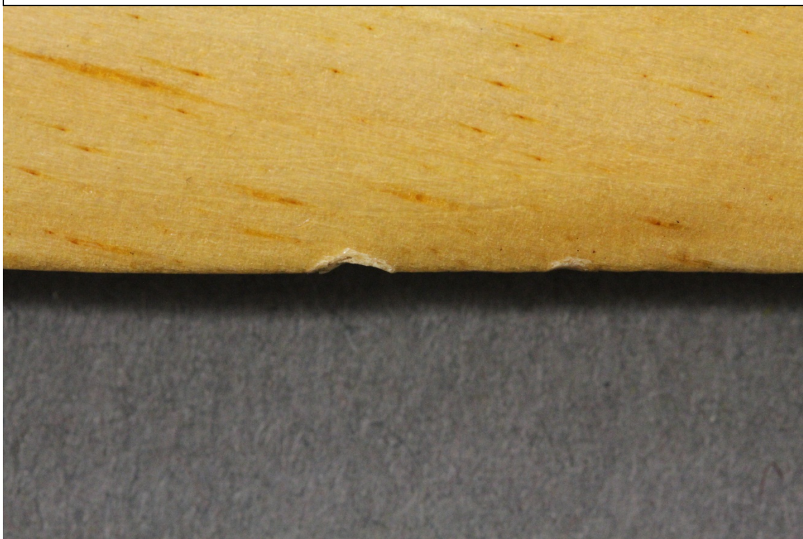
Fig.4 – Chipping – Front bottom center edge