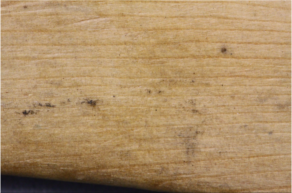
Fig.9 – Trace – Back left