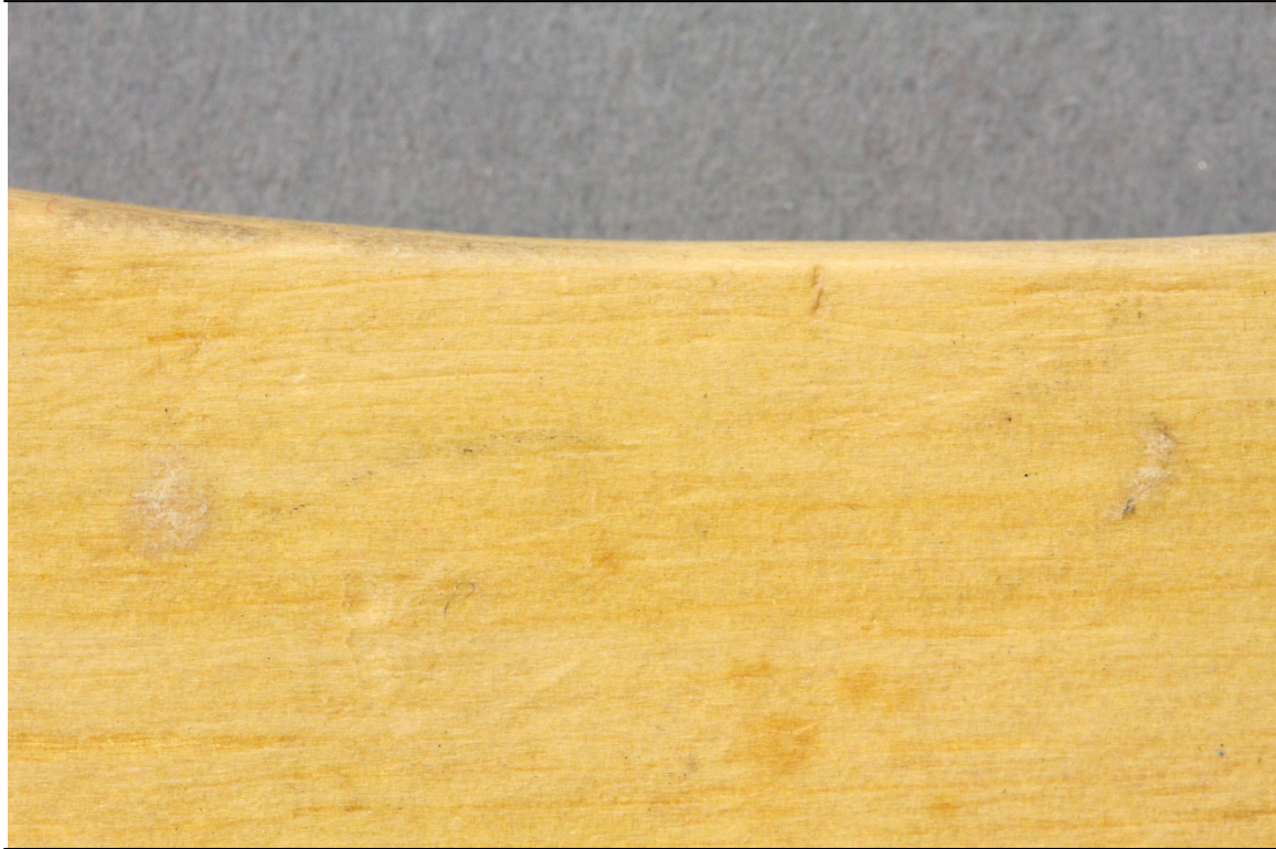
Fig.2 – Foreign Matter – Front center