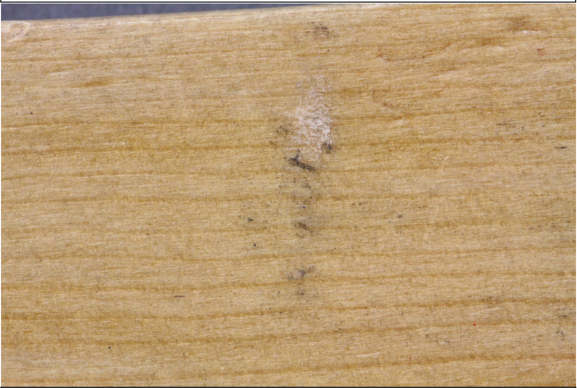
Fig.10 – Foreign Matter – Back center