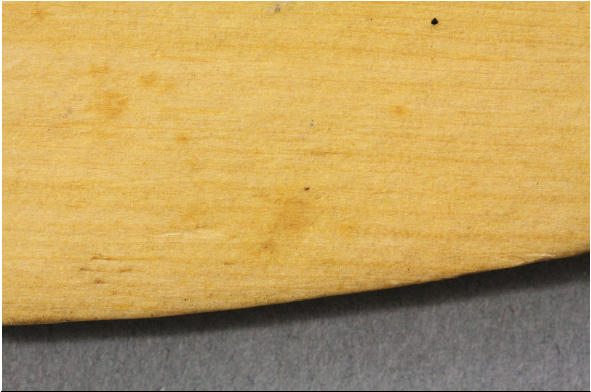
Fig.3 – Foreign Matter – Front center