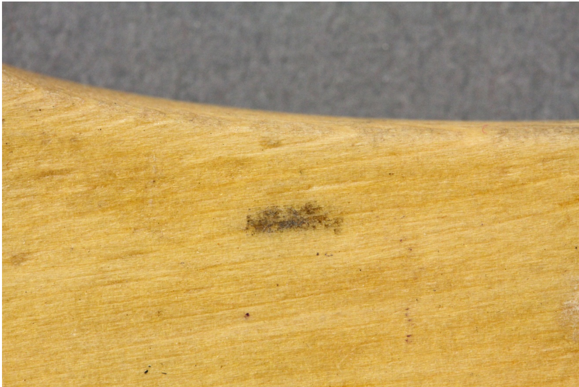
Fig.1 – Foreign Matter – Front left