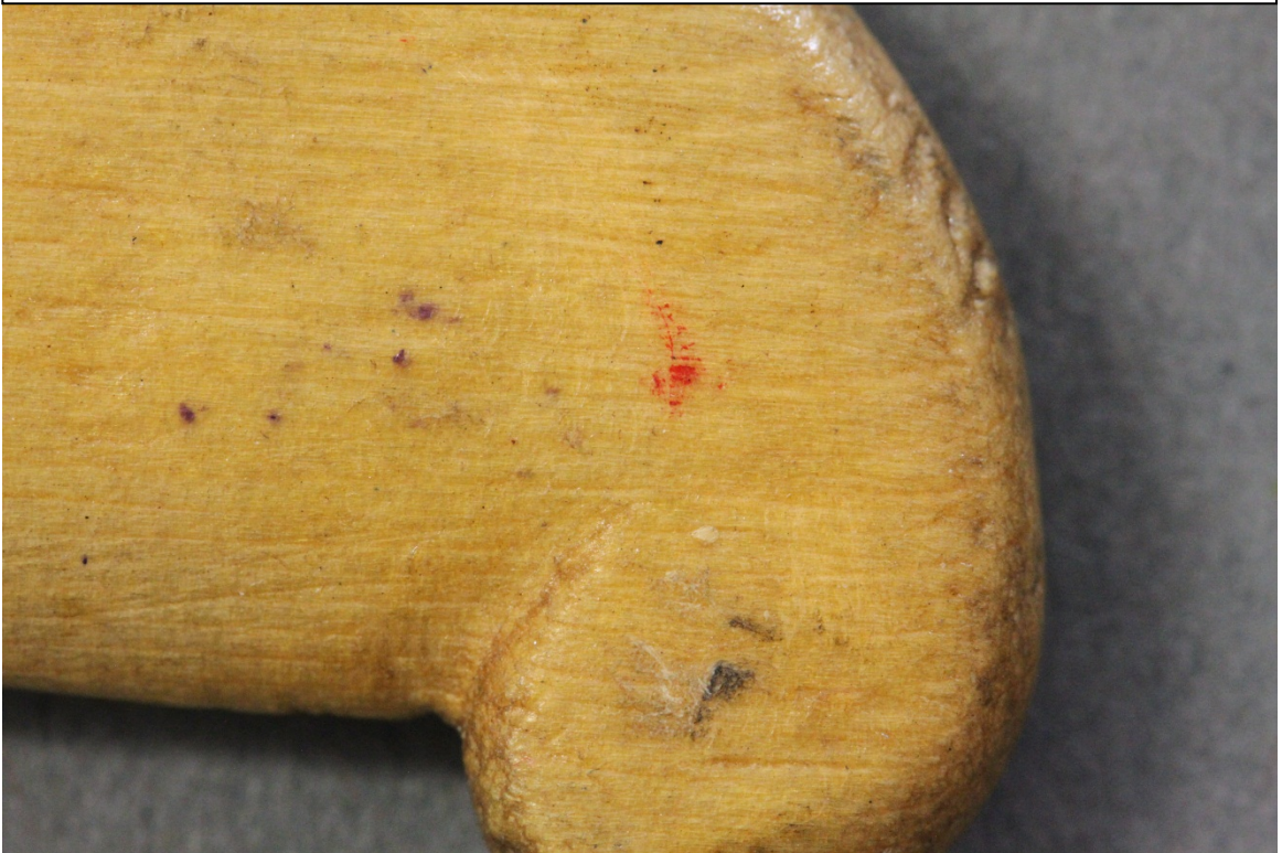
Fig.6 – Foreign Matter – Front right