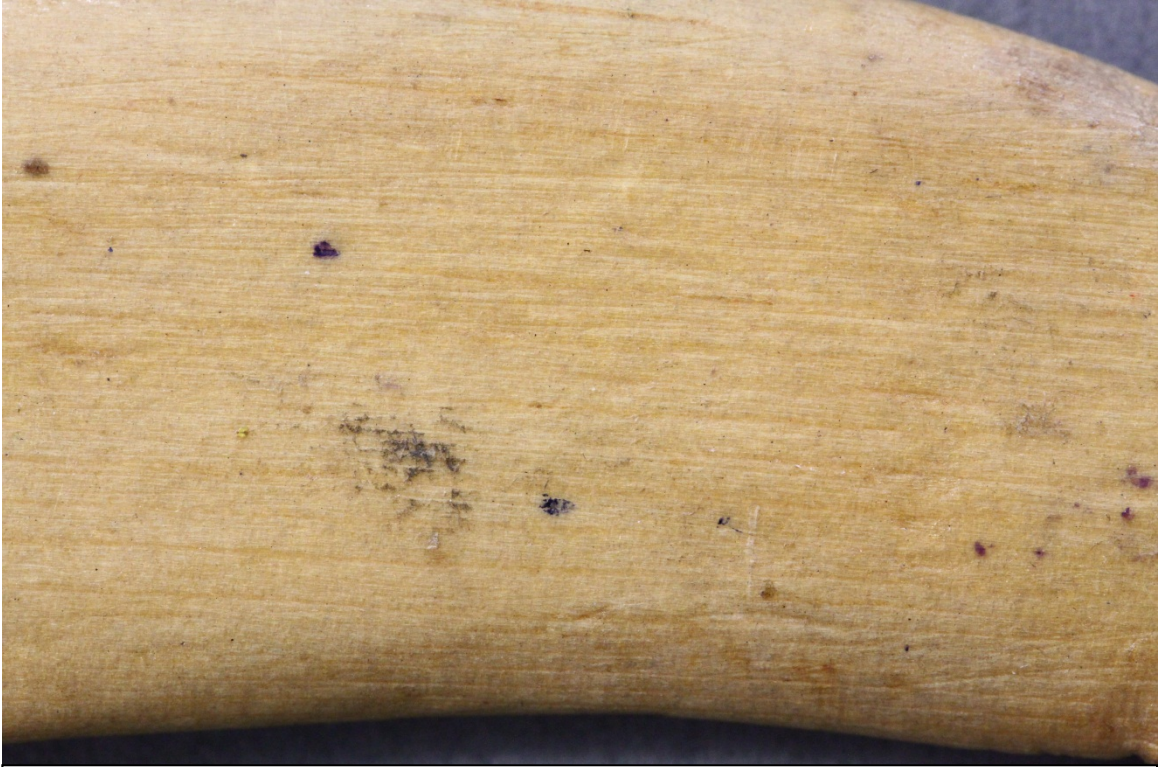
Fig.5 – Foreign Matter – Front right