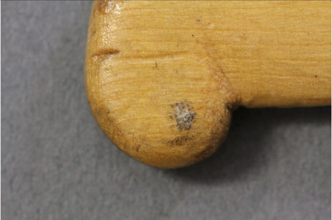
Fig.8 – Foreign Matter – Back left