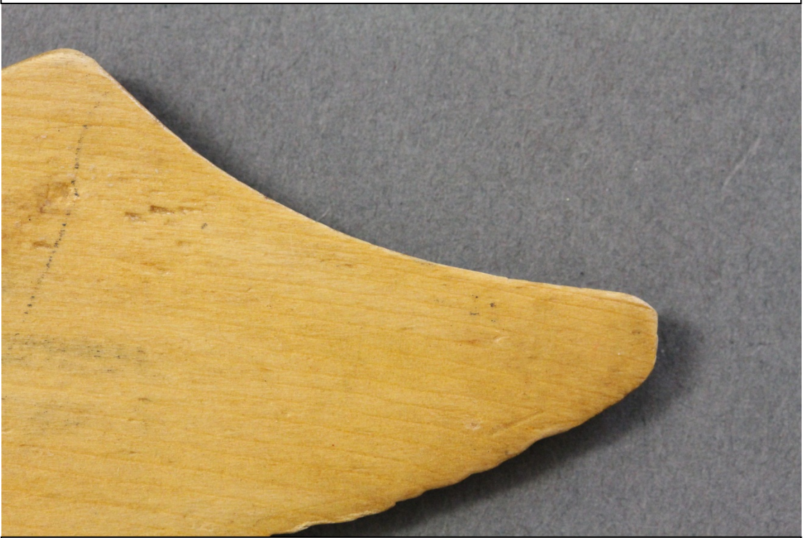
Fig.12 – Chipping – Back top right