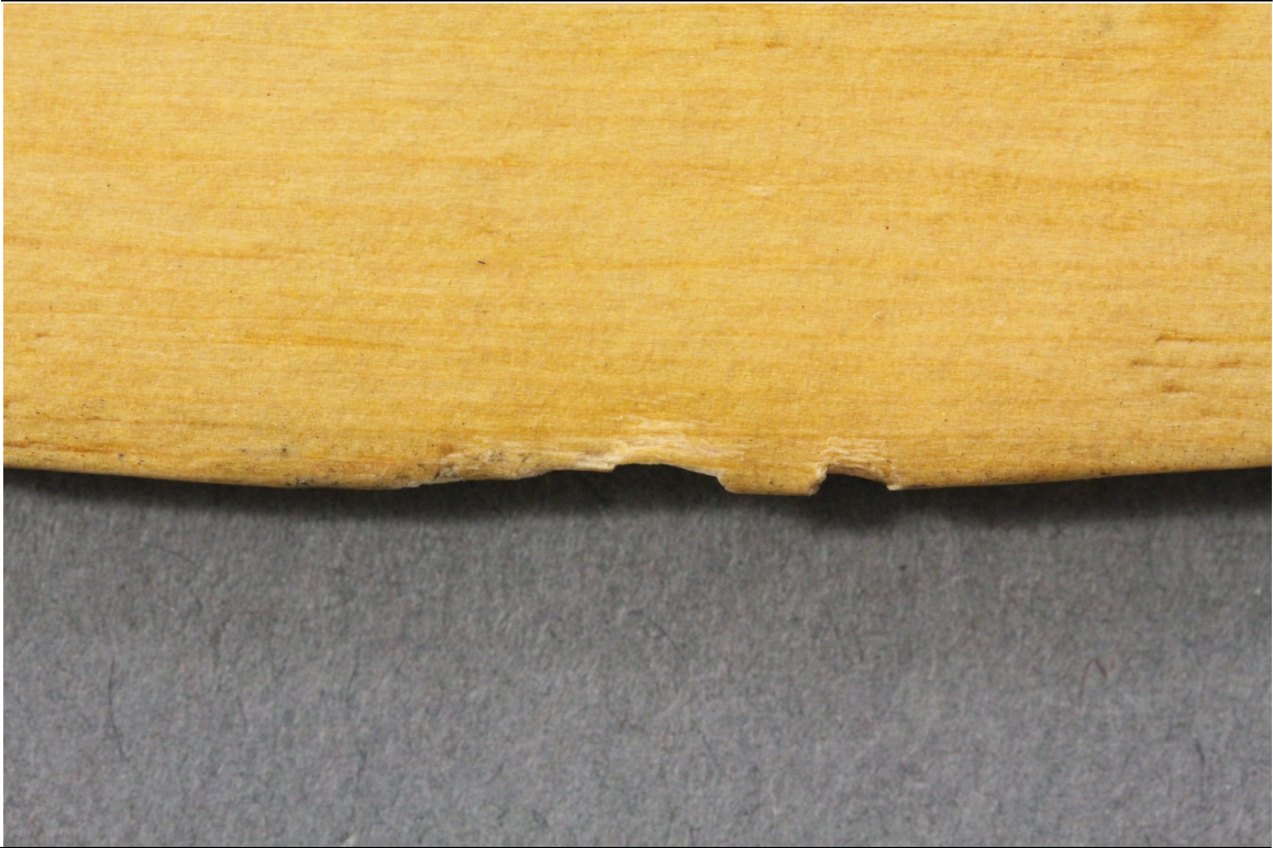
Fig.4 – Chipping/Gouge – Bottom left edge