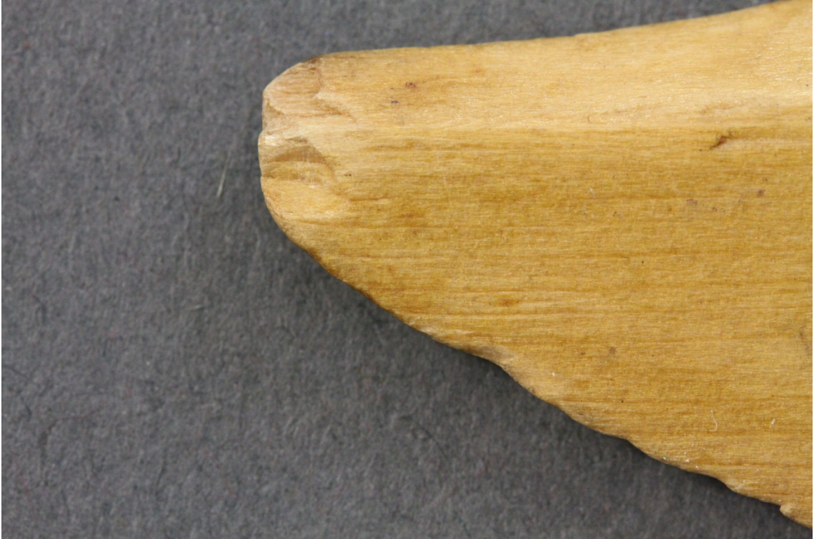
Fig.7 – Chip – Front left tip