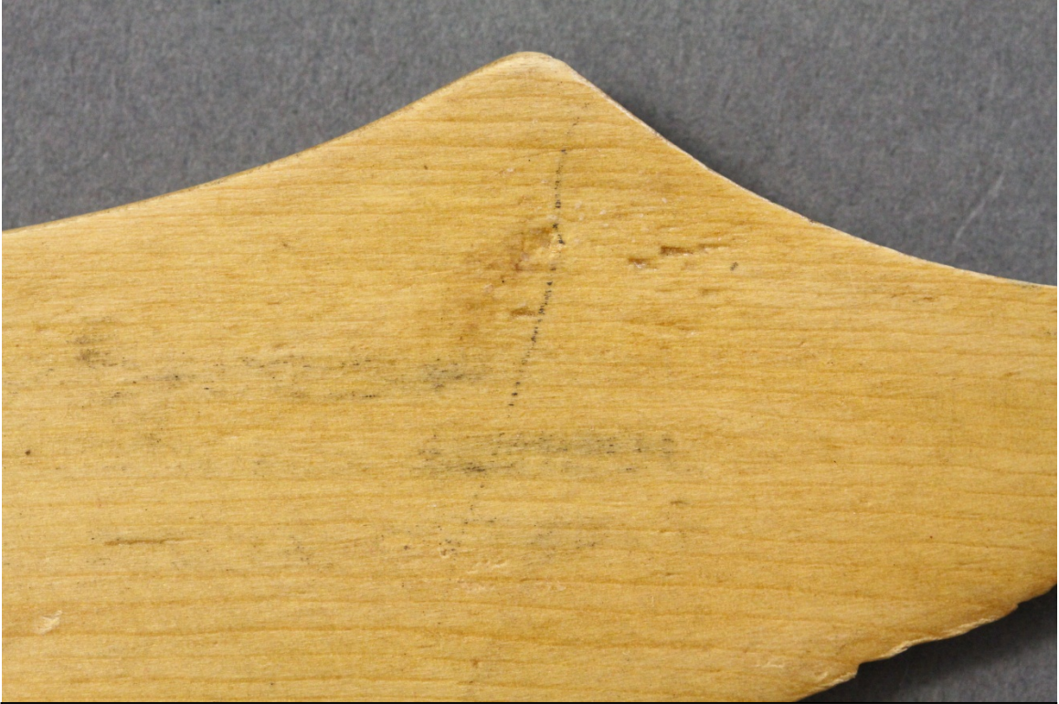
Fig.11 – Trace – Back right