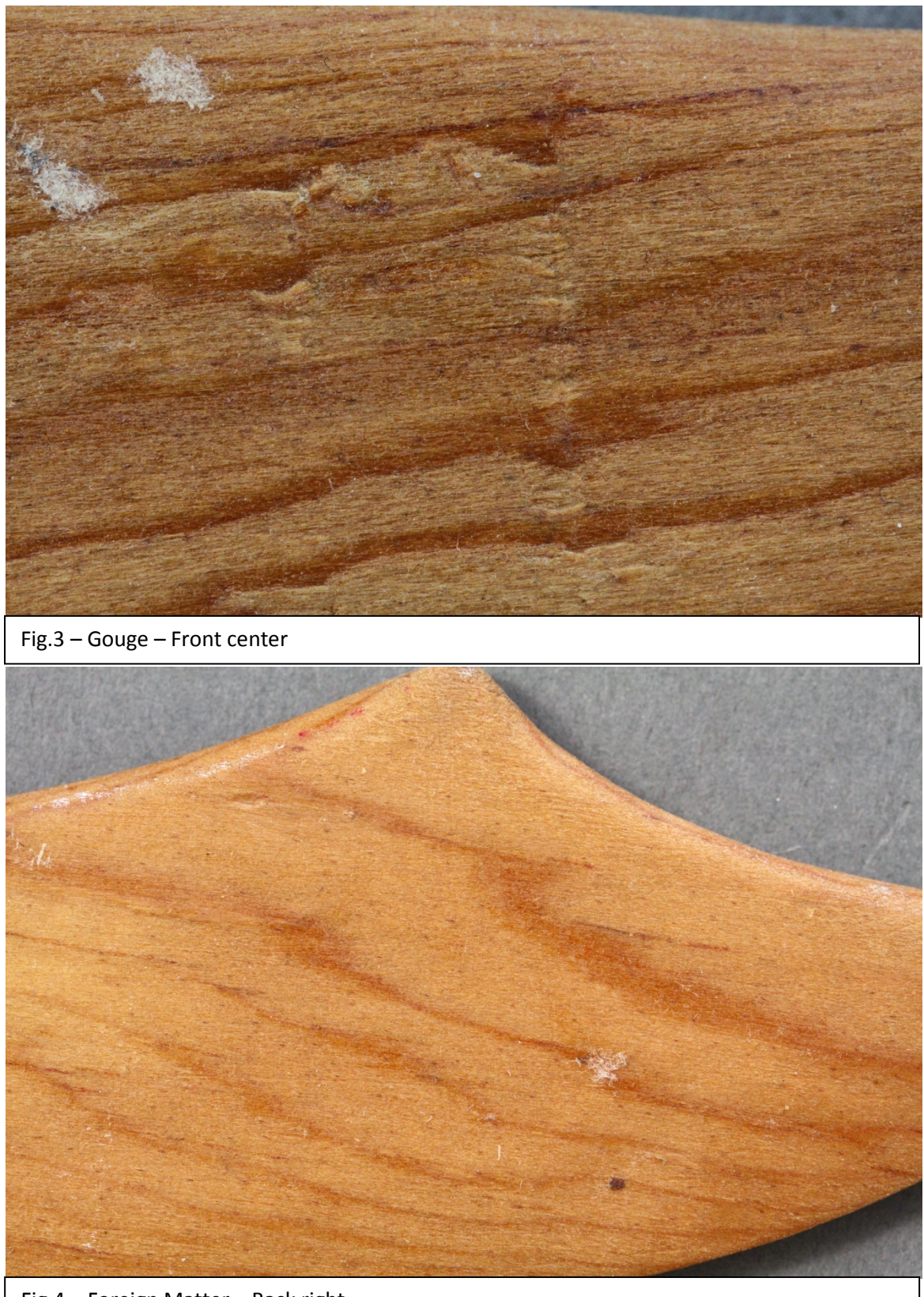
Fig.4 – Foreign Matter – Back right