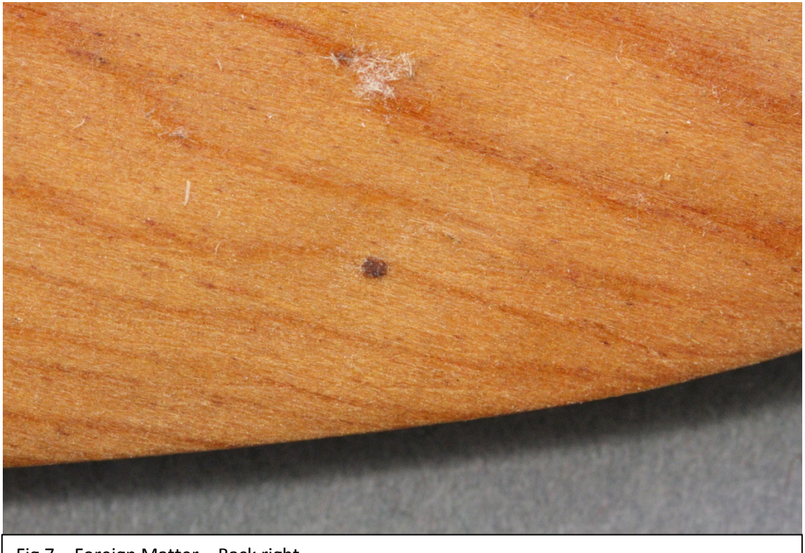
Fig.7 – Foreign Matter – Back right