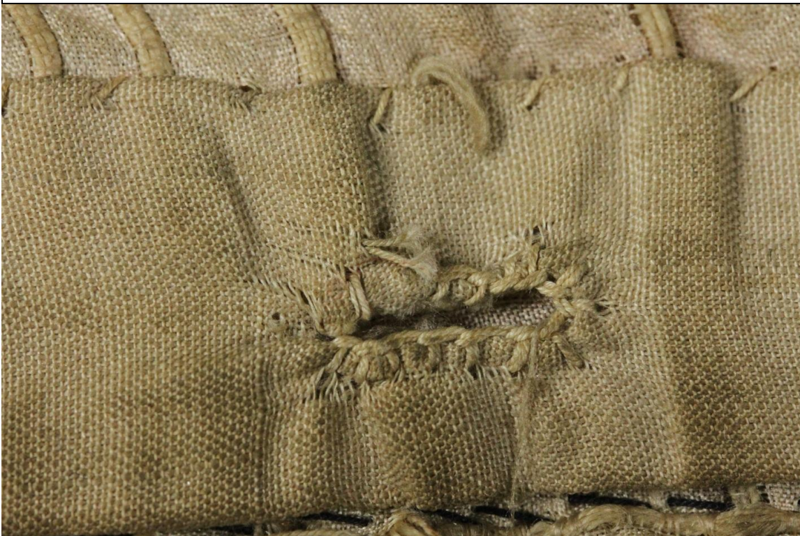
Fig. 4 – Loose textile – Back center