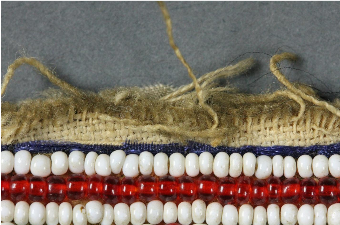
Fig. 1 – Frayed Edging – Lower front center