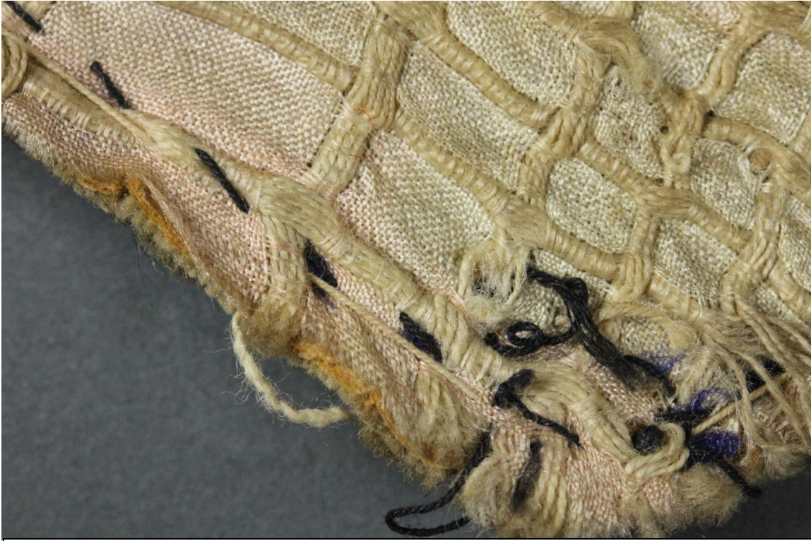
Fig. 5 – Repair stitching – Top back left corner