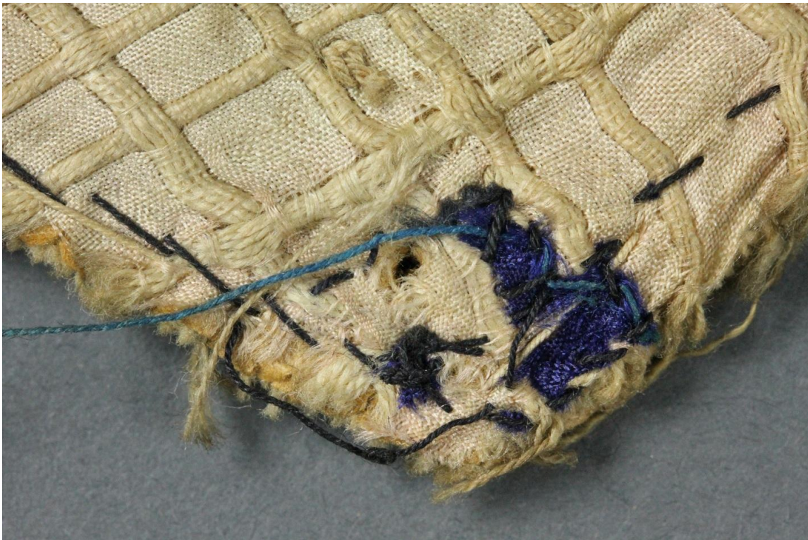
Fig. 3 – Missing Trim Textile – Back Top right corner edge