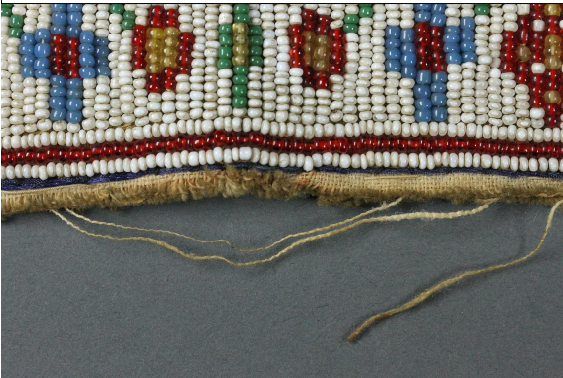
Fig. 2 – Loose Threads – Lower front center