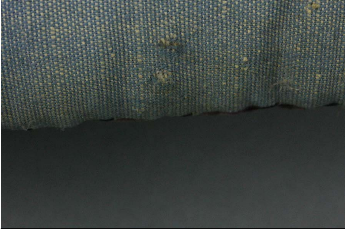
Fig.11 – Holes – Back center right side edge