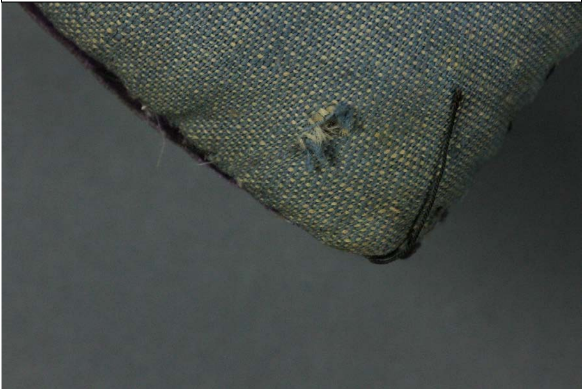
Fig.12 – Hole – Back bottom right corner