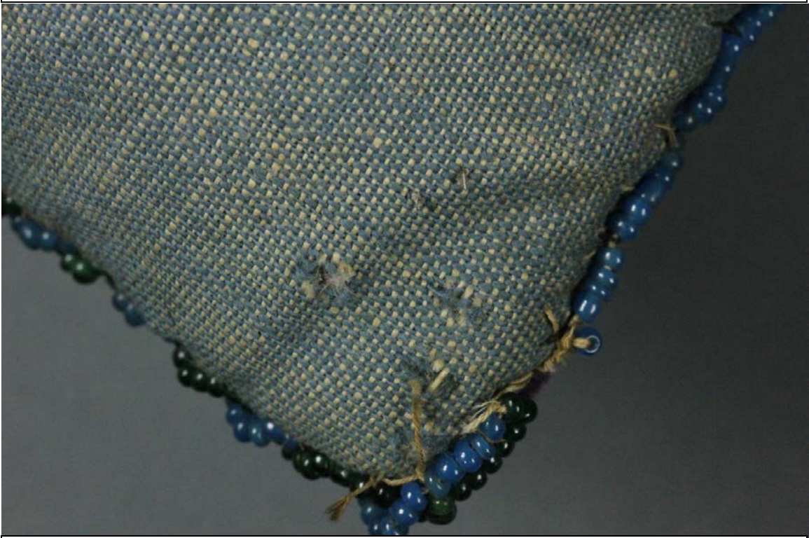
Fig.8 - Holes – Bottom back left corner