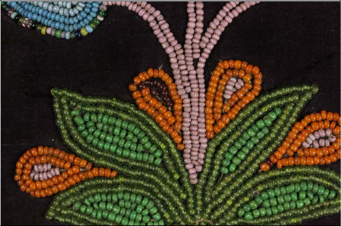
Fig.6 – Ink markings – Front center right side