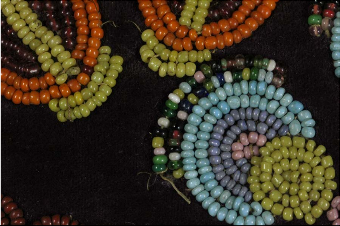
Fig.5 – Loose threads – Front upper left