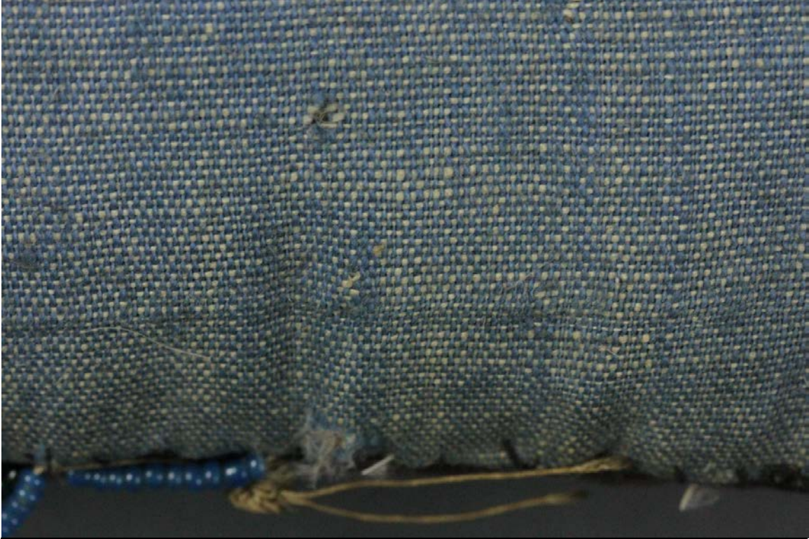
Fig.7 – Hole – Lower back center