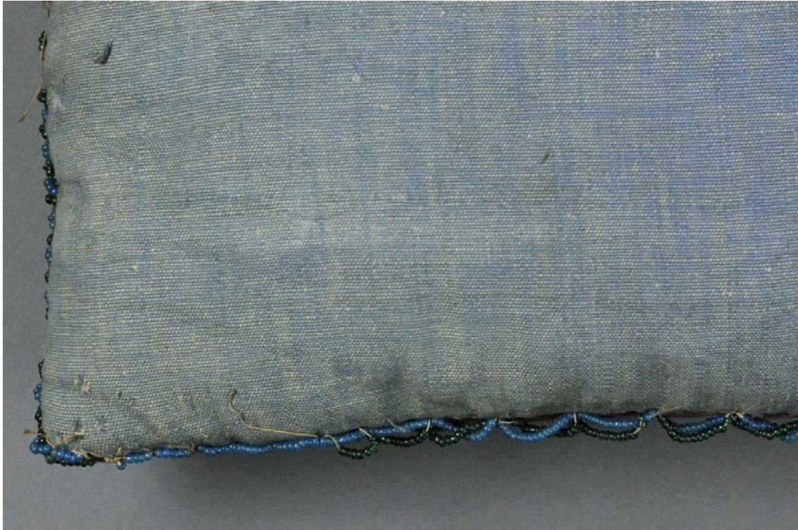
Fig.9 – Discolouration – Lower back left side