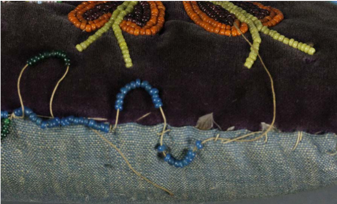
Fig.1 – Loose beads – Top left edge