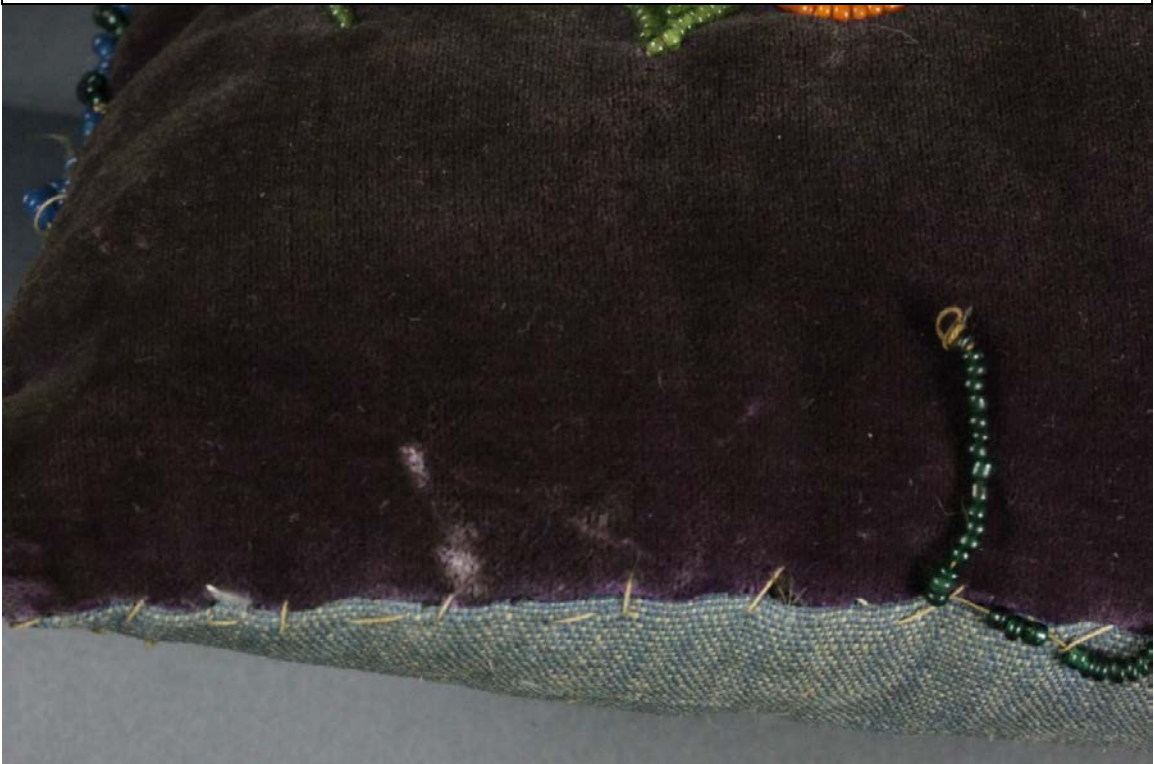
Fig.4 – Missing beads – Top right edge