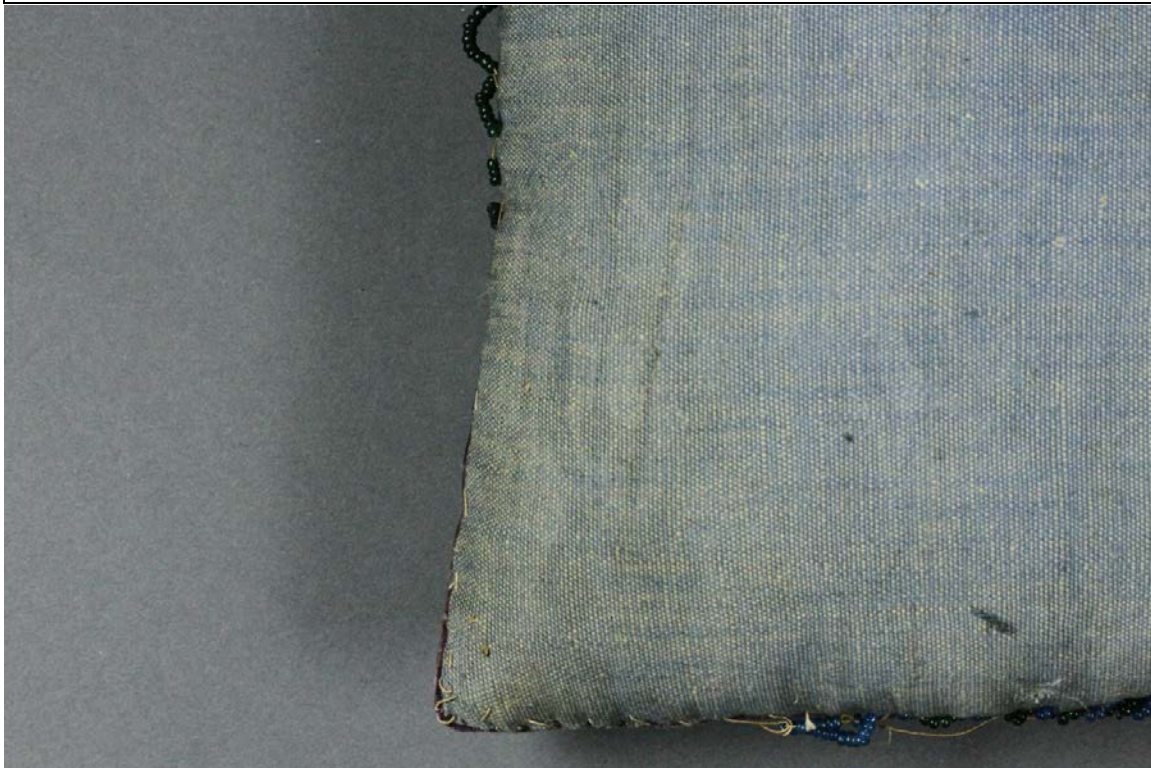
Fig.10 – Discolouration – Lower back right side