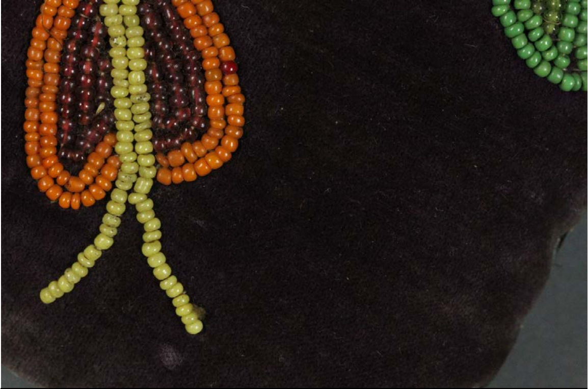
Fig.3 – Dirt – Top front left corner and beads