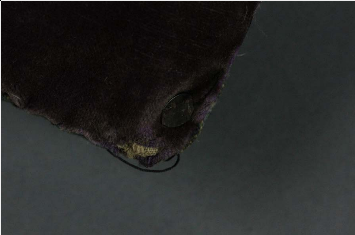
Fig.2 – Loose beads – Top right edge